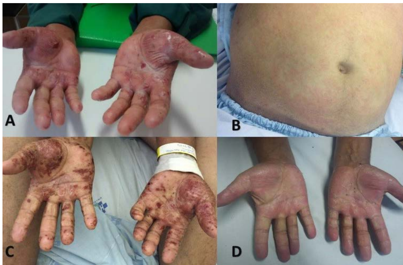
FIGURE 1. A) Erythematous, pruritic, scaly and flaky lesions on hands and B) abdomen (at tenth week of HCV treatment). C) Peeling areas, break blisters, skin fissures with bleeding and signs of secondary infection on hands (one week after the end of HCV treatment). D) Improvement of skin lesions after one week of a higher dose of prednisone and intravenous antibiotic.

A 49 year-old man with HCV related liver cirrhosis, genotype 1 and alcohol abuse was referred to our outpatient clinic for HCV therapy assessment. He was HCV treatment naïve, with arterial hypertension, diabetes, anxiety disorder and a tobacco user. He denied previous gastrointestinal bleeding, ascites or hepatic encephalopathy. He had a compensated liver function (Child-Pugh A, MELD 6), with a liver stiffness by Fibroscan® of 47.2 kPascal, compatible with Metavir F4 (cirrhosis). The upper digestive endoscopy revealed portal hypertension with esophageal varices. Baseline exams were as follows: hemoglobin: 15 mg/dL, leukocytes: 8,710/mm 3 , platelet count: 193,000/mm 3 , total bilirubin: 0.99 mg/dL [reference value (RV) < 1.2], urea: 41 mg/dL (RV < 43), creatinine: 0.9 mg/dL (RV < 1,2), alanine aminotransferase: 82 IU/L (RV < 50), aspartate aminotransferase: 48 IU/L (RV < 50), alkaline phosphatase: 117 IU/L (RV < 120), gamma glutamyl transferase: 300 IU/L (RV < 38), albumin: 4.0 g/dL (RV 3.5-5.2), INR: 0.9 (RV