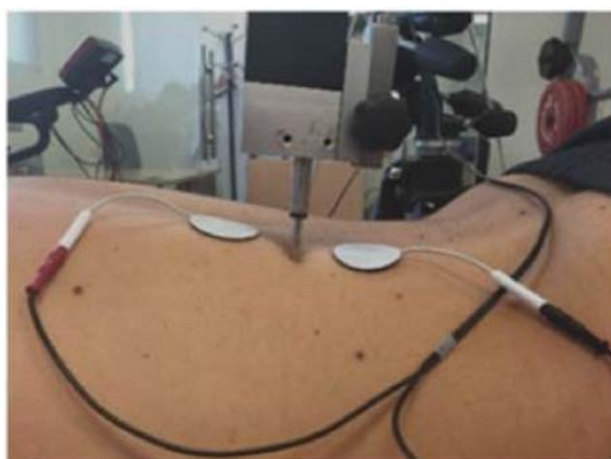
Fig. 2. TMG electrodes and digital displacement transducer placed perpendicular to the erector spinae muscle belly. Abbreviations: TMG, tensiomyography.