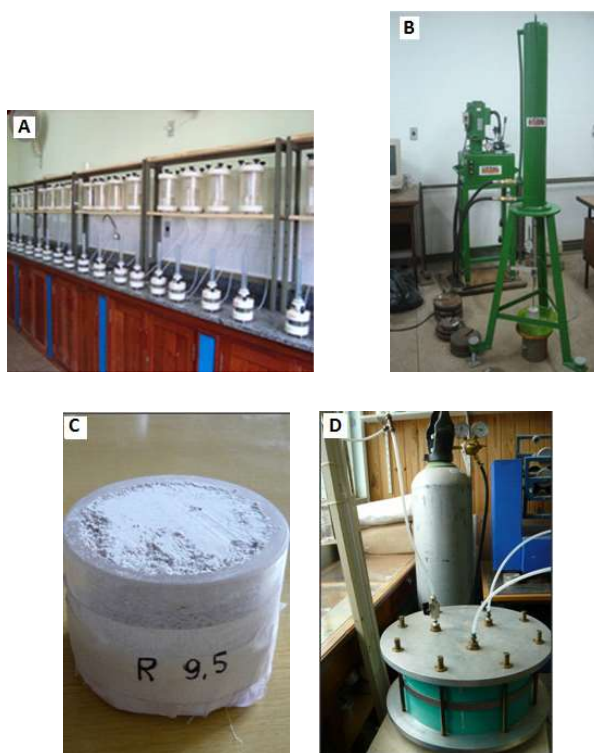
Figure 1 – The system used for running permeability tests under constant head (A), the quasi-static cone penetrometer system (B), the process of lime addition to the testing specimens (C) and the hermetically closed chamber used for \text{CO}_2 enrichment (D).

Figures 1A, 1B, 1C, and 1D depict, respectively, the equipment used for the determination of the hydraulic conductivity, the equipment for the measurement of