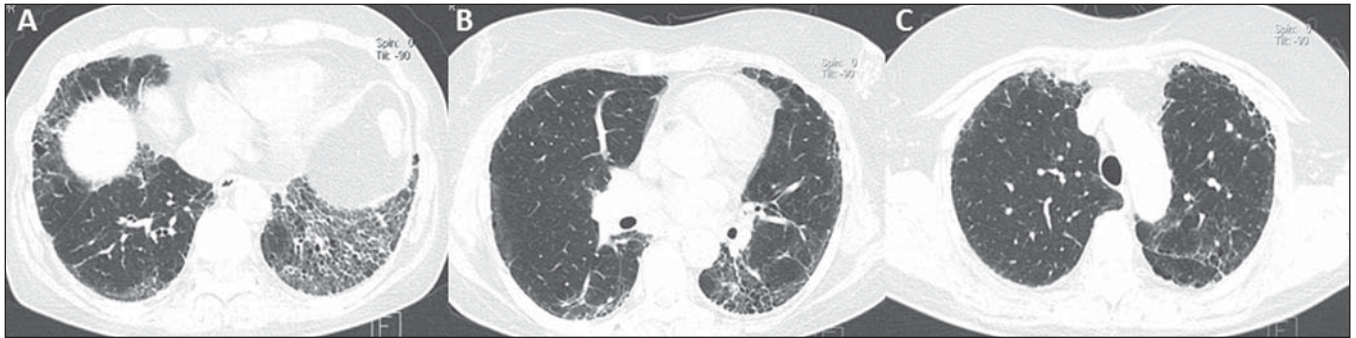
Figure 1. HRCT of the lower (A), middle (B) and upper (C) thirds of the lung.

A female, 58-year-old patient with muscle pain in upper and lower limbs associated with mild dyspnea and bibasilar stertor was referred to the imaging center to undergo high-resolution computed tomography (HRCT) (Figures 1, 2 and 3).