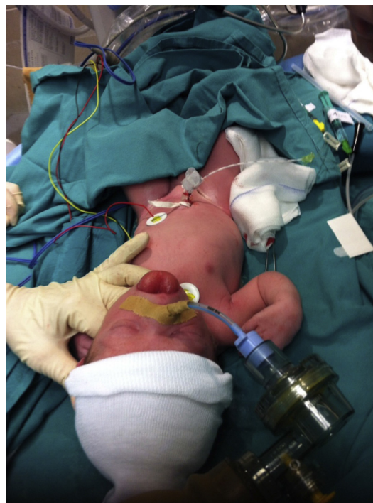
Figure 3 Nasotracheal intubation of the newborn.

Face mask oxygenation was performed with 100% oxygen for 5 min and midazolam (2 mg) was administered. Rapid sequence induction was initiated with thiopental 300 mg (4 mg/kg), rocuronium 40 mg (0.6 mg/kg), fentanyl 0.05 mg, Sellick maneuver, and tracheal intubation with a 7.5-cuffed tube. General anesthesia was maintained with 2–3% sevoflurane and remifentanyl (0.1–0.5 \mu g/kg/min). After induction of anesthesia, midazolam 1 mg, fentanyl 0.1 mg, and rocuronium 10 mg were given. For the maintenance of maternal systolic blood pressure above 100–120 mmHg it was necessary to administer ephedrine 5 mg and hydroxyethyl starch 500 mL.