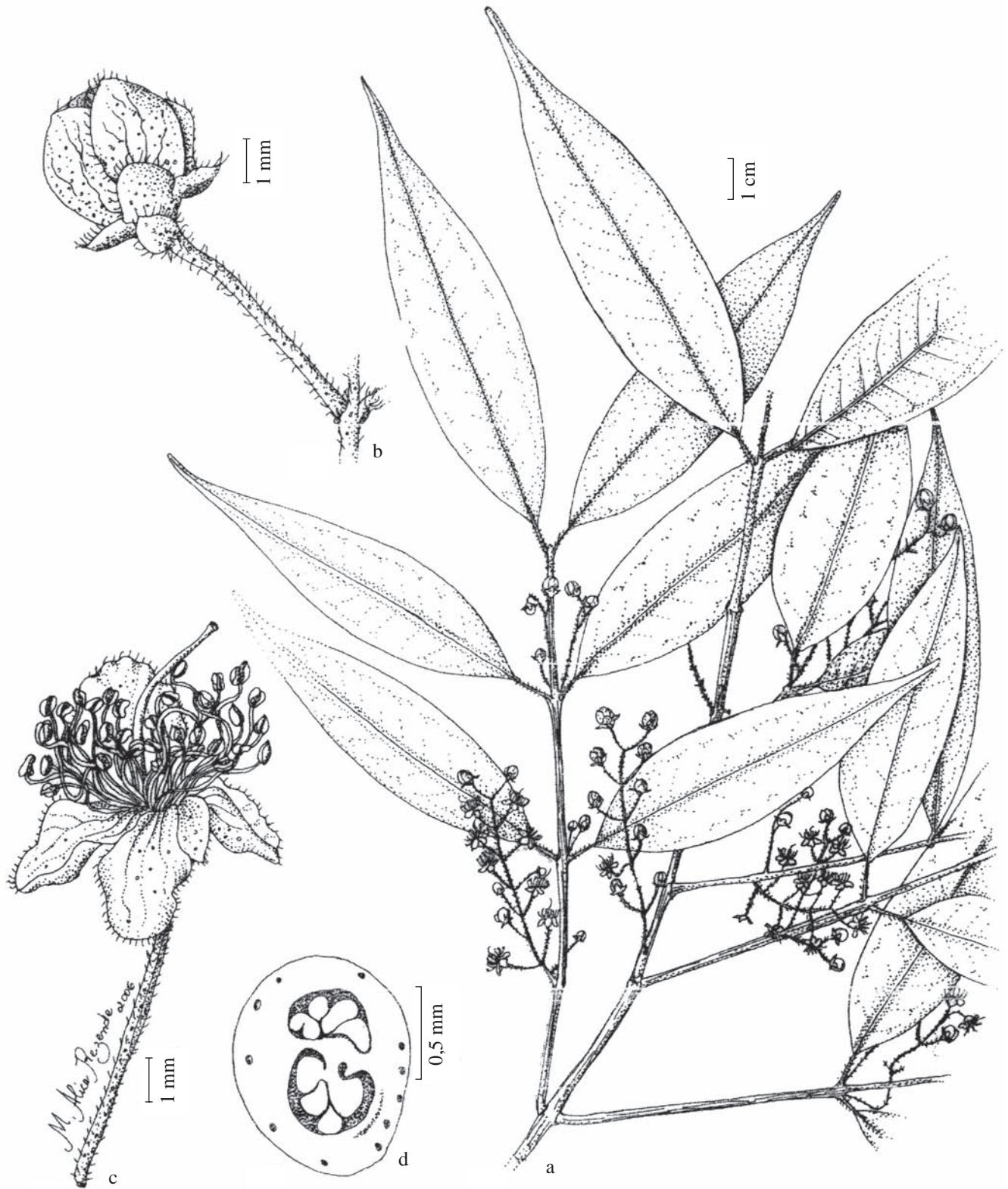
Figure 3. Eugenia glabrescens Mazine. a. Flowering branch. b. Flower bud, side view. c. Flower, side view. d. Medial section of ovary. (Prance & Silva 59428).