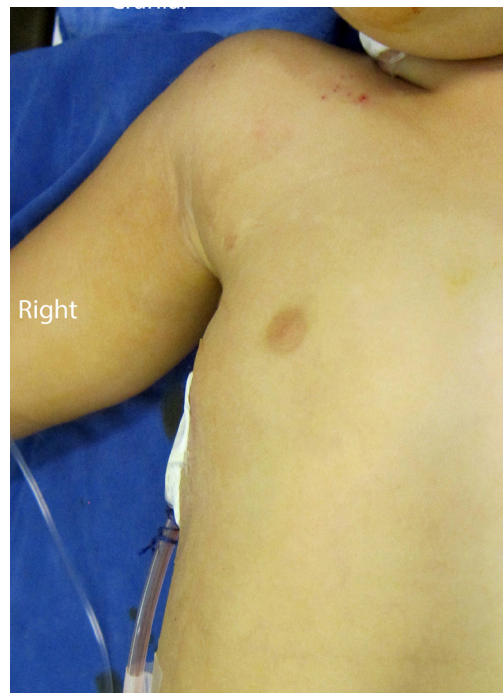
Fig. 3 - Aesthetic aspect of the thorax with hidden incision under the arm