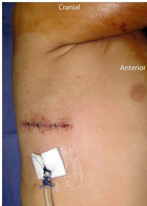
Fig. 2 - Incision aspect at the end of operation