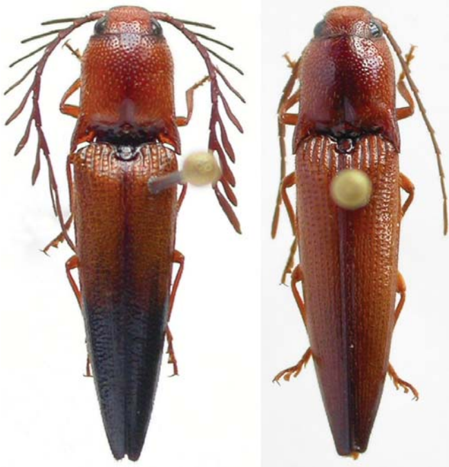
Fig. 17-18. Dicrepidius brasilianus sp. nov. 17, holotype (male); 18, paratype (female). Length, respectively, 13.97 and 16.80 mm.

observed, related especially to coloration, size and density of the punctuation. The examined specimens from Panama and South America are darker reddish-brown, usually with a sutural black narrow band on elytra, and the specimens from Florida and Bahamas are brownish or light reddish-brown without the sutural black band on elytra. The larger specimens are from Brazil (14.77-28.38 mm) and the size of the other South America examined specimens vary from 14.36-23.59 mm. The specimens from Florida are smaller and varied from 12.35-18.05 mm and those from Bahamas, a little smaller, from 11.70-18.74. The punctuation of pronotum and scutellar shapes are very variable,