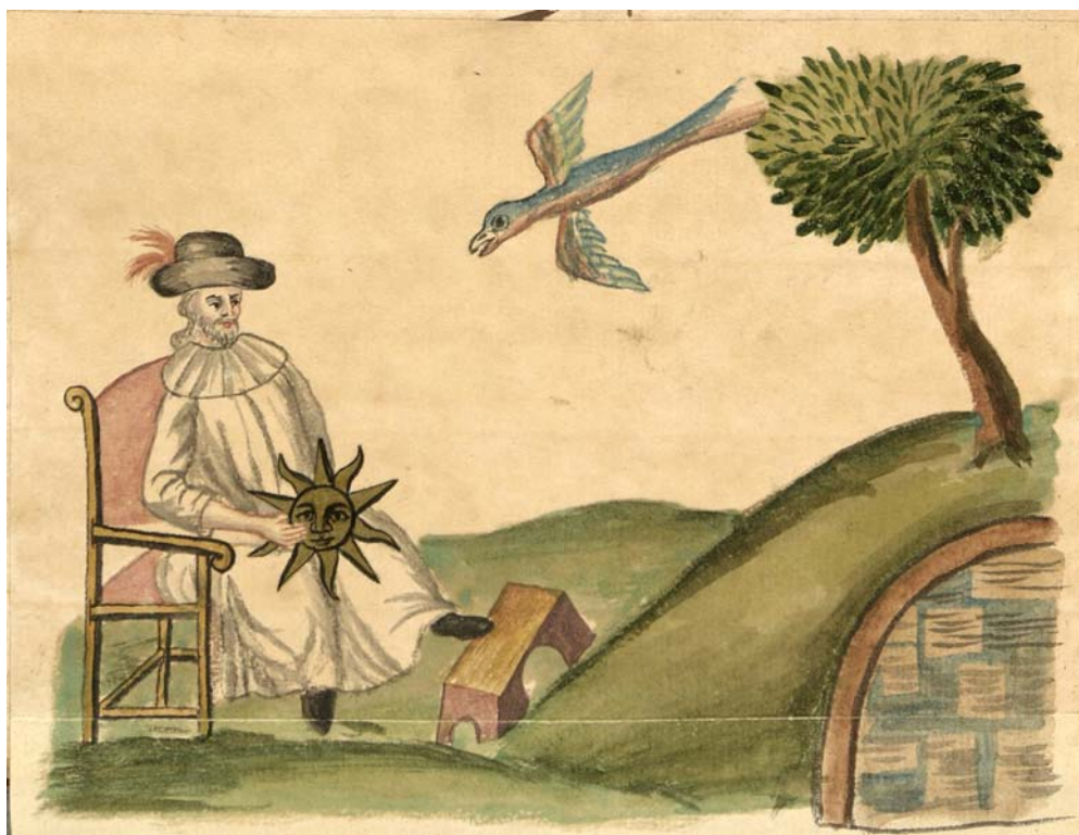
Figure 3 – Manuscript Zoroaster Clavis Artis, Ms-2-27.

I went back to the boxing gym to take a picture of Galeano's quote on the wall for this article. It was a Friday evening in late January when I showed up by surprise in my colleague's gym with my camera. I waited for the silhouettes of the bodies, for the movements of the fighters to give veracity to my photographs but nobody was there training, just the cleaning crew. A worker told me that the main hopeful of the gym, a girl in her twenties who actually holds a regional title after having overcome a dramatic youth of abuses, was fighting that evening. I found myself alone, standing by the bare stage while the big show was happening elsewhere. Dance halls and boxing gyms always have mirrors. Under the pilot lights, my shadowed presence by the silent ring was offering me through the mirror a totally different perspective of myself. Not even the poster remained there. In its place I found a quotation by the legendary Muhammad Ali: "The man who has no imagination has no wings". I then realized that I was giving excessive credit to the visible. Imagination is never illustrative.