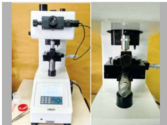
Figure 2. Vickers Microhardness Tester used to perform the test.

SPSS version 17.0 (SPSS Inc., Chicago, IL, U.S.A.) was the software used for statistical analysis. To compare the sports drinks groups, the analysis of variance was used with differentiation among the groups by the Tukey test, considering statistical significance of p \leq 0.01 . To compare each beverage's control and test surfaces, the independent sample t-test was employed, considering statistical significance of p \leq 0.05 .