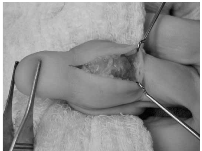
Figure 8 – Volar access approach.