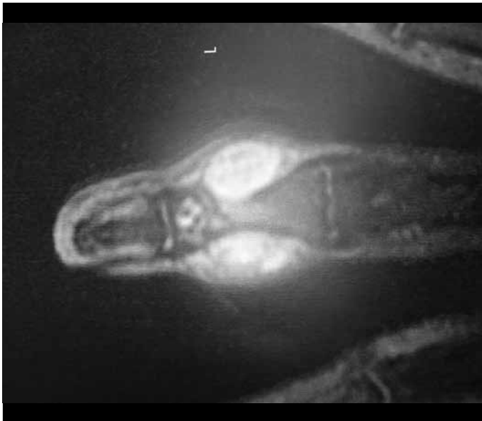
Figure 5 – Magnetic resonance imaging with T2, showing expansive lesion with heterogenous highlighting from the contrast medium.

The magnetic resonance examination showed an expansive lesion located on the middle phalanx, with its apparent epicenter in the region of the corresponding flexor component. The lesion presented defined limits and a slightly lobulated outline, with dimensions of 1.9 x 2.1 x 1.8 centimeters. It was promoting diaphyseal remodeling of the middle phalanx (Figure 5).