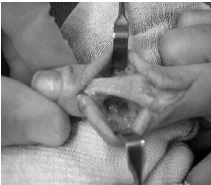
Figure 10 – Longitudinal section of the tumor by the volar approach.