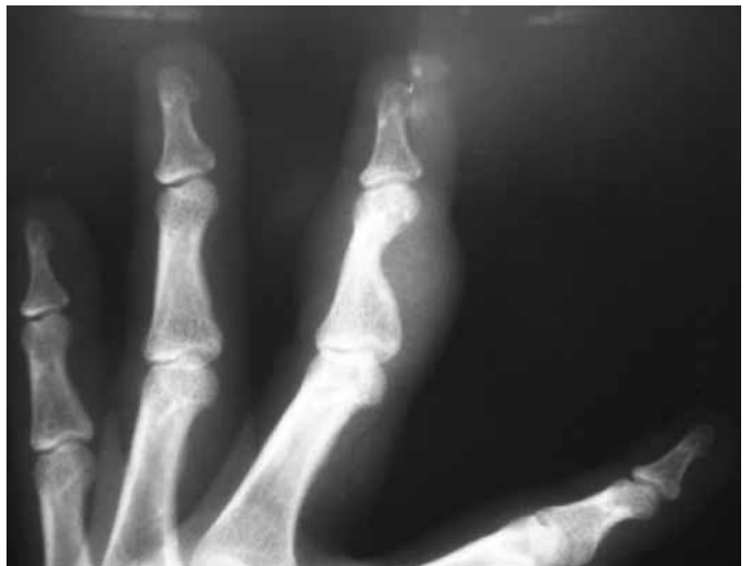
Figure 4 – Oblique radiograph showing the deformity of the middle phalanx.