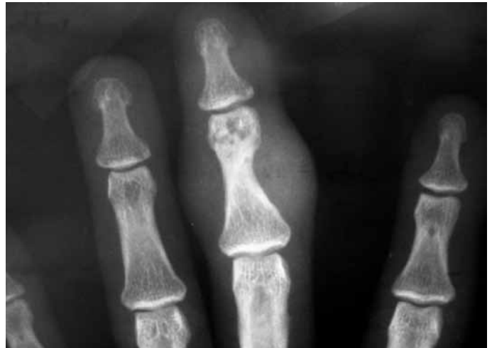
Figure 3 – Anteroposterior radiograph showing stenosis of the diaphysis of the middle phalanx and distal subchondral cysts.