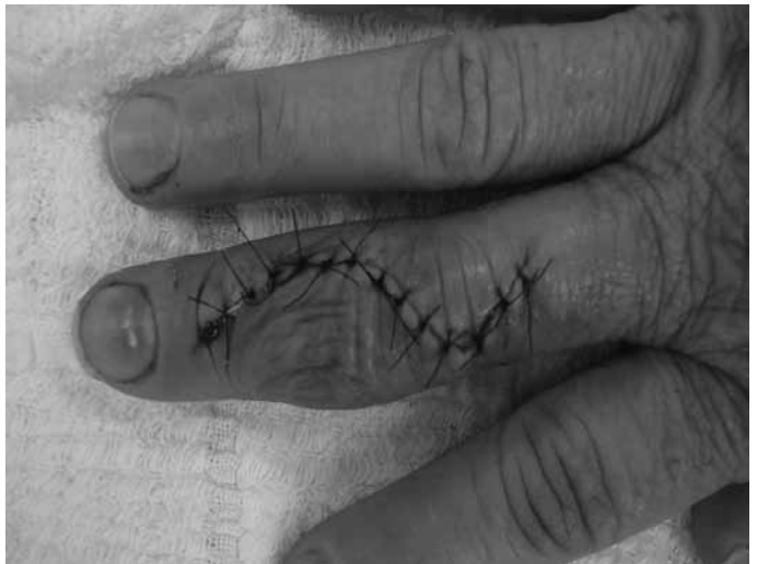
Figure 13 – Photograph evidencing the tumor size after excision.

One year after the operation, there has not been any recurrence of the tumor.