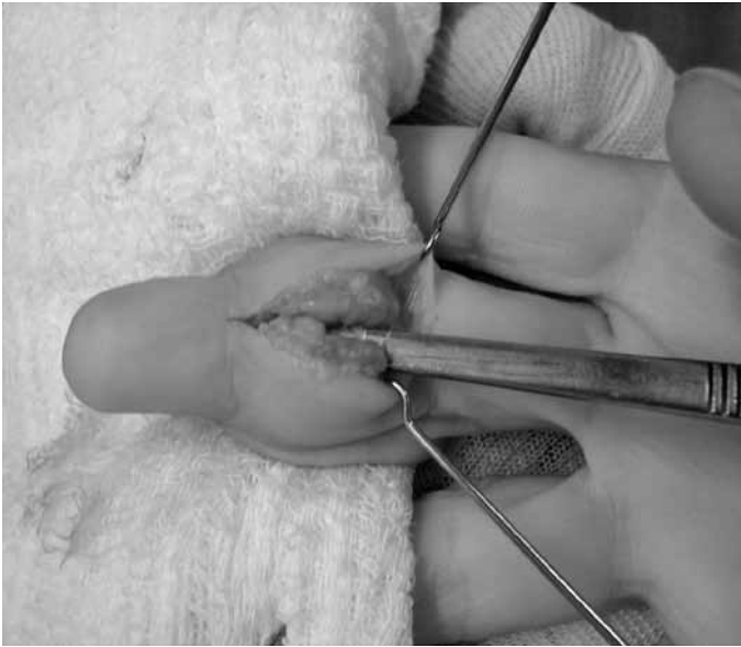
Figure 9 – Longitudinal sectioning of the tumor through the volar access.