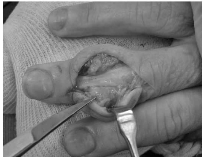
Figure 7 – View of the tumor at the two edges of the extensor complex.