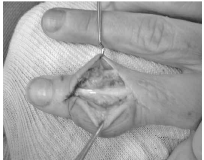
Figure 6 – Dorsal access approach.

Subsequently, the specimen was sent for histopa-