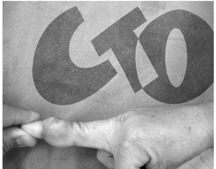
Figure 2 – Lateral view of the finger.