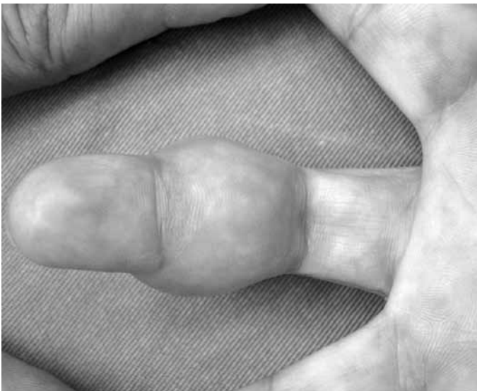
Figure 1 – Volar view of the finger.

Simple radiological examination of the finger showed morphostructural abnormalities of the middle phalanx, with diaphyseal segmental stenosis and distal subchondral cysts (Figures 3 and 4).