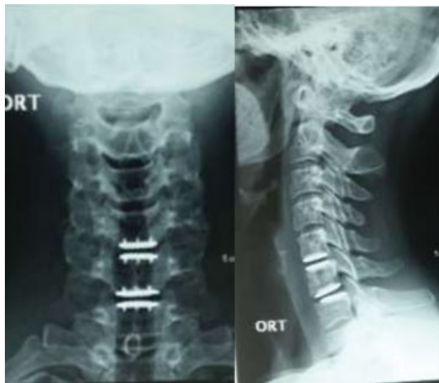
Fig. 3 Cervical disc arthroplasty. (A) Radiography in anteroposterior incidence; (B) Profile radiography.

Numerous models of prostheses, whether constrict, non-constrict and semi-constrict; made of metal-metal or polyurethane nuclei, all of them maintain the same indications of anterior cervical arthrodesis, presenting the following contraindications: surgery at three or more levels, cervical instability, osteopenia, active infection, and kyphotic deformity. 31