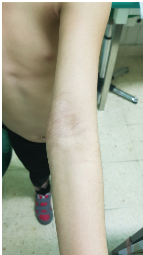
Fig. 6 Intact skin and full extension at three months of follow-up.

For the diagnosis, clinical suspicion is needed and a detailed vascular examination is crucial, with assessment of pulses, temperature of the limb, capillary return and pulse oximetry. 3 The use of intraoperative or postoperative ultrasound is also helpful to assess the patency of the vessels. 4 In some cases, pulse oximetry waveform can be used to determine the need for vascular exploration. 10