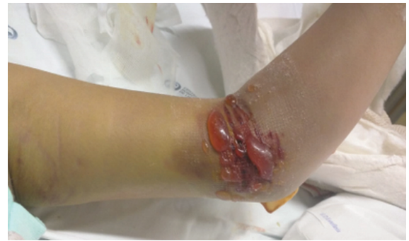
Fig. 4 Edema and blistering of the skin 48 hours postoperatively.