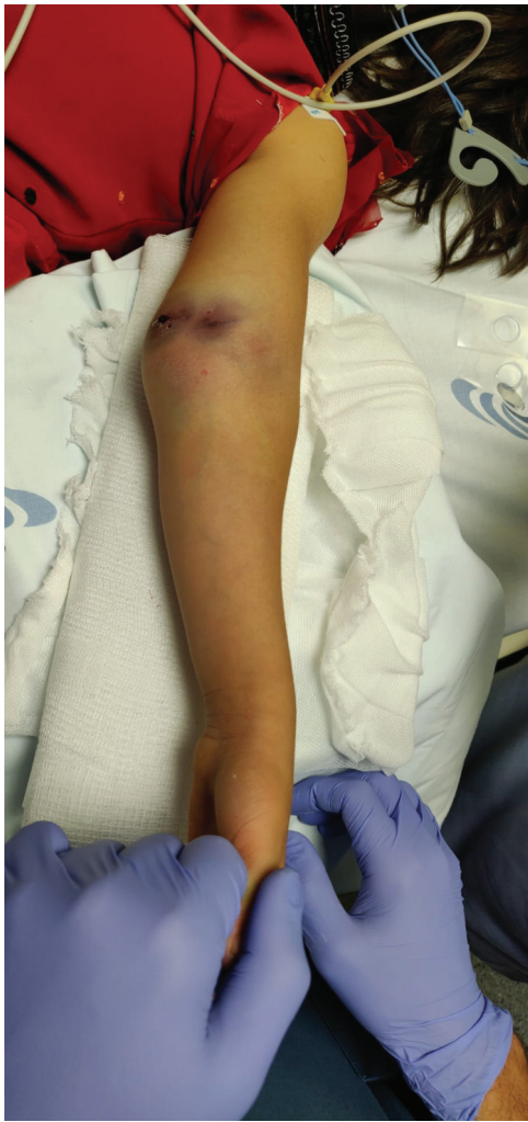
Fig. 2 Ecchymosis in the antecubital fossa.