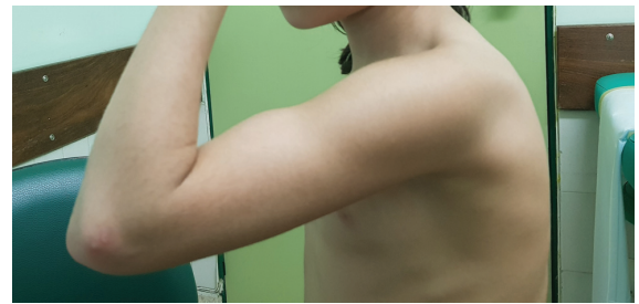
Fig. 5 Range of motion at three months of follow-up.

At 48 hours following surgery, there was persistent pain and progressive tender edema with skin blistering (► Fig. 4 ). The peripheral pulses were normal, and there was no pain exacerbation, with passive mobilization of the fingers. After excluding compartment syndrome, a venous duplex ultrasonography was performed, which revealed deep venous thrombosis (DVT) of the humeral vein.