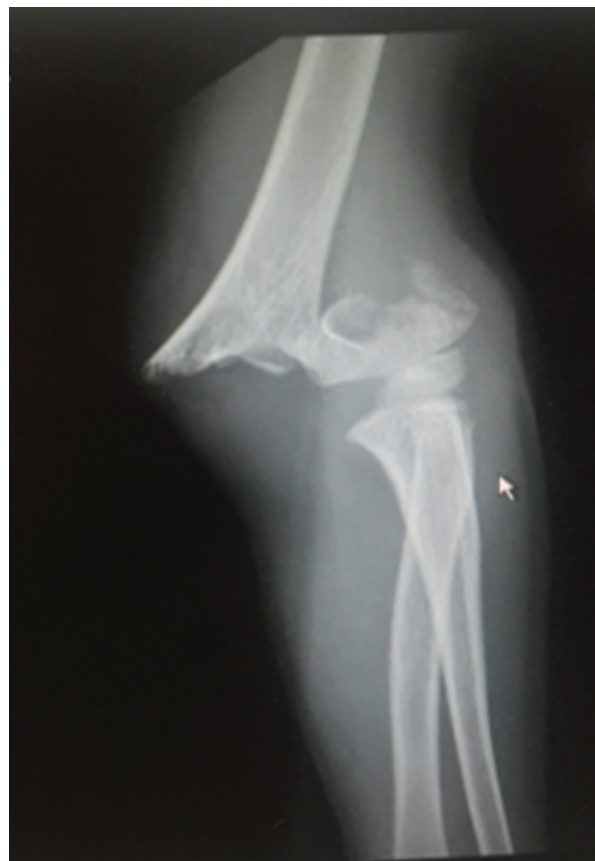
Fig. 1 Radiograph of the supracondylar humerus fracture (Gartland type III).

After splint removal, the pain subsided, she had a weak radial pulse, normal capillary refill, and the hand oximetry reached 98%. On an emergency basis, the patient underwent a smooth manipulation with closed reduction and pinning with 2 divergent lateral Kirschner wires and immobilization in a posterior splint at 120° of flexion (►Fig. 3). Six hours postoperatively, the child had a pain-free and warm upper extremity, a peripheral oxygen saturation of 100%, and palpable distal pulses.