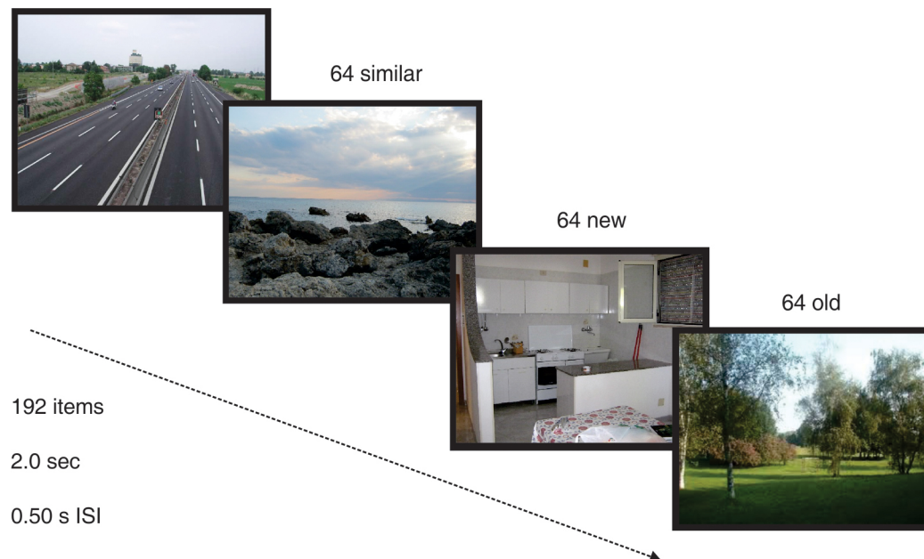
Figure 2 Mnemonic Similarity Task – Context Version (MST-C)

All analyses were conducted in SPSS version 20.0 for Windows. Significance levels were set at p < 0.05 , and the strength of Spearman-Brown coefficients were evaluated according to cutoffs found in the literature 57 (i.e., r from 0.00 to 0.30 negligible correlation; r from 0.30 to 0.50 low; r from 0.50 to 0.70 moderate; r from 0.70 to 0.90 high; r from 0.90 to 1.0 very high correlation).