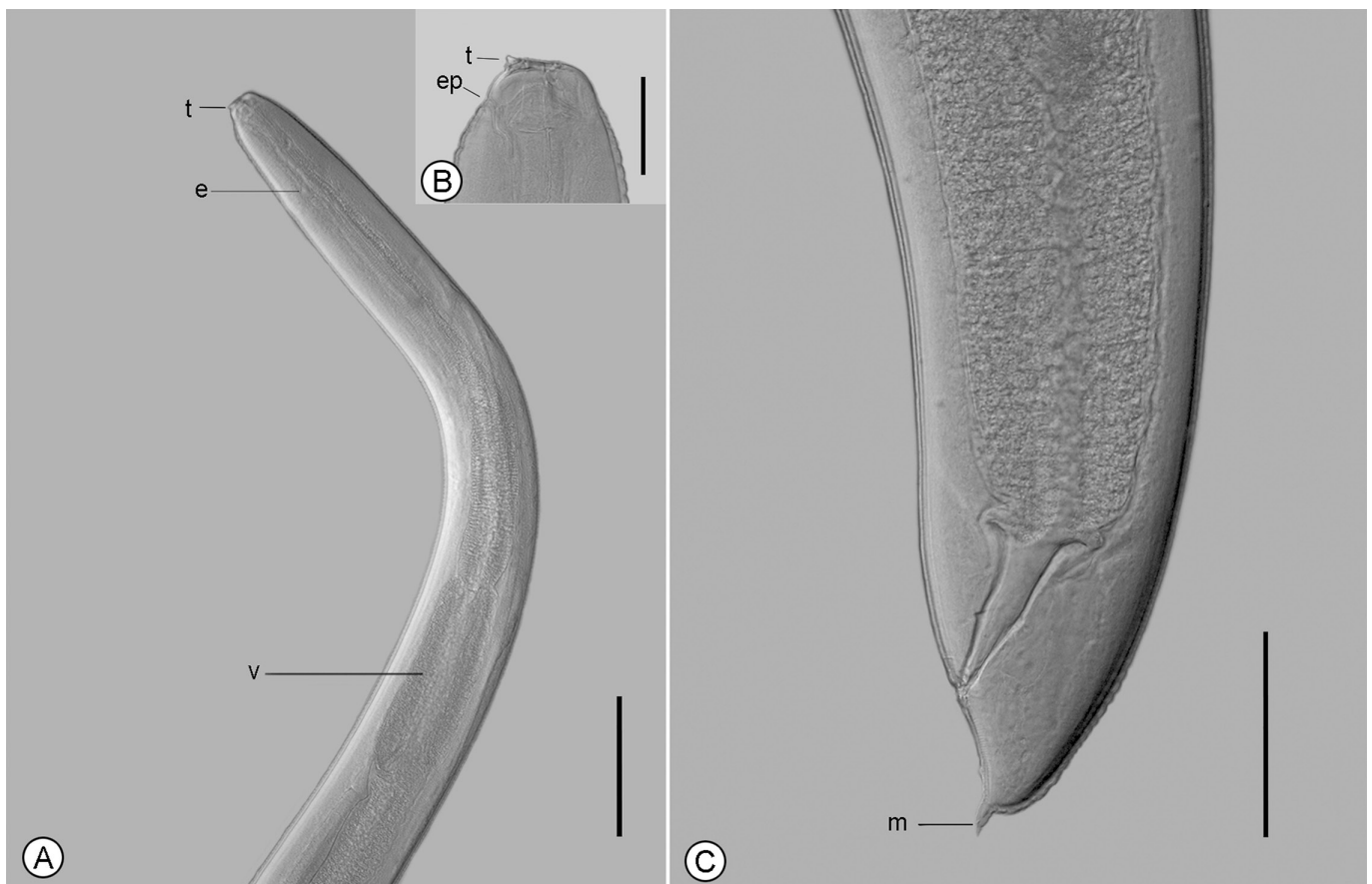
Figure 1. Anisakis sp. (L 3 ) from Plagioscion squamosissimus observed by differential interference contrast, in lateral view. A - anterior portion showing boring tooth (t), esophagus (e) and ventricle (v). B - Detail of boring tooth (t) and excretory pore (ep). C - Posterior portion showing tail with terminal mucron (m). Scale bars: A = 200 \mu m, B = 50 \mu m and C = 100 \mu m.

The larvae of Anisakis sp. collected in the present study were morphologically similar to specimens of A. simplex (Rudolphi, 1809) and Anisakis sp. that were recorded in Paralichthys isosceles Jordan, 1890, and Cynoscion guatucupa (Cuvier, 1830), collected on the coast of the state of Rio de Janeiro by Felizardo et al. (2009) and Fontenelle et al. (2013), respectively. However, morphometrically, they showed smaller body size than the ones collected by Felizardo et al. (2009) (15.60 length x 0.36 width)