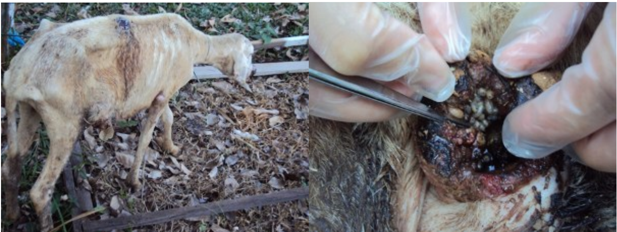
Figure 1. Ovine presenting multifocal tumors, suggesting SCC, with fly larvae in the skin tumor ulceration.

A sheep of approximately six years old with no definitive breed, was assisted in the Federal University of Acre, municipality of Rio Branco, AC, Brazil. The animal was in a cachectic state, presenting multifocal tumors. The presence of tumors in the animal's skin was observed in the physical exam. The abnormalities were located on the back area, near the right shoulder blade, in the external ear and the back of the belly region. The tumors presented firm consistency and, macroscopically, an "cauliflower" aspect, with little fur and no pigmentation, erythema, edema and scaling, followed by formation of crusts and thinning of the skin with subsequent ulceration. There were also present signs of secondary infections and myiasis (Figure 1).