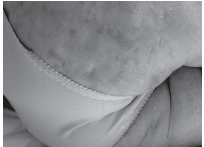
Figure 2 – Vasculitic lesion secondary to rheumatoid arthritis on the gluteus region.