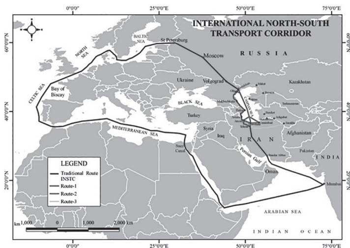
Figure 1: Location of the International North-South Corridor (INSTC)