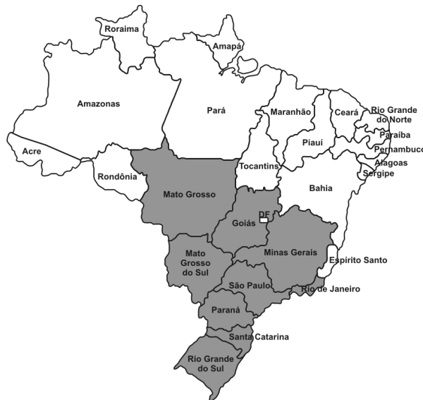
Figure 1. Brazilian milk market

These results give us important information about the extension of the market in Brazil. It indicated that the milk market in Brazil concentrates in the Center-West, Southeast, and South (Figure 1). The different groups demonstrated that geographical location is a determining characteristic for the Brazilian milk market. We found out that the states geographically close have a common trend between the milk prices and represent the Brazilian milk market. In other words, the extension of the Brazilian milk market is likely given by Mato Grosso, Goiás, Mato Grosso do Sul, Minas Gerais, Rio de Janeiro, São Paulo, Paraná, Santa Catarina, and Rio Grande do Sul. The limitations of the methodology do not allow us to assure it. However, the results of the test strongly indicate it. Especial attention should be given to Rio de Janeiro, Mato Grosso, and Rio Grande do Sul, because they demonstrated to be cointegrated in certain cases, but not in others. It is also an interesting result, since these three states represent the extreme boundaries of the Brazilian milk market. This reaffirms that the geographical proximity is a very important feature of a market. Mato Grosso is the northwest extreme; Rio de Janeiro is the east; and Rio Grande do Sul is the south extreme. It likely happens because of the transportation cost.