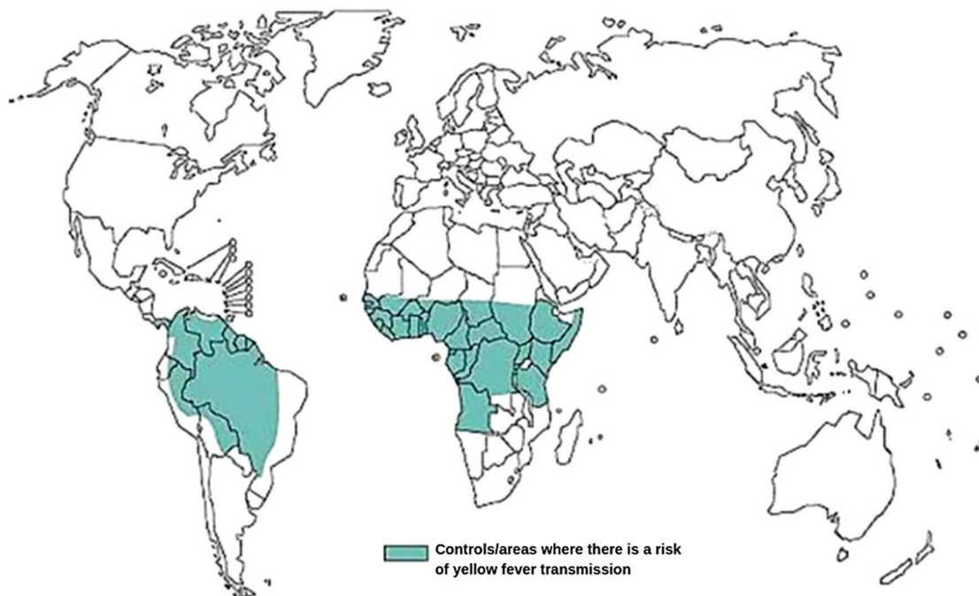
Figure 2 - Areas at risk of yellow fever transmission. Adapted from the World Health Organization 34 .