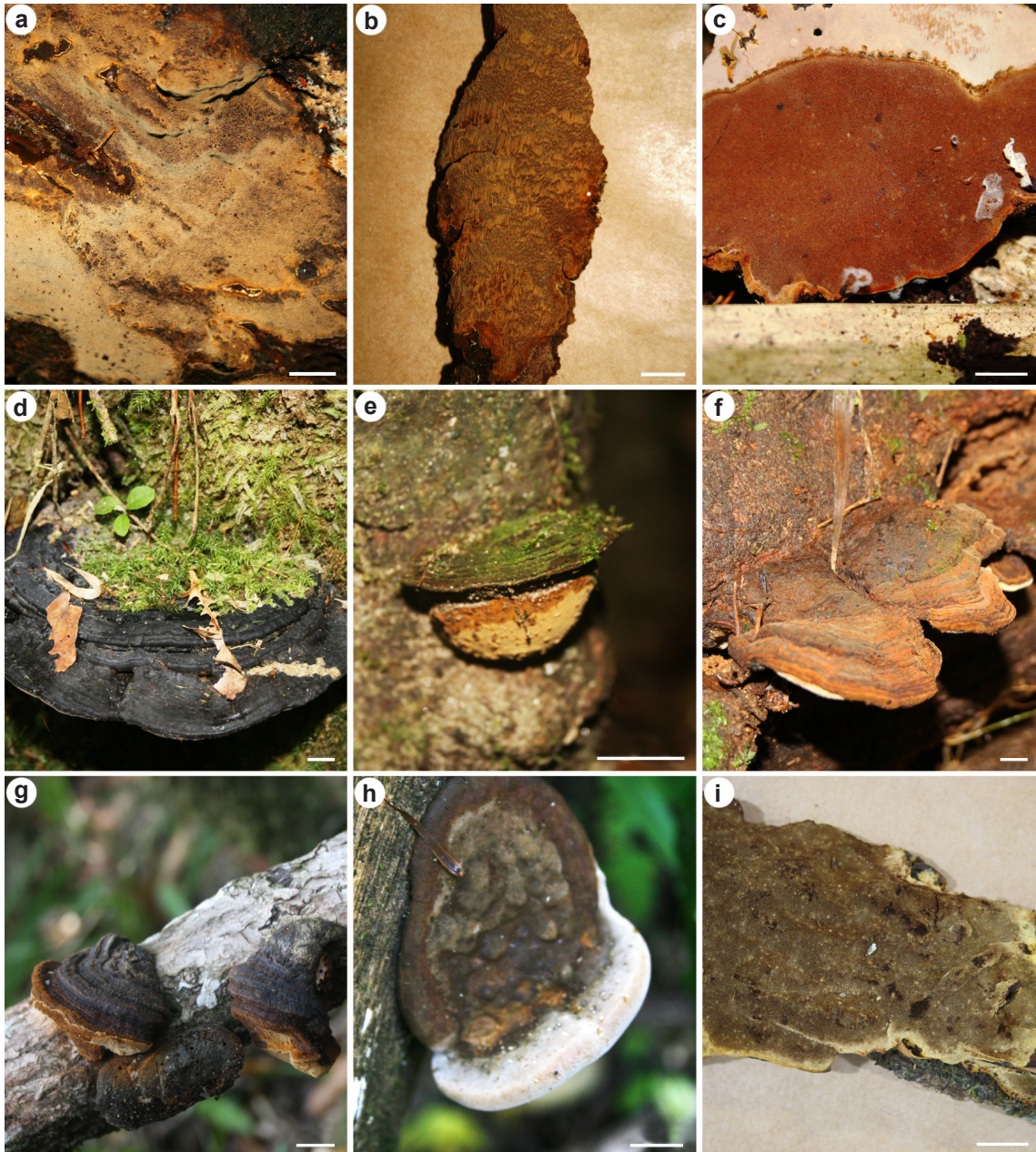
Figure 3 – a. Fulvifomes glaucescens ; b. Fulvifomes melleoporius ; c. Fuscoporia chrysea ; d. Fuscoporia rhabarbarina ; e. Inonotus linteus ; f. Inonotus portoricensis ; g. Phellinus grenadensis ; h. Phellinus roseocinereus ; i. Phellinus undulatus . Scale bar = 1 cm.

with small and imbricate pilei and microscopically by the common hymenial setae ( 24\text{--}30 \times 6.0\text{--}8.0 \mu\text{m} ) and basidiospores broadly ellipsoid and hyaline ( 3.5\text{--}4.1 \times 2.0\text{--}2.5 \mu\text{m} ). The concept of this species is not well established and Ryvarden (2004) suggests that the original description is only an early stage of development of basidioma, and