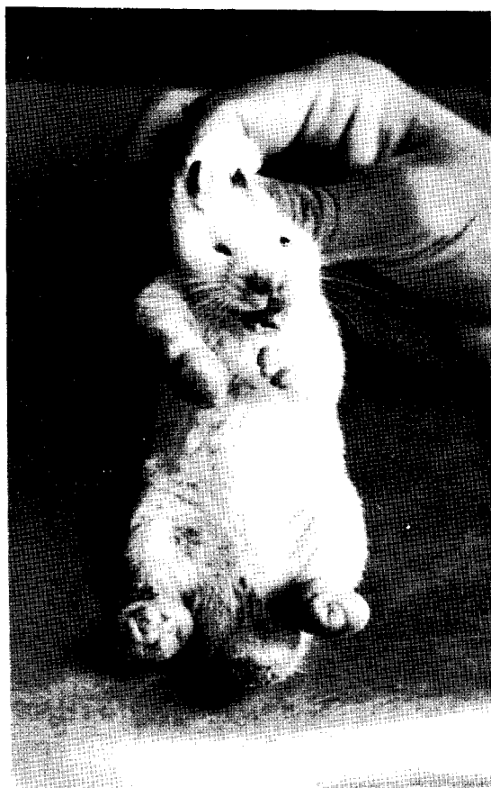
Figure 1. Hamster inoculated subcutaneously (first passage) into the two hind feet with the strain MPRO/BR/83 MTB-581/583 ( L. mexicana ssp.) showing large non-ulcerated histiocytomas (5 months post-inoculation). Positive smears and metastasis were first observed 30 days after inoculation.

The parasites grew abundantly in both media used. After an initial failure to infect Lutzomyia