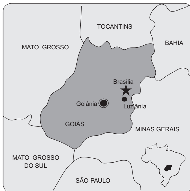
FIGURE 1 - Map of Brazil, highlighted the State of Goiás and the municipality of Luziânia.

The survey was conducted from August 19 to October 9, 2010 in 24 rural areas or farms affected by the epidemic in 72/73. All its inhabitants who agreed to participate in the study were included, and there were no exclusion criteria. The participants