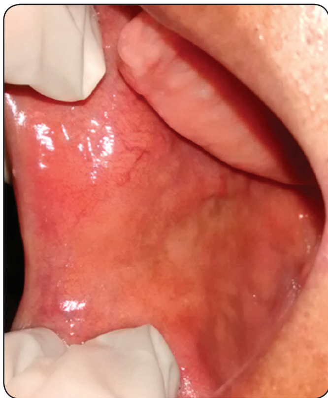
FIGURE 3 - Buccal mucosa showing no recurrence after 12 months of follow-up.

described (4) . In this case, the patient was symptomatic and an intense inflammatory reaction was observed. Our differential diagnoses included mesenchymal benign tumors (such as lipoma or fibrolipoma, solitary fibrous tumor, and neurofibroma) or glandular benign tumors (such as pleomorphic adenoma) with inflammatory reactions, including secondary infections. Some of these lesions were also included as differential diagnoses in a previous case of dirofilariasis affecting the oral mucosa (1) .