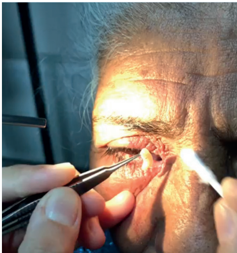
FIGURE 1: Larva extraction.

[1]. Atatürk University, Faculty of Medicine, Department of Infectious Diseases and Clinical Microbiology, Erzurum, Turkey. [2]. Ataturk University, Faculty of Medicine, Department of Eye Diseases, Erzurum, Turkey.