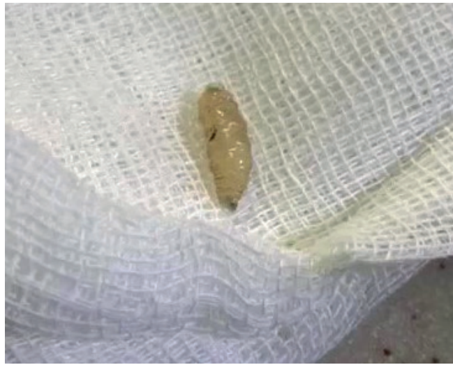
FIGURE 2: Image of larva.

A 55-year-old woman was admitted to the Eye Clinic at Atatürk University Medical Faculty Hospital in July 2019 due to redness, stinging, and itching in her right eye. At the ophthalmological examination, visual acuity in both eyes was complete and intraocular pressure was normotonic. External examination revealed hyperemia and edema in the right eye, especially on the interior of both eyelids. The left eye was evaluated as normal at the anterior segment examination, while conjunctival hyperemia was present in the right eye, together with a 2-cm long tunnel in the medial canthus with an approximately 0.5-cm wide mouth, extending inwardly and containing larvae. Five moving parasites were detected in this tunnel. The bilateral eyes were normal at the fundus examination.