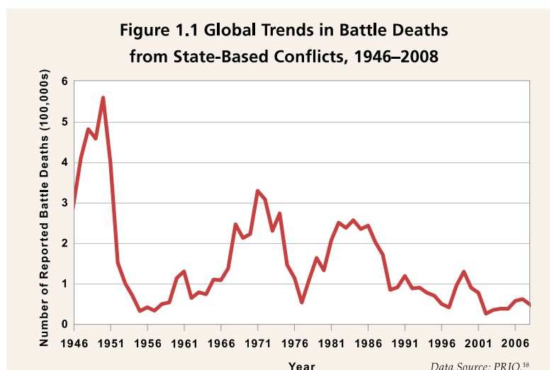
Figure 1: Global Trends in Battle Deaths from State-Based Conflicts, 1946–2008

In addition to Pinker, many other researchers confirm a decline in conflict-related deaths, as seen in the two graphs below. PRIO estimates that if current trends continue, countries affected by civil wars could decline by half in 2050. Research strongly suggests that large-scale conflict is decreasing, while low-intensity, micro-conflicts of fewer than 1000 deaths are increasing (Human Security Research Group, 2014).