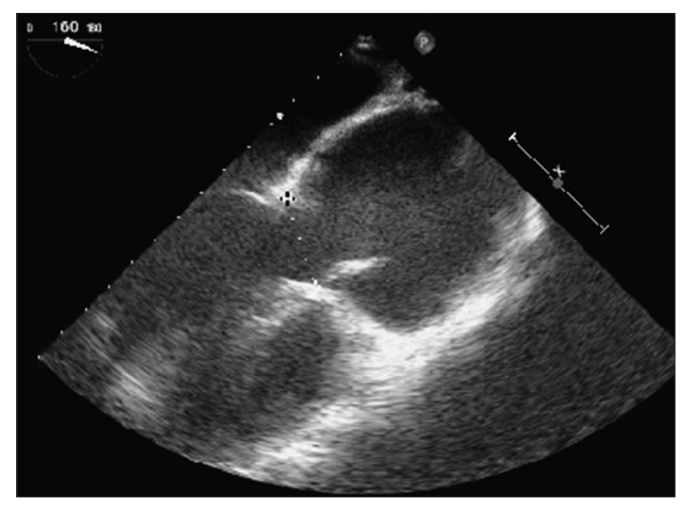
Figure 2. Echocardiography showing aortic root dilation to 67 mm in diameter on a long-axis view, in a 34-year-old male patient with Marfan's syndrome.

the non-coronary, right coronary and left coronary cusps and the aortic root area on short-axis views of the aortic root. An asymmetrical aortic root might be of clinical importance in unexpected aortic root dissection.<sup>36</sup>