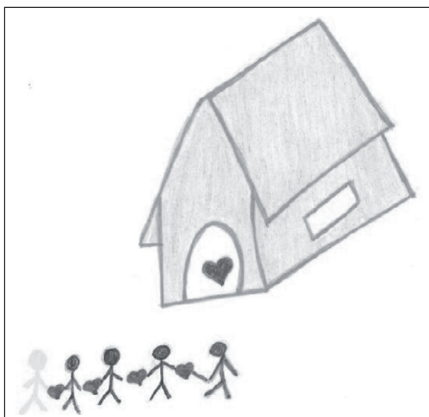
Figure 1 - Care

In my drawing [...] user embracement represents the importance of listening and being prepared and sensitive to recognize the needs of family members [Drawing: Communication] (Sapphire).