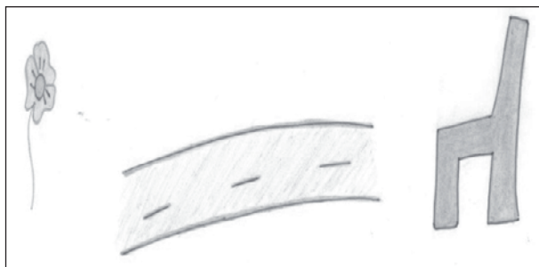
Figure 4 - Assistance

User embracement only materializes in the process of day-to-day health services through the link between the demand presented and the response of the health service, which translates into assuming responsibility for needs that are not immediately met, referring them in an ethical and solution-based way, through an interdisciplinary and inter-sectoral process, which occurs within a network of relationships involving interaction and constant dialogue. 7,17 We noted that ICU nurses will not always be able to work out all the demands of family members, because it will often be necessary to summon the interdisciplinary team, but the nurse is responsible to tell the family what means it has at its disposal and ensure that it has access to those means.