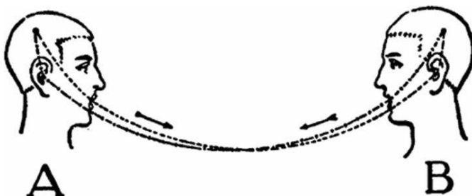
Figure 1. Saussure's model of communication

I shall start from something which all of us learned during our first year of language studies: Saussure's sender-receiver model of communication (SAUSSURE, 1960, p. 27). (See Figure 1)