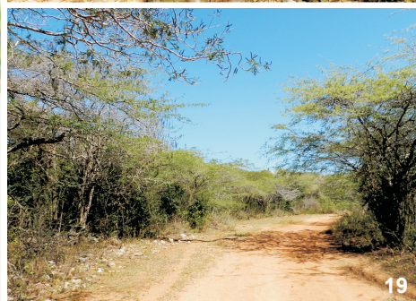
Figures 15-19. Avicularia rickwesti sp. nov.: (15) records in Dominican Republic; (16-19) habitats in Dominican Republic: (16, 19) dry deciduous forest in Baoruco, s. Manuel Golla; (17) retreat, female; (18) retreat, Baoruco, s. Manuel Golla.