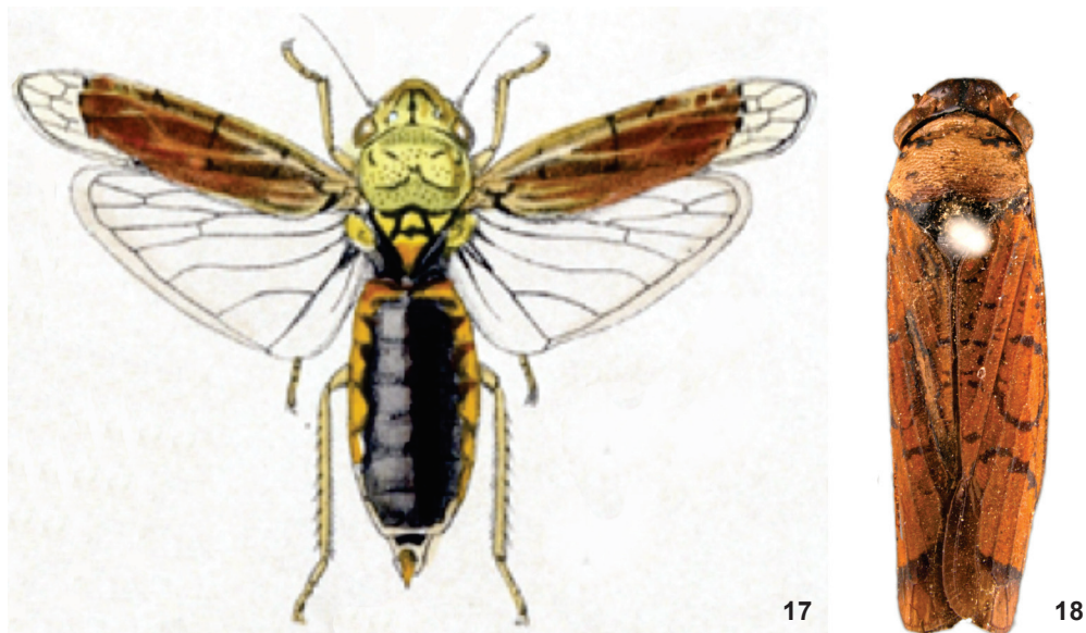
Figures 17-18. Habitus of lectotypes of Paraulacizes species, dorsal view. (17) female lectotype (length 11 mm) of Oncometopia munda (reproduced from FOWLER 1899: tab. 14, fig. 21); (18) male lectotype (length 14 mm) of Tettigonia confusa.