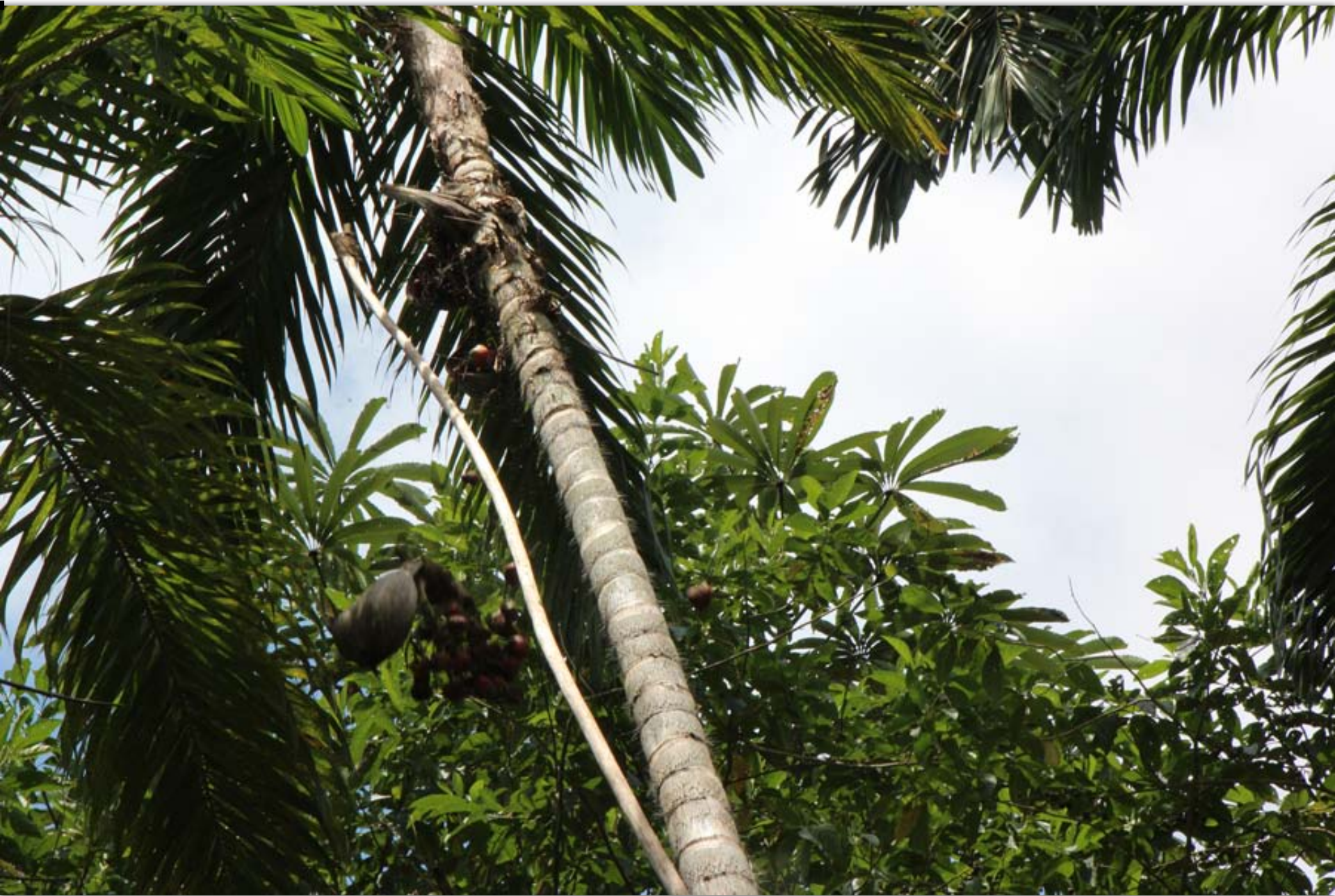
A large stick is necessary to collect pupunha