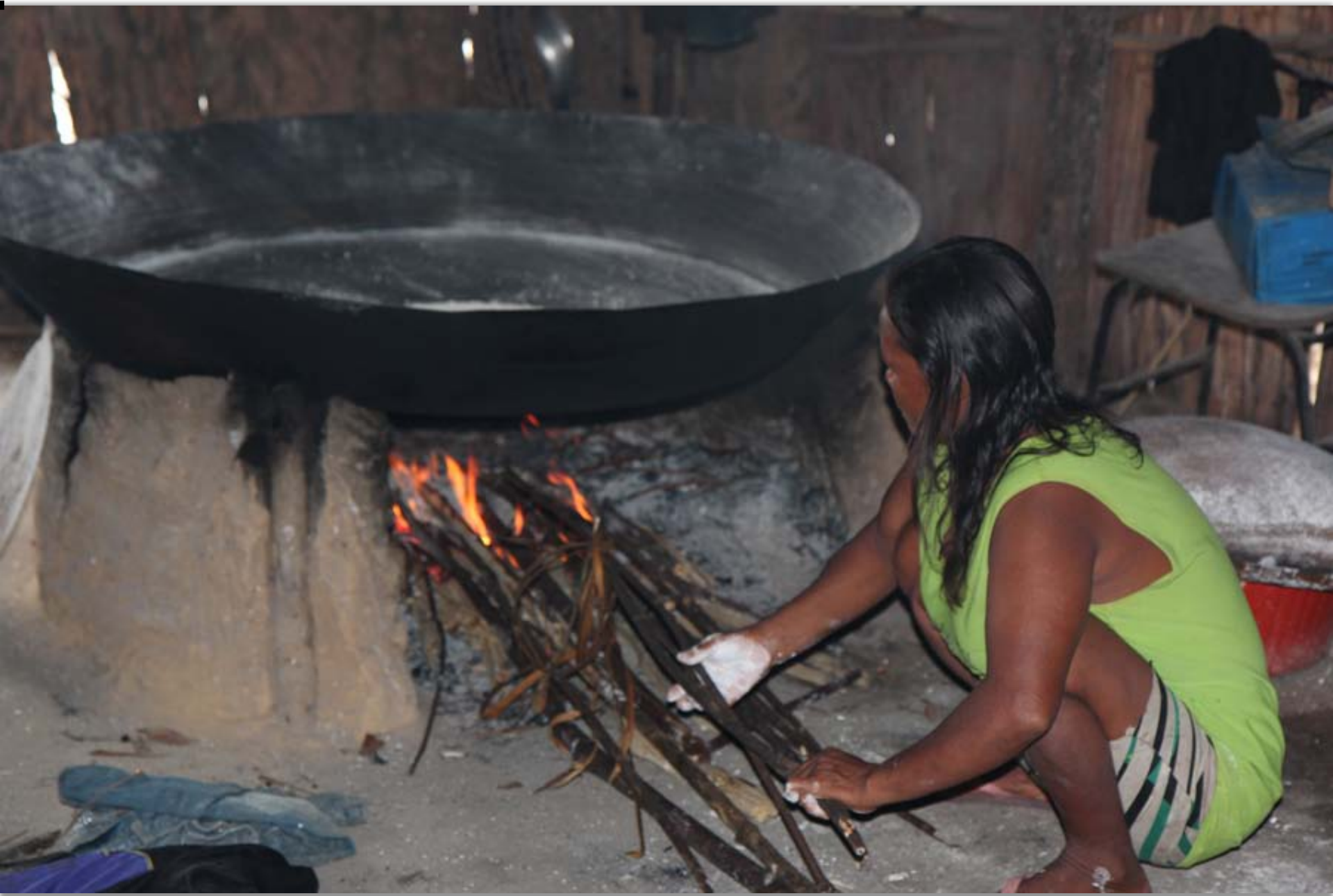
Many houses have big ovens like this to prepare the manioc