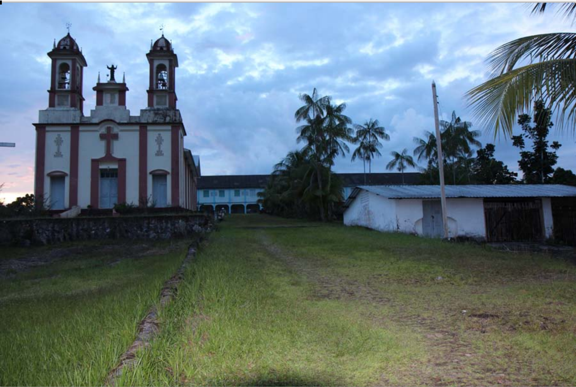
Salesian Mission in Taracuá, Uaupés River