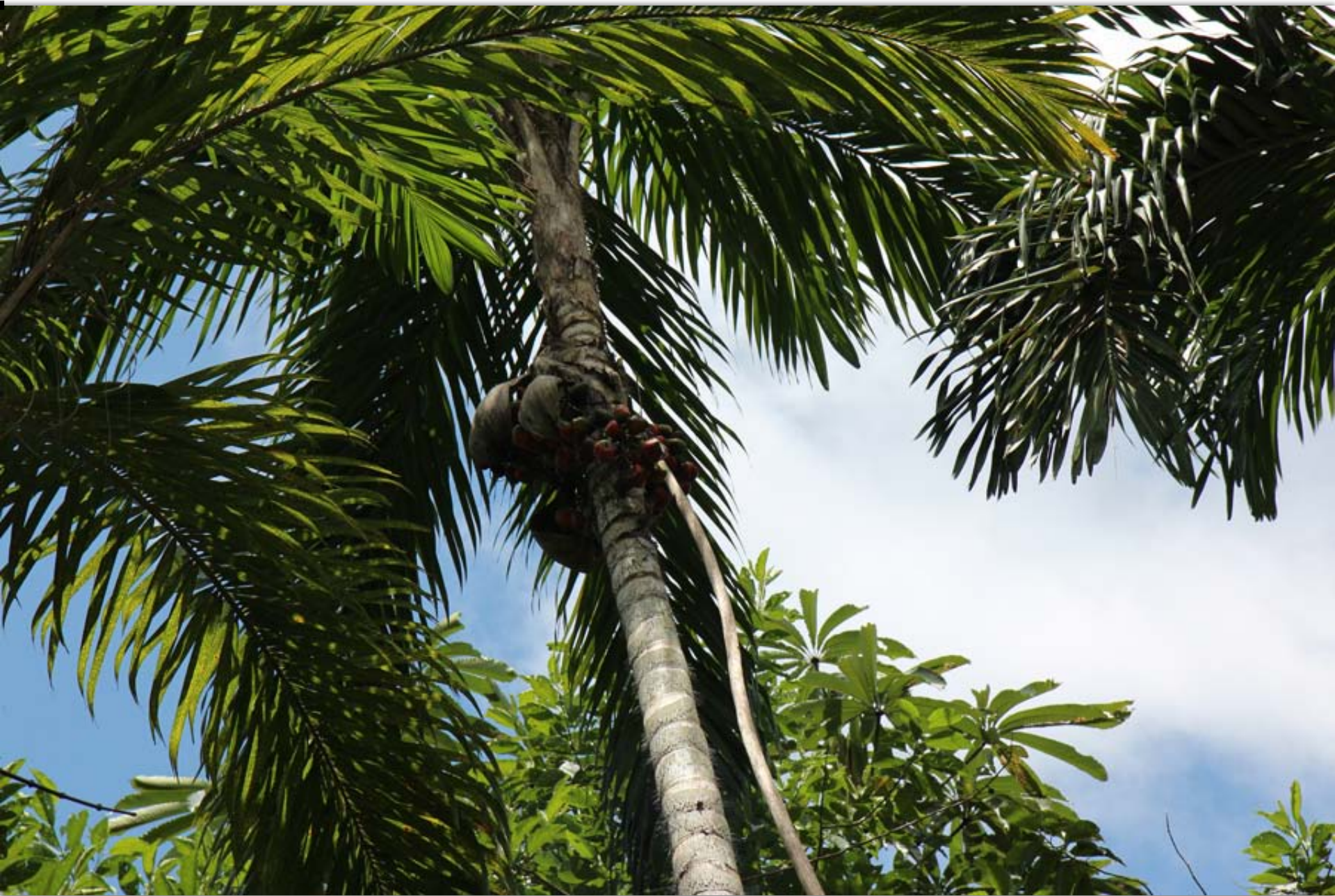
Pupunha palm tree