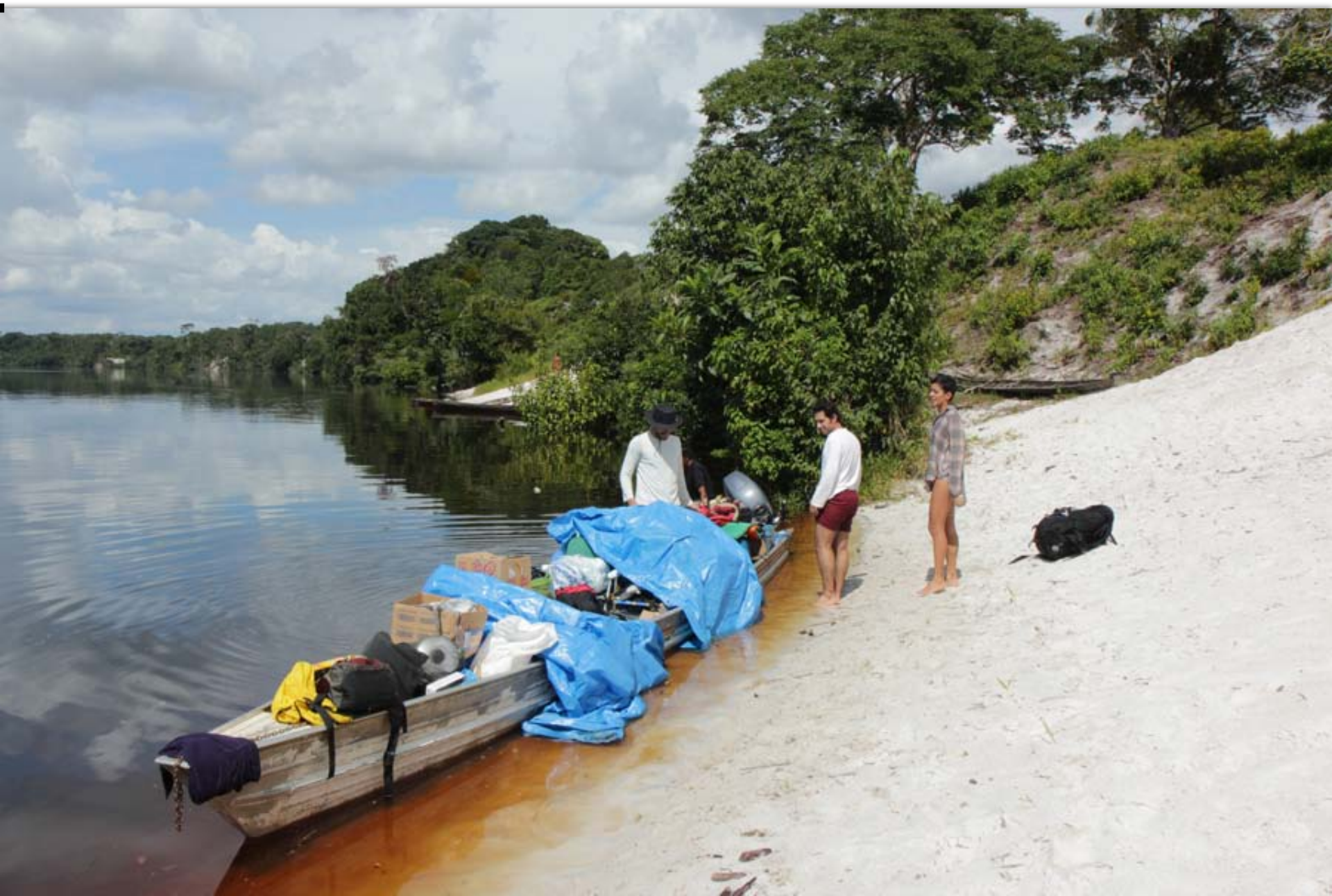
It takes two days in this boat to go from São Gabriel da Cachoeira to the Hup'däh village