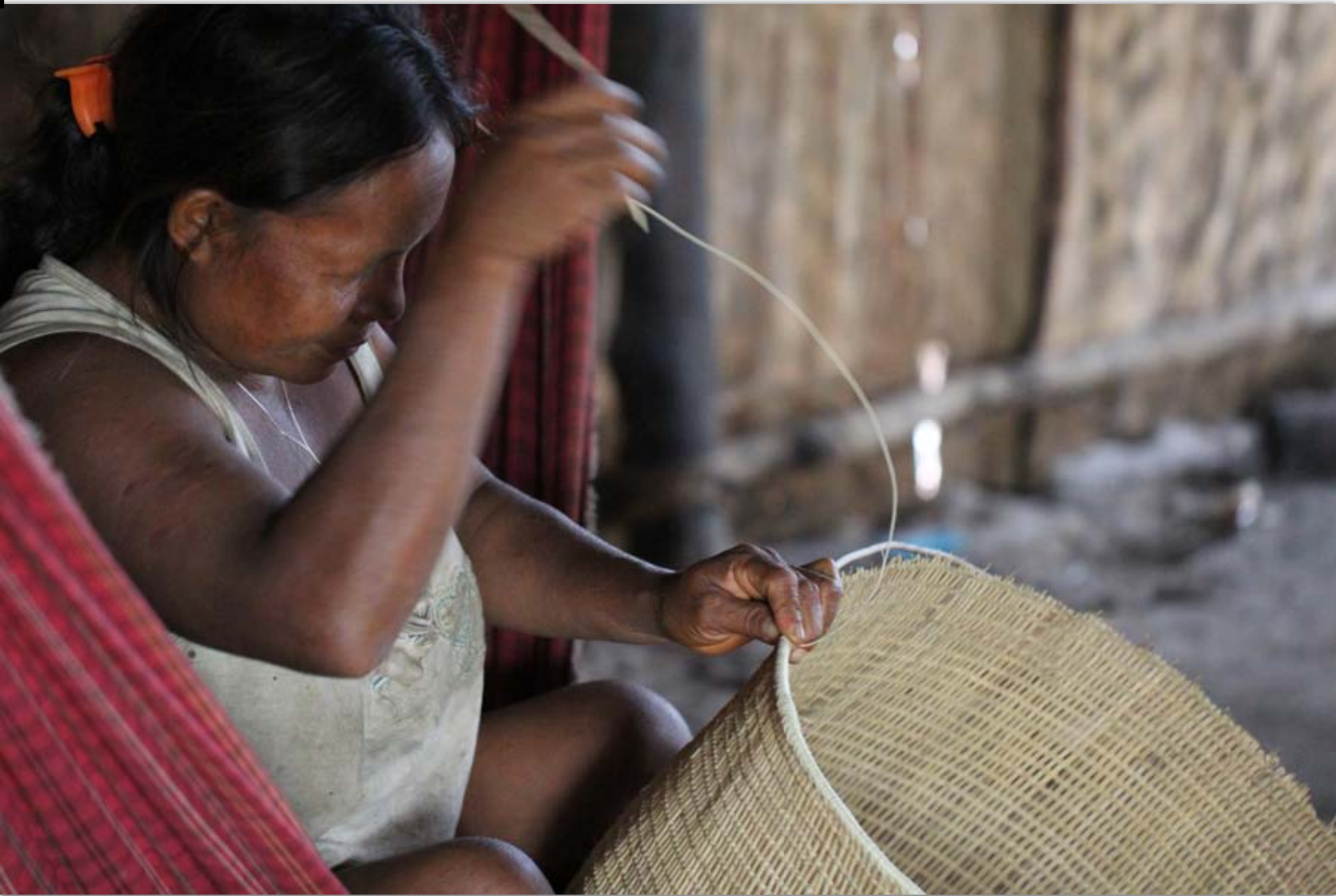
Baskets are always made by women