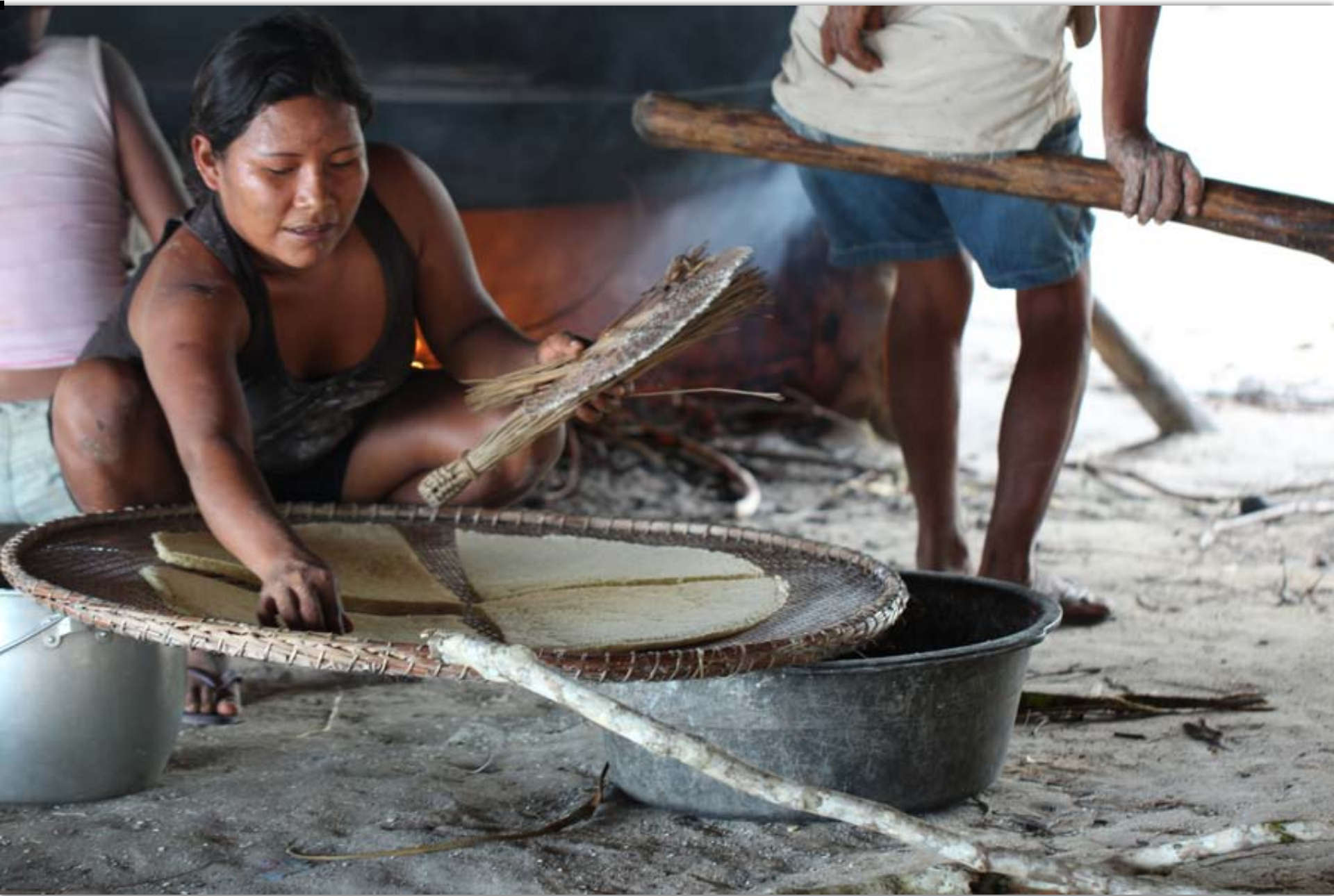
Divided in 4 slices, beiju cools in a straw sieve