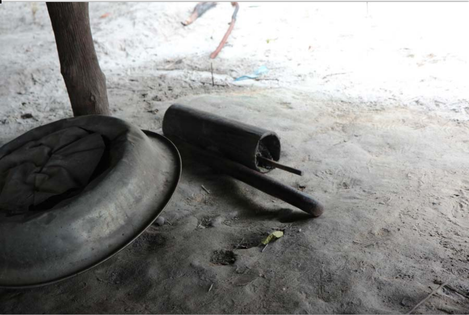
Wooden mortar to soak coca leaves