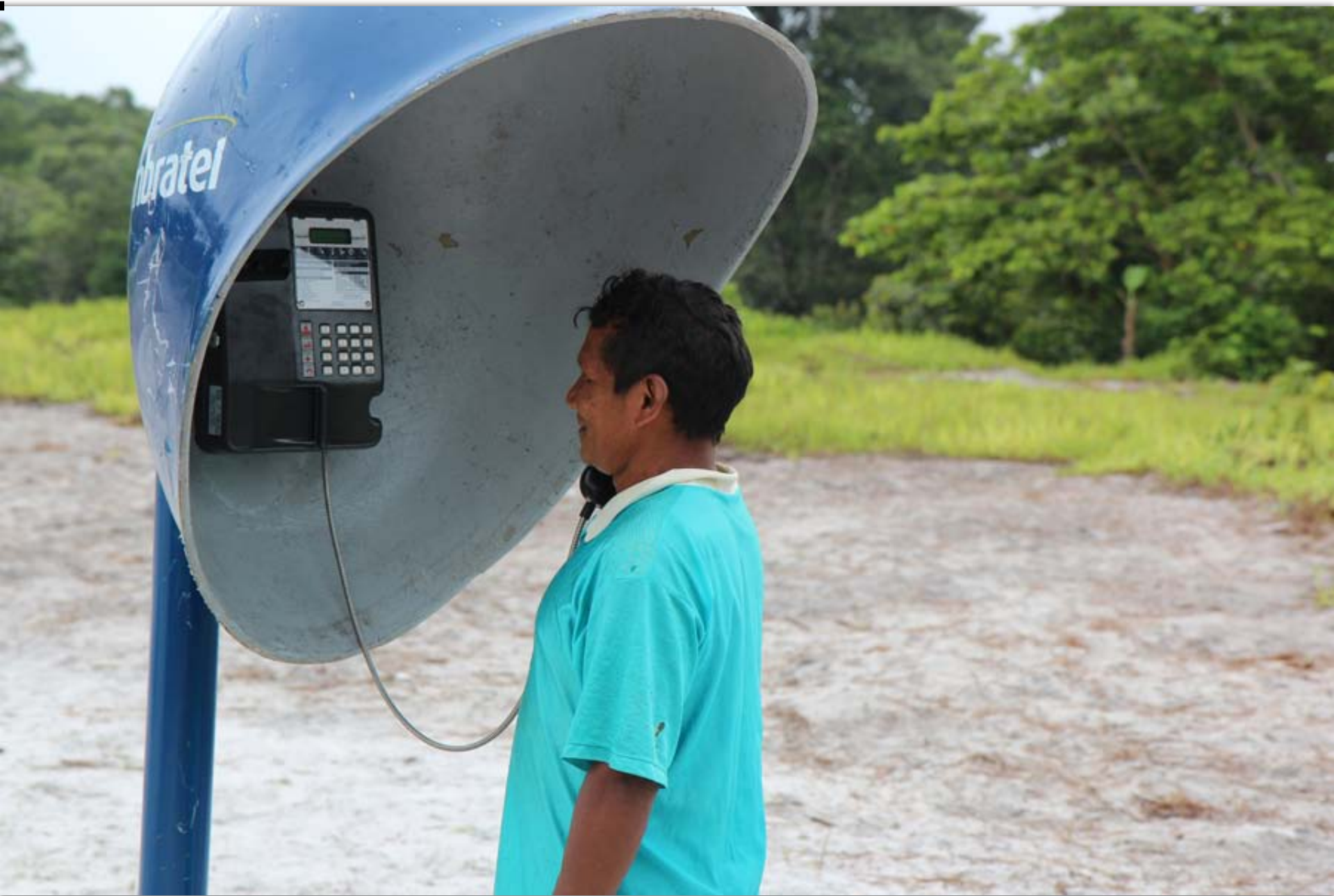
Mandu inaugurates the telephone