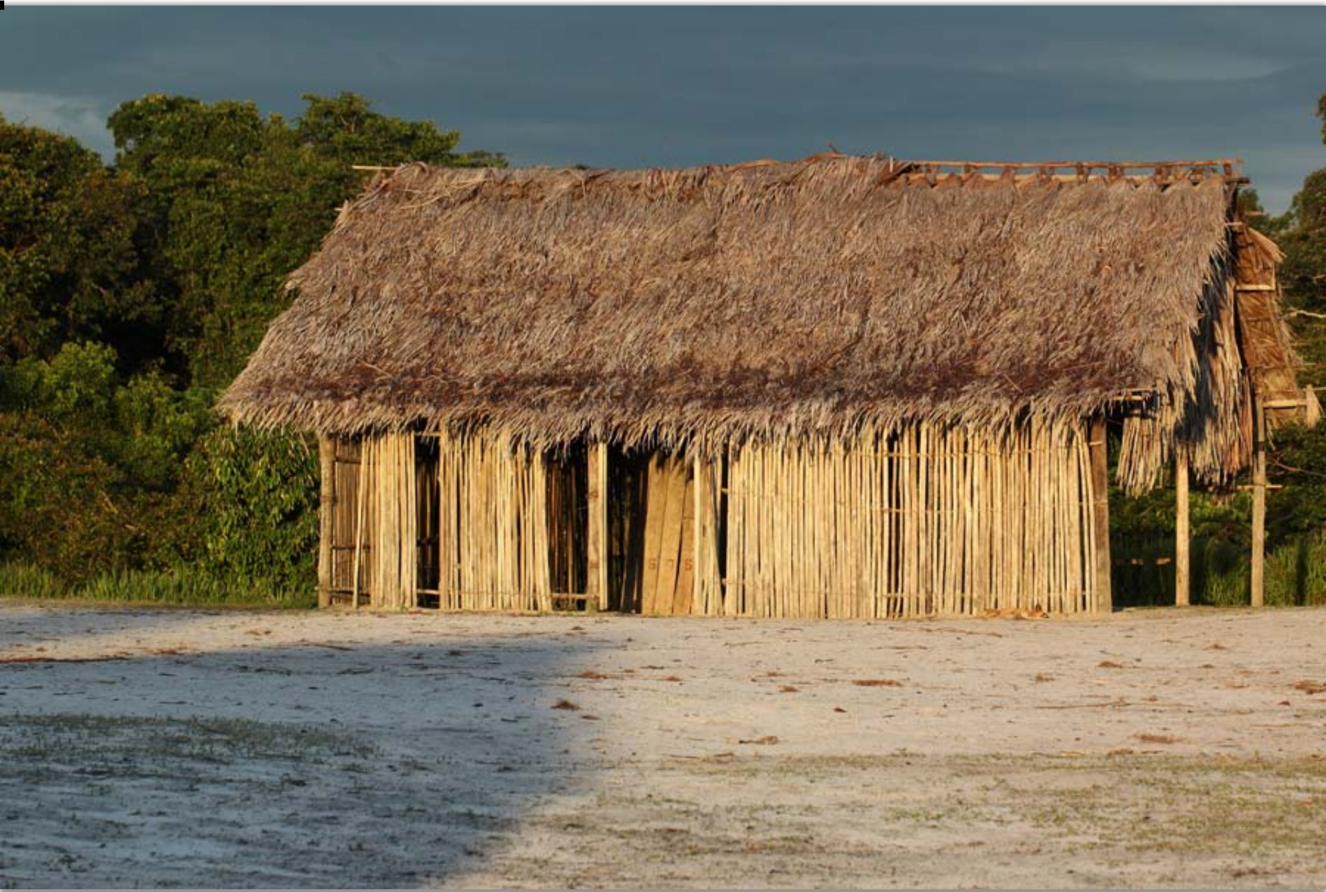
House for the radio in the village