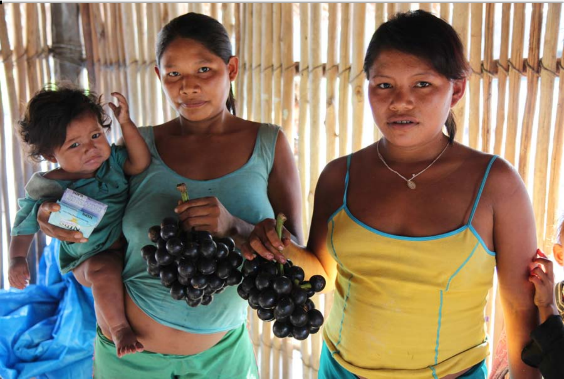
We exchanged soap for cucura , a fruit from the Amazon forest