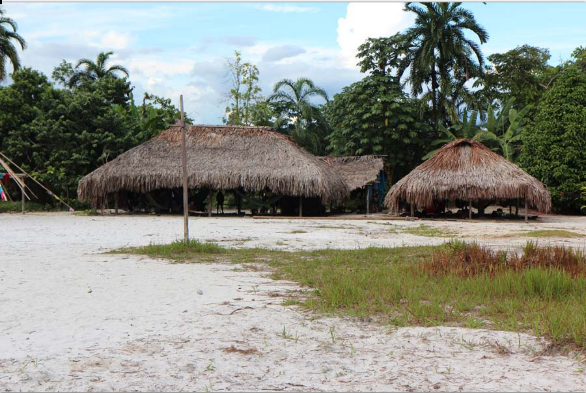
Some houses have no walls