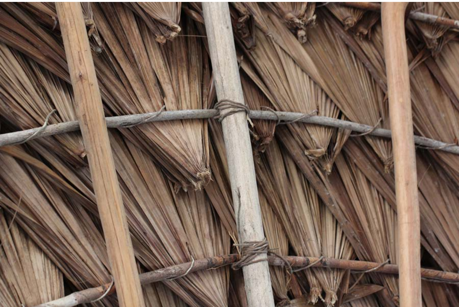
Detail of the covering of the roof, with caranã palm leaves