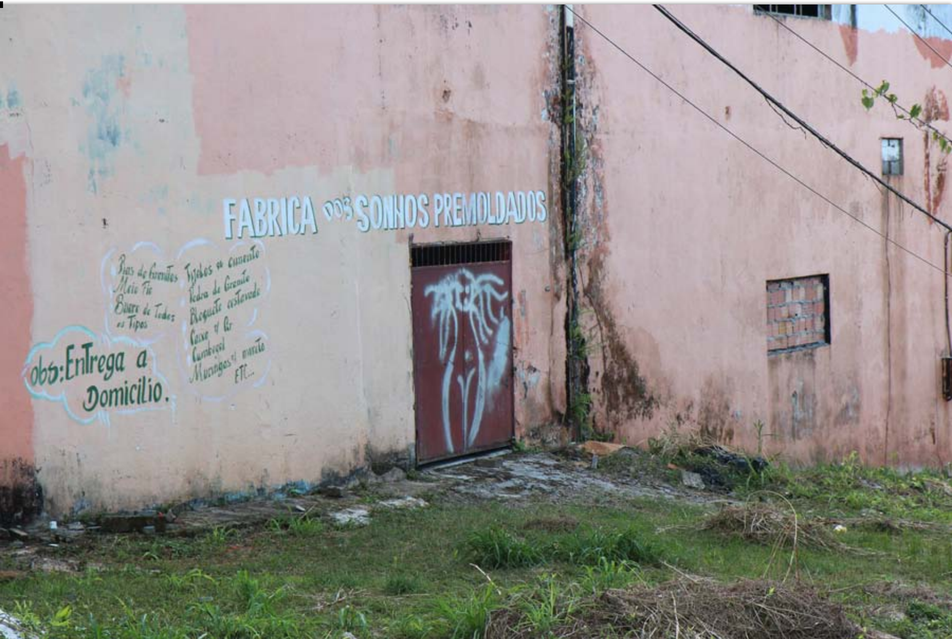
City center, São Gabriel da Cachoeira, AM