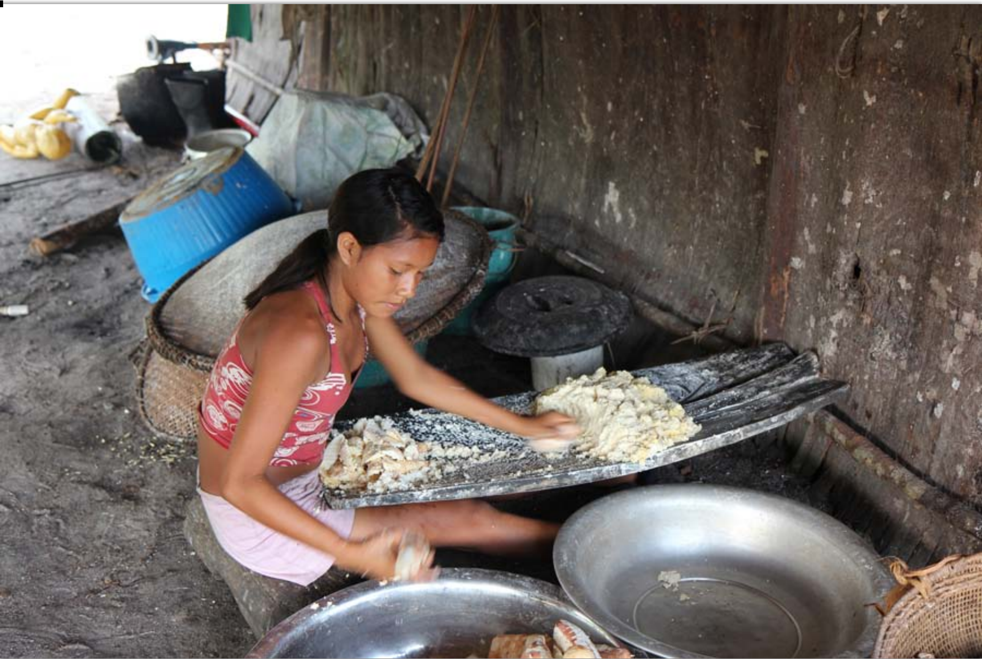
With the yellow manioc they make a delicious flour