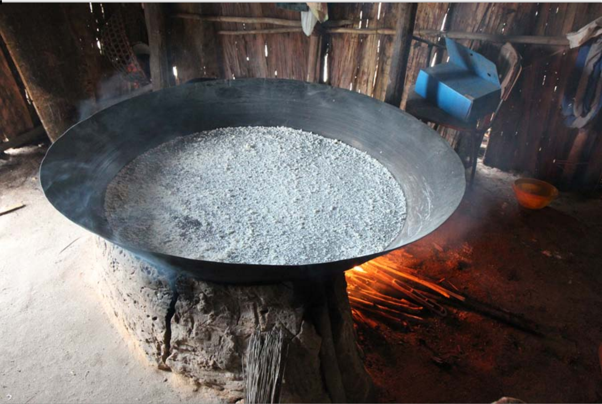
Beiju , the manioc bread