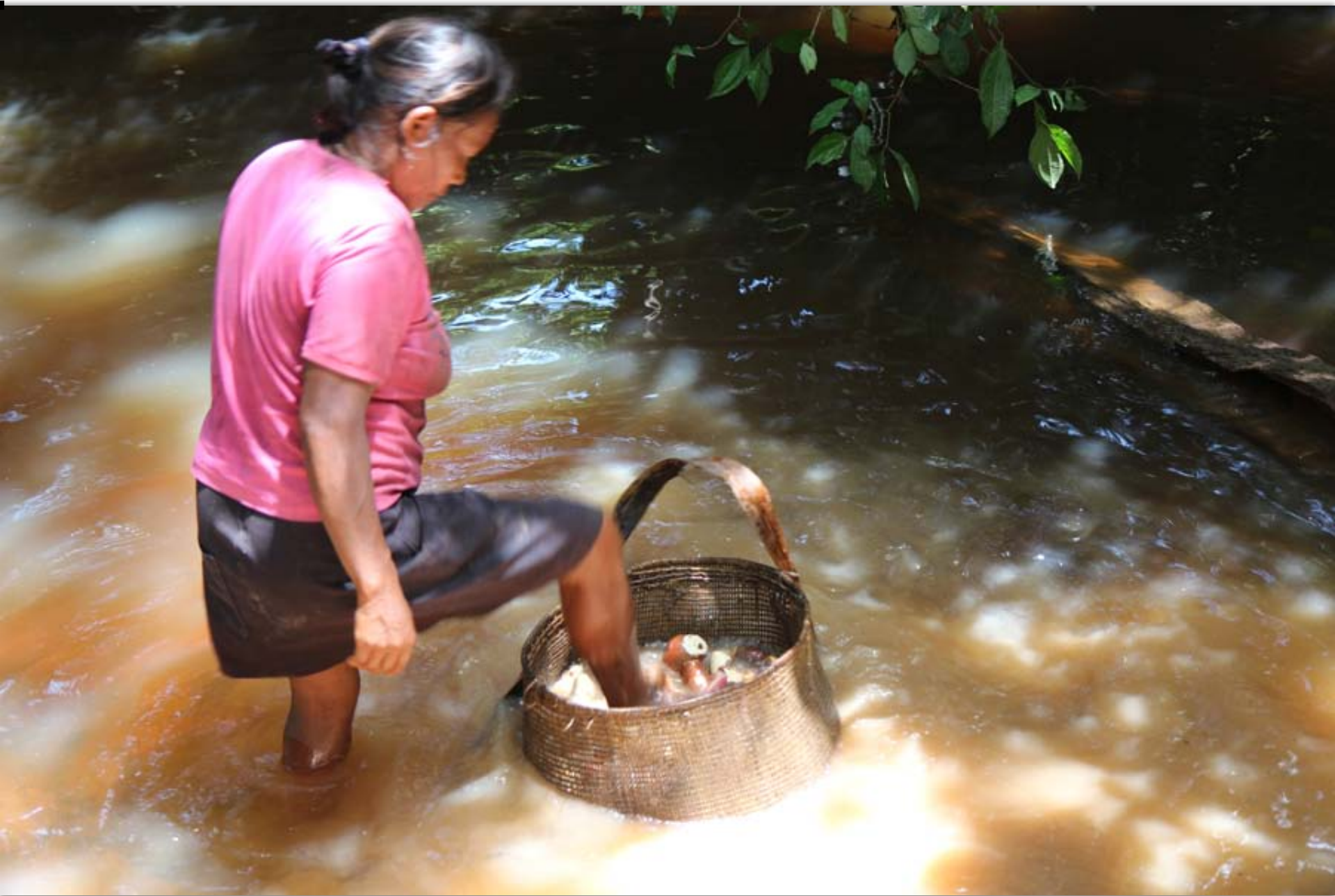
On her way back she washes the manioc in the river