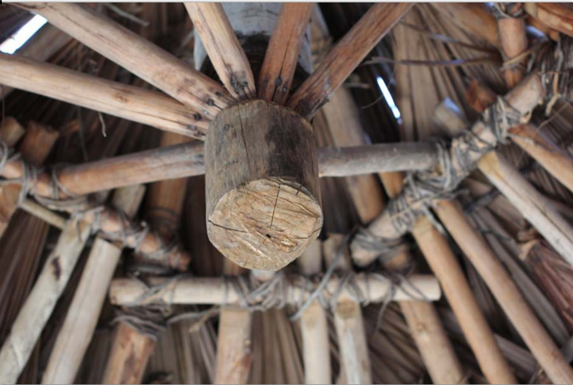
Detail of the roof in a Hup'däh house