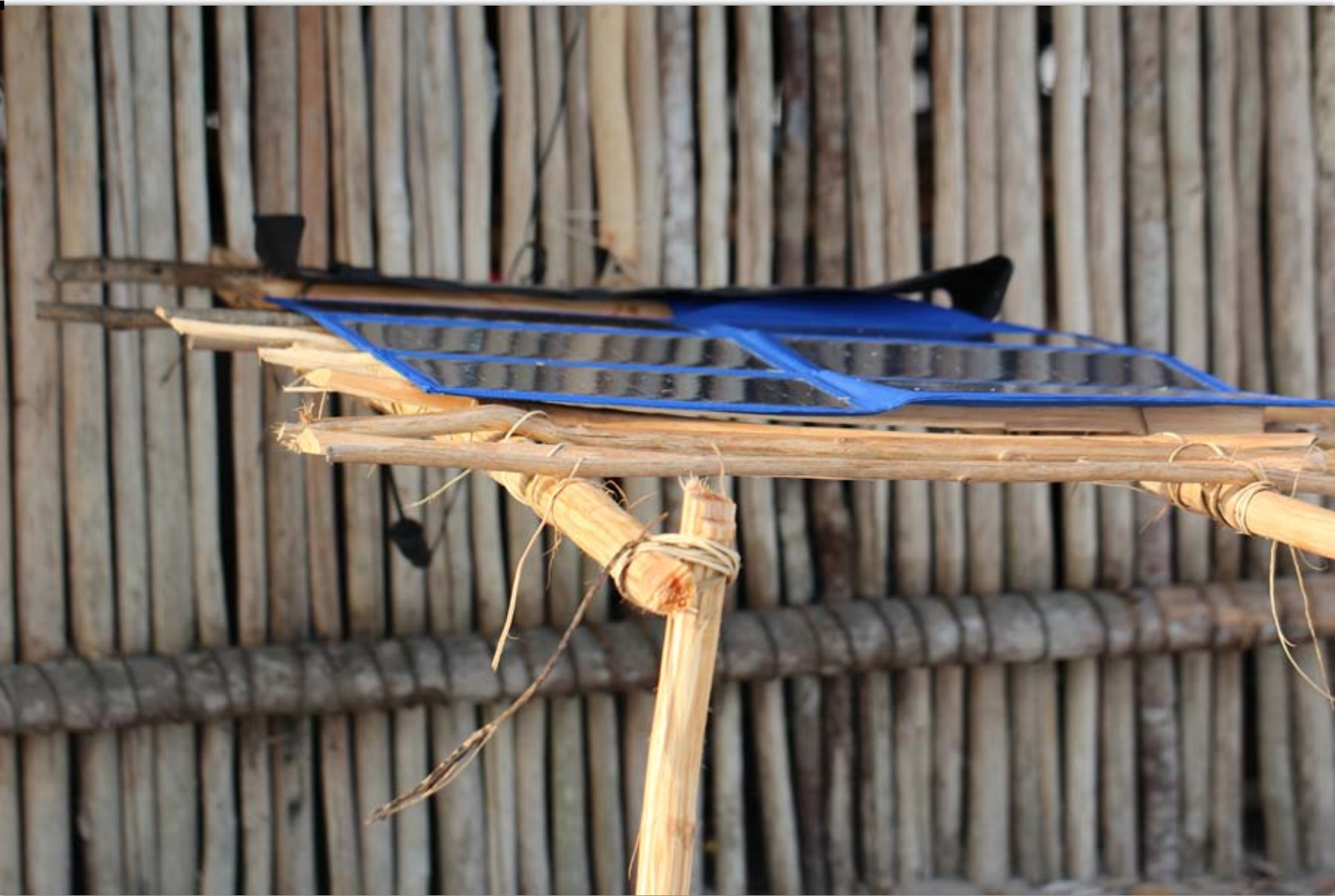
We used the solar panel to charge batteries