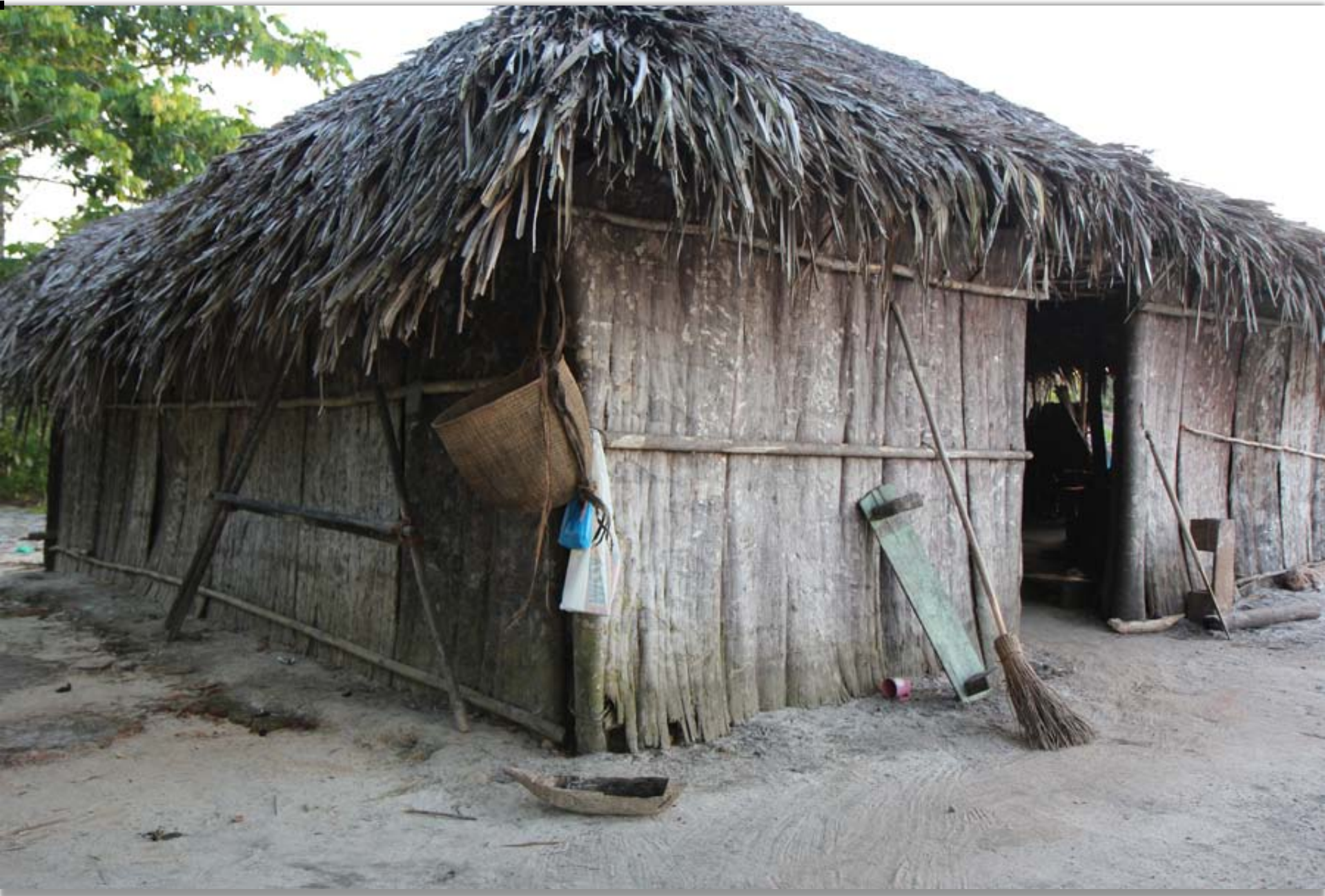
A Hup'dah house