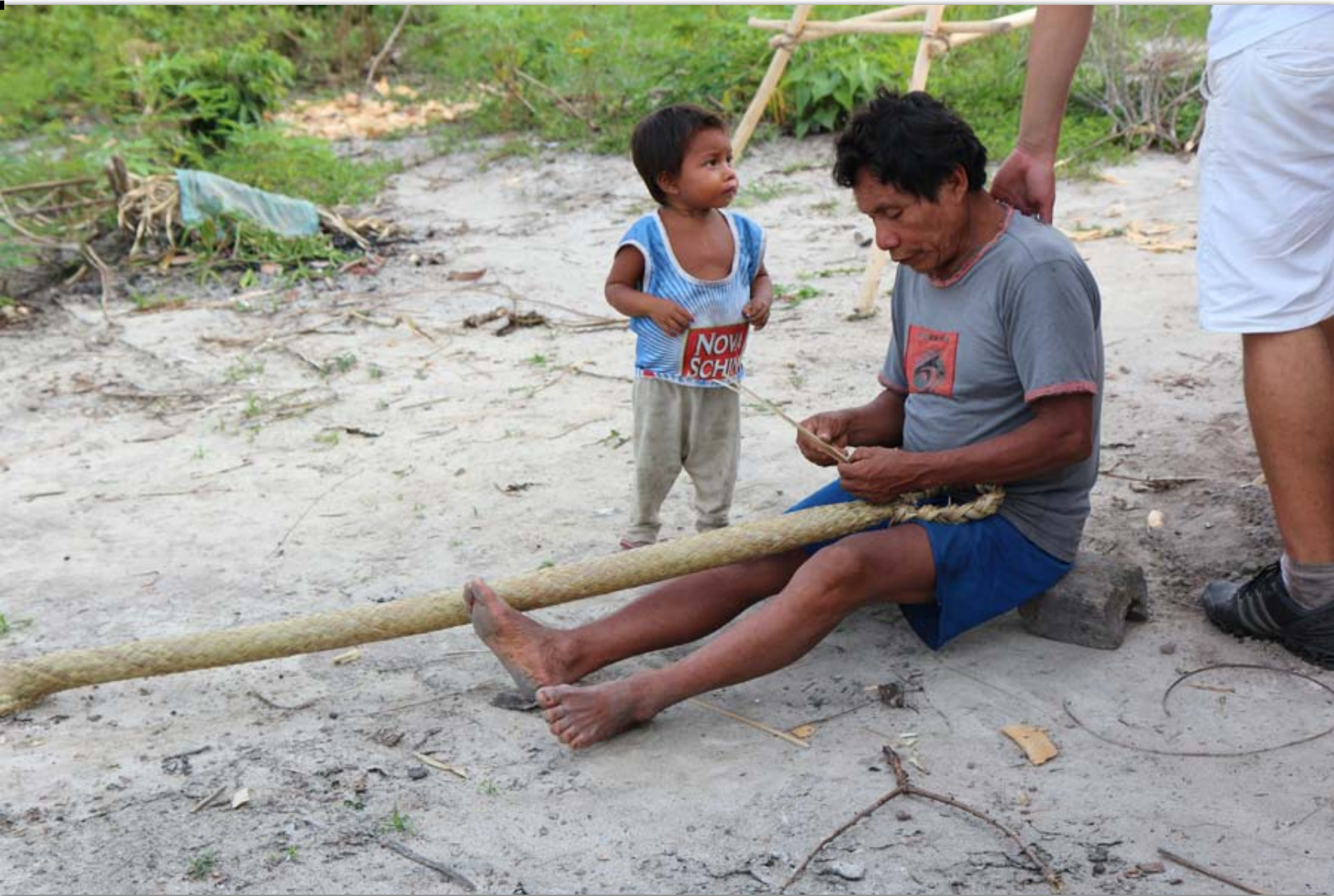
Tipitis are made by men