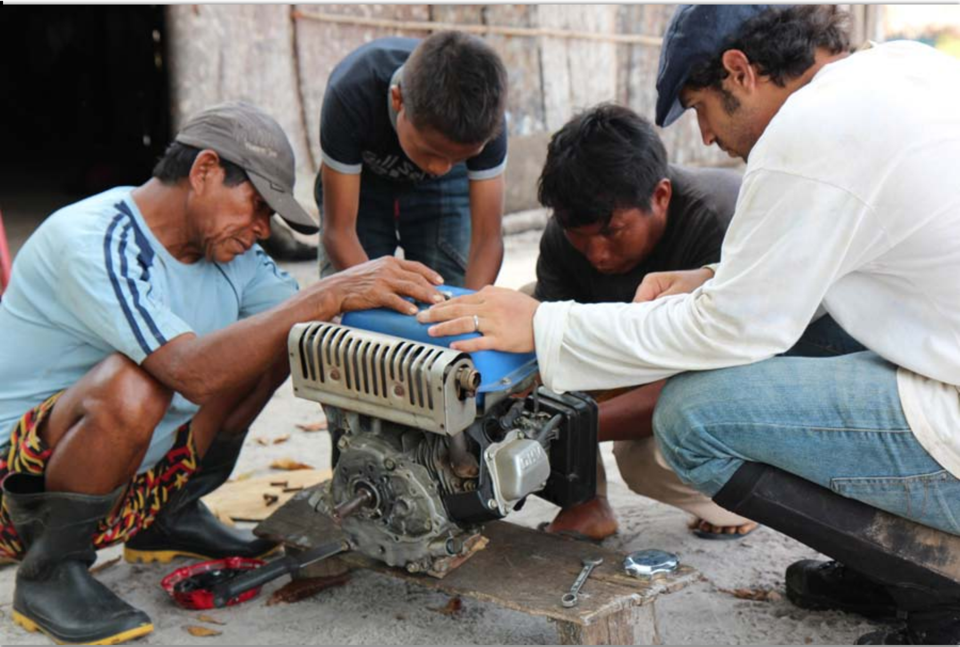
The canoe motor needs to be repaired