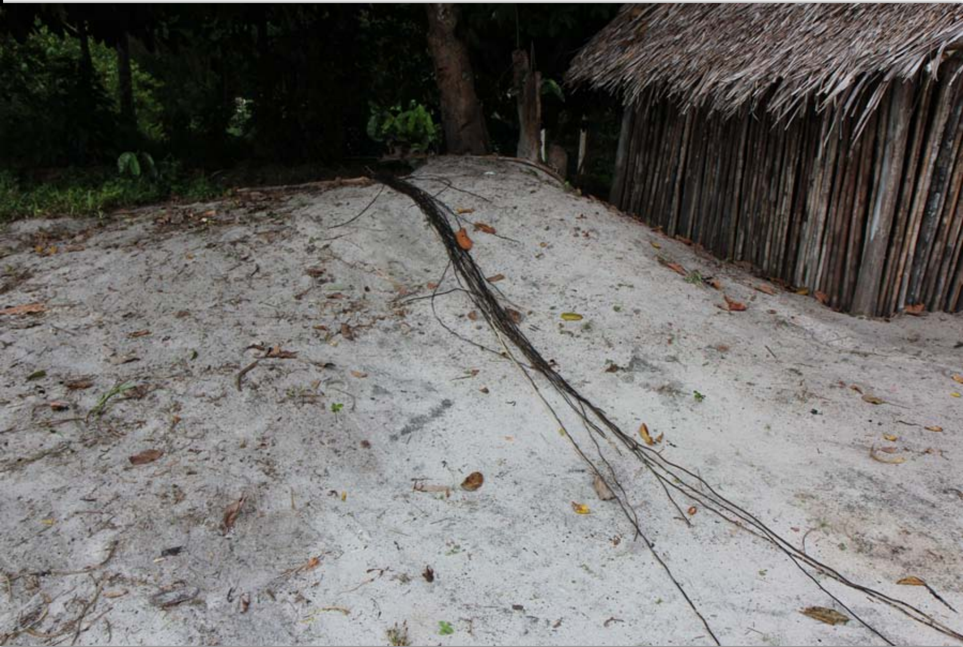
Vine to bind straw for roofs and for making tools