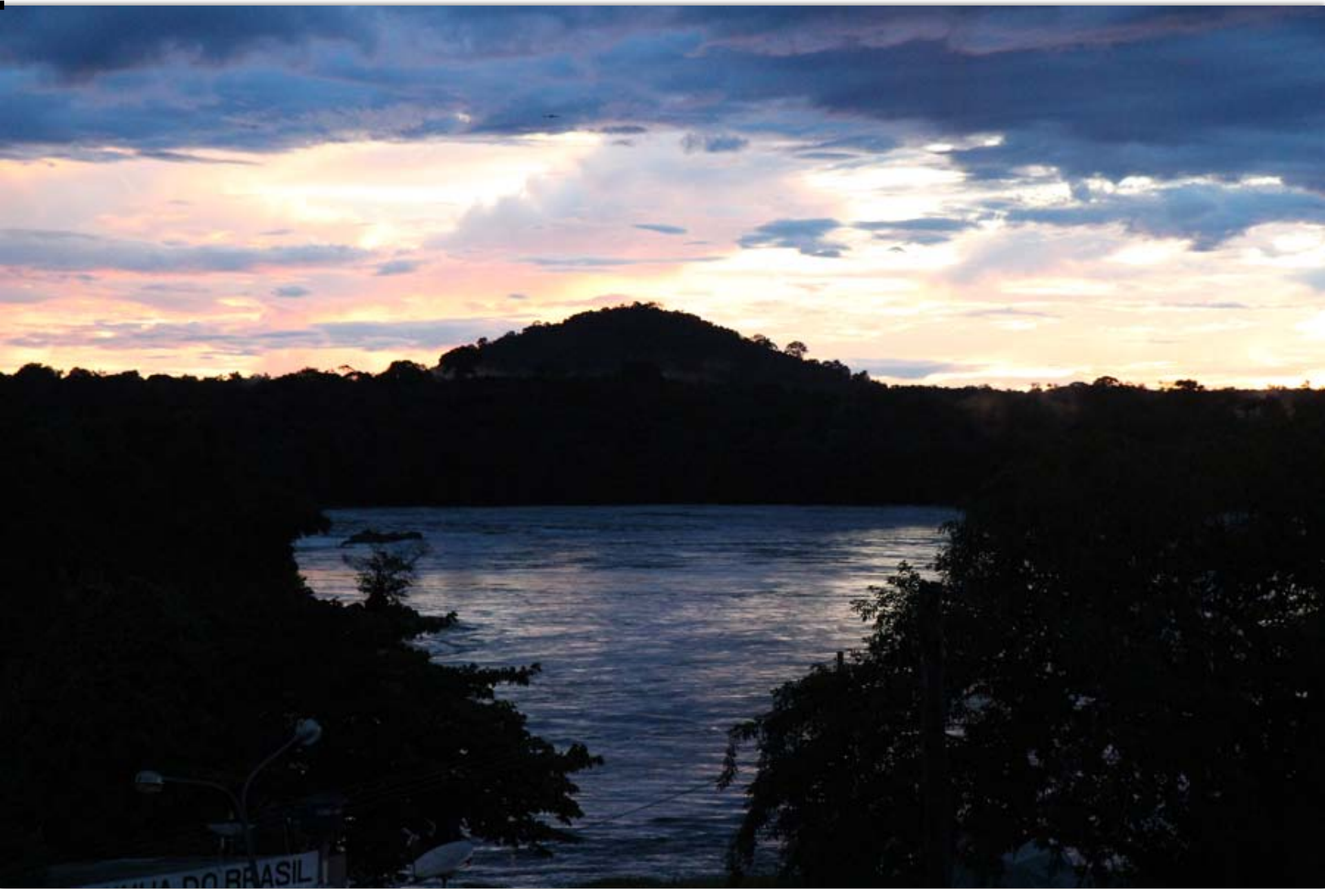
Alto Rio Negro