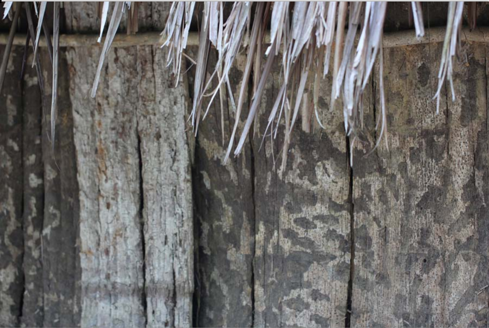
Paxiuba (Iriartea Deltoidea) is a good palm tree for making house walls