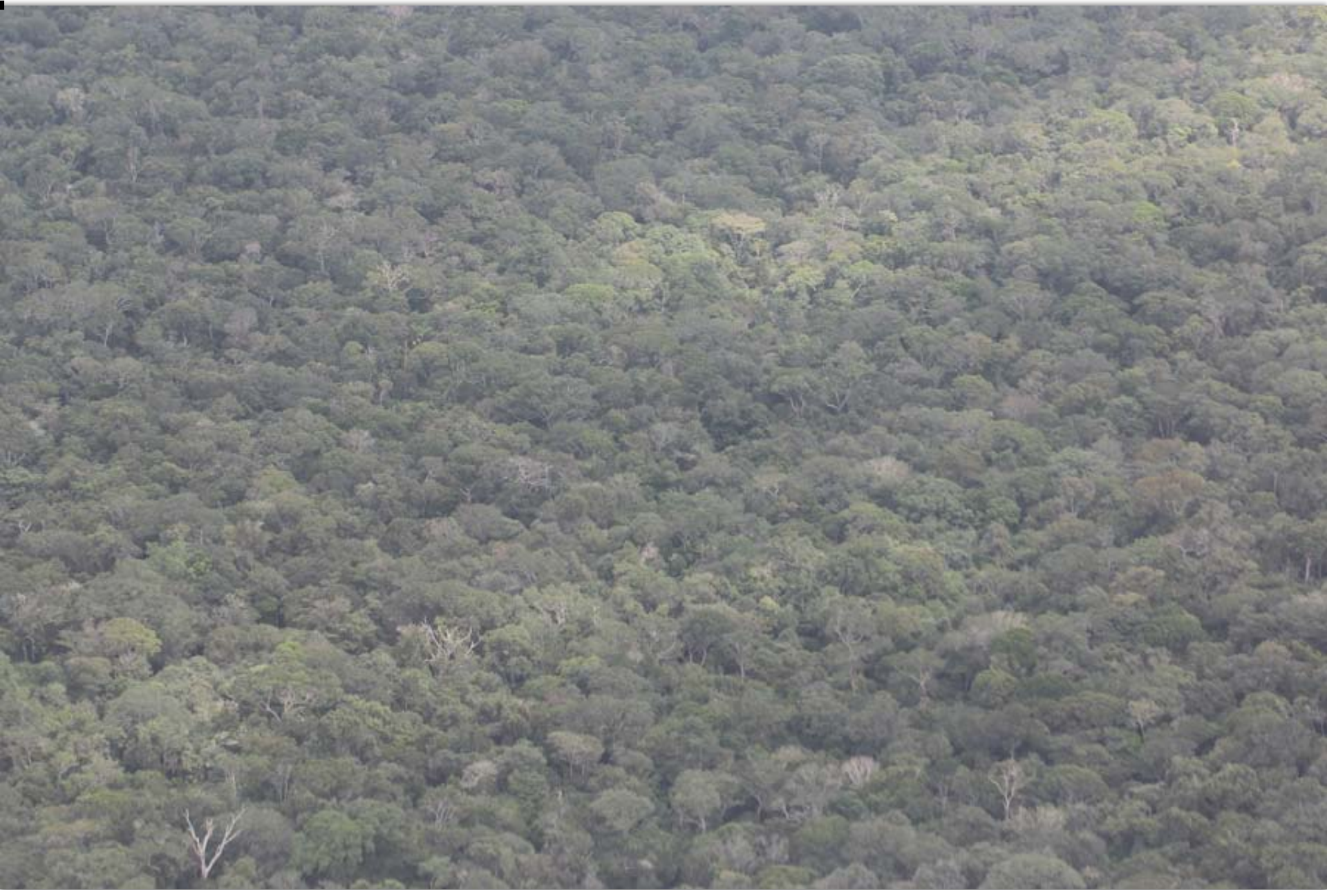
Amazon Forest, aerial view