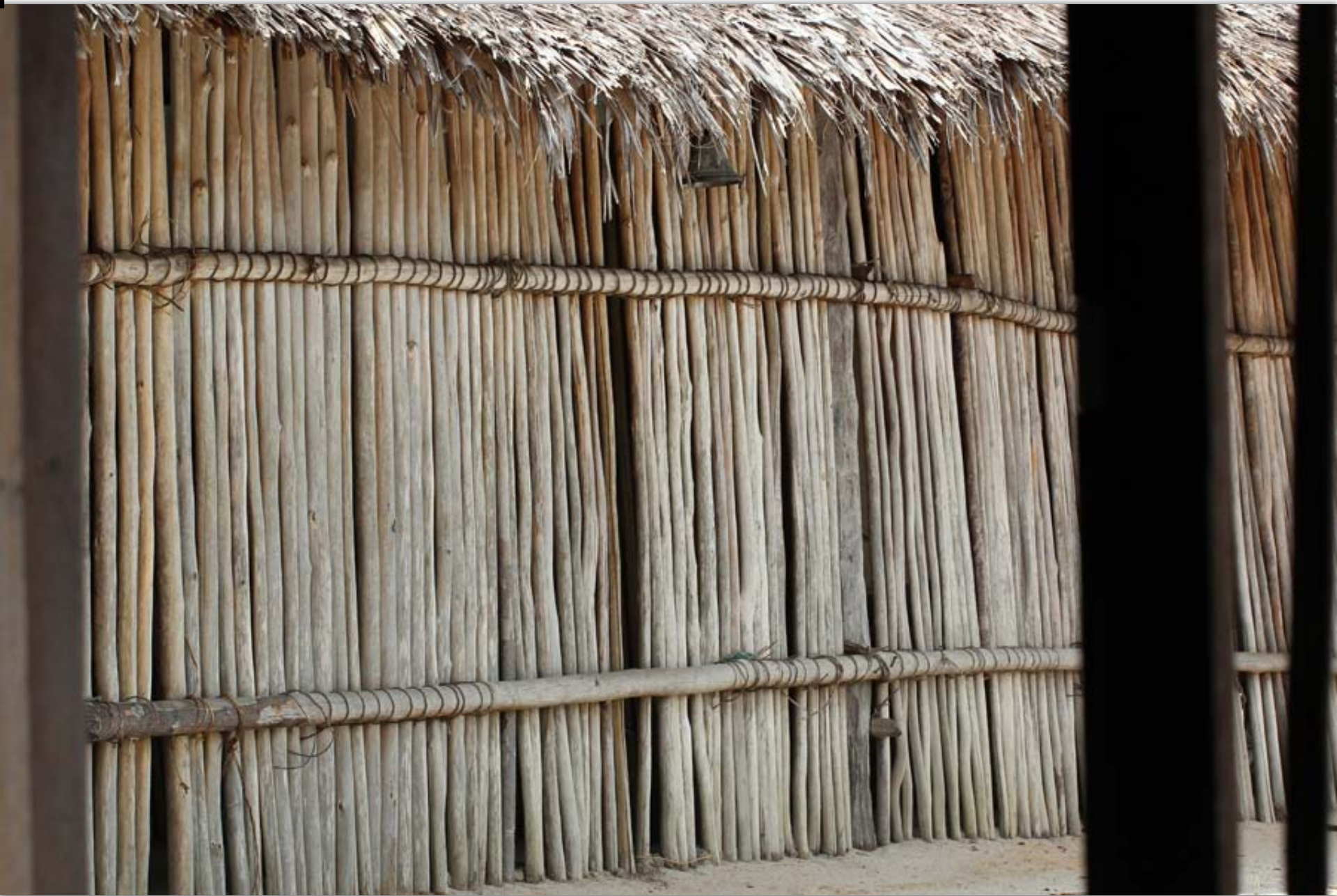
When the bell rings, it is school time for the children