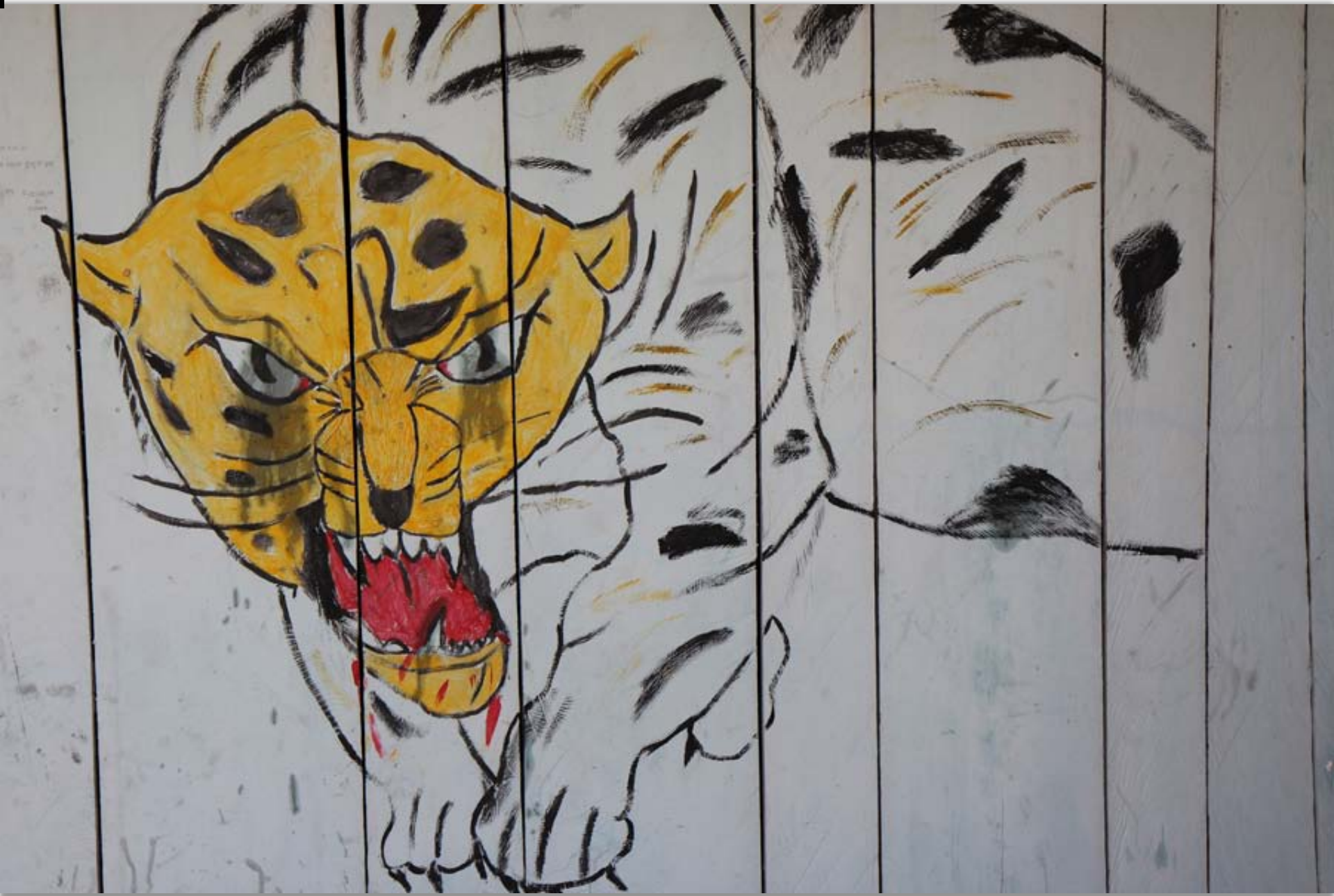
Graffiti in one of the villages