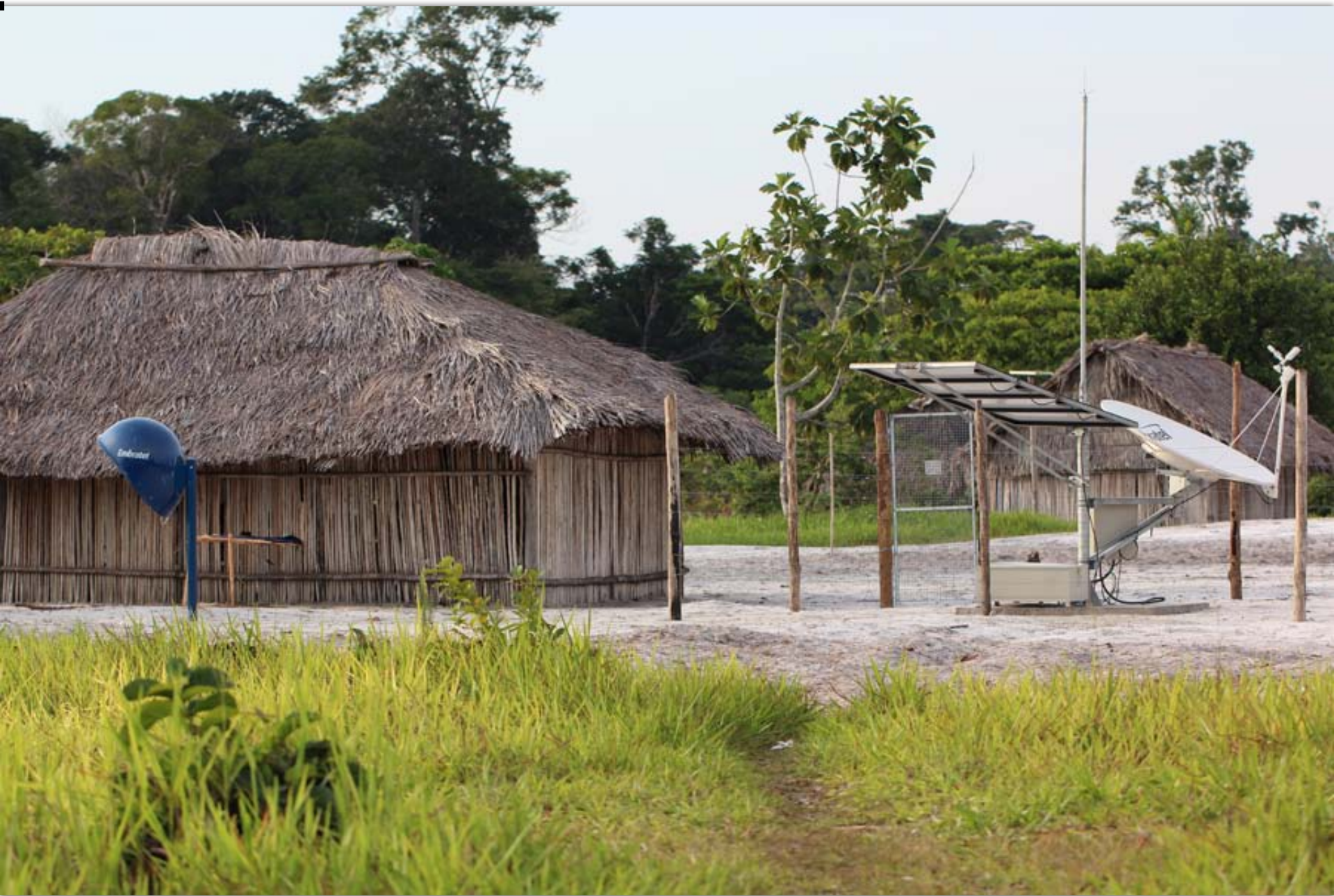
Public telephone in the village