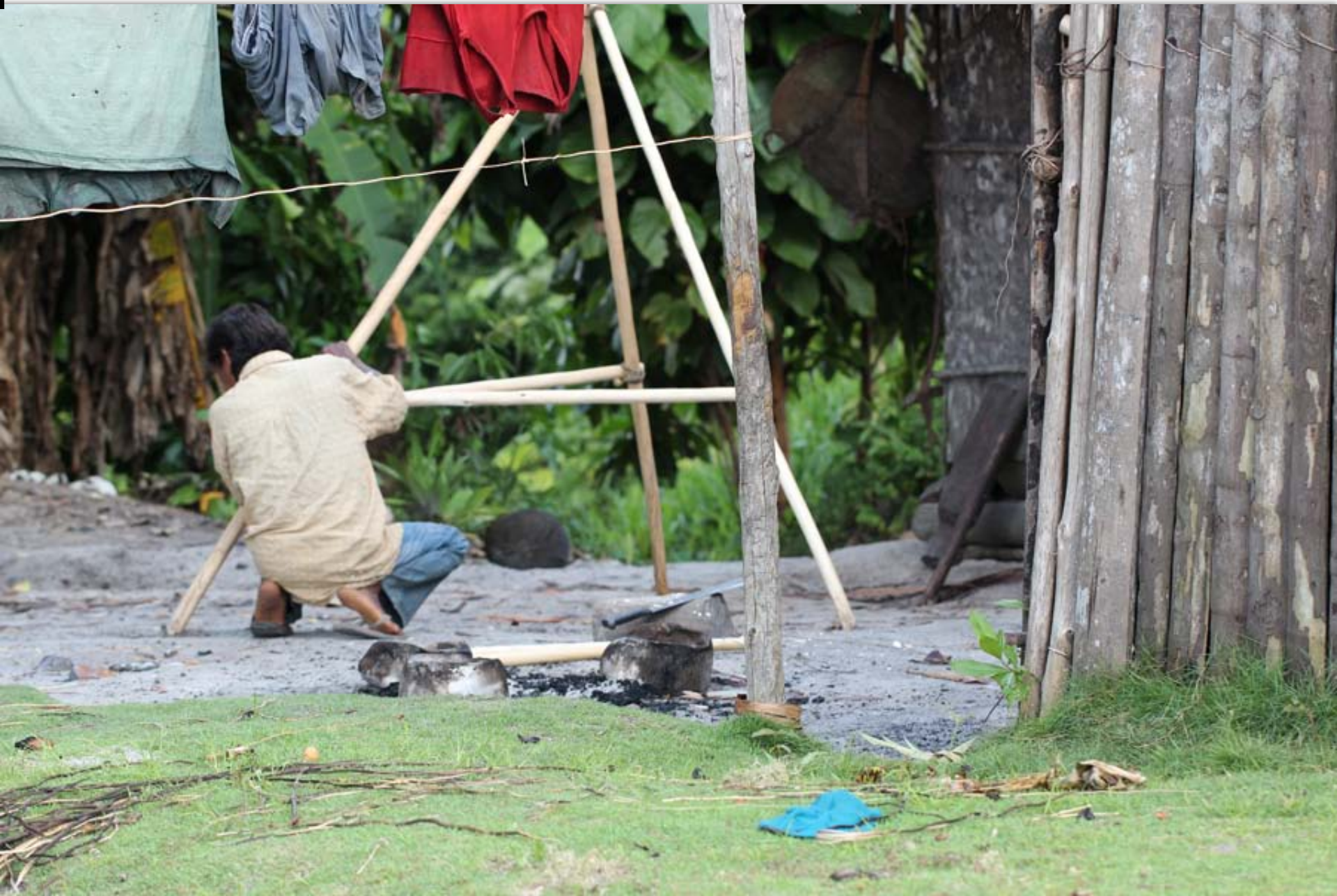
Men are in charge of making the base to support the manioc grater