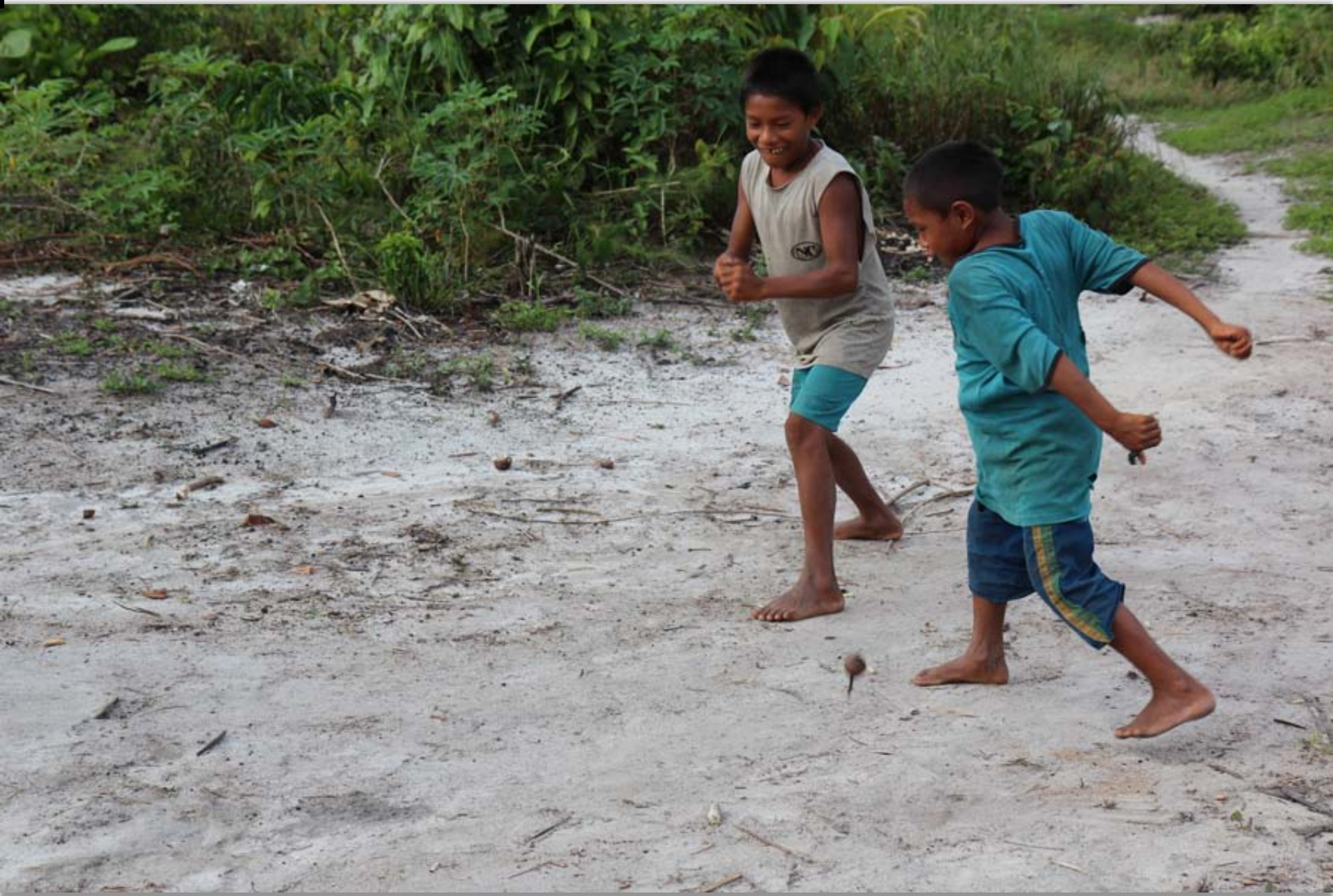
Boys play with their spinning top