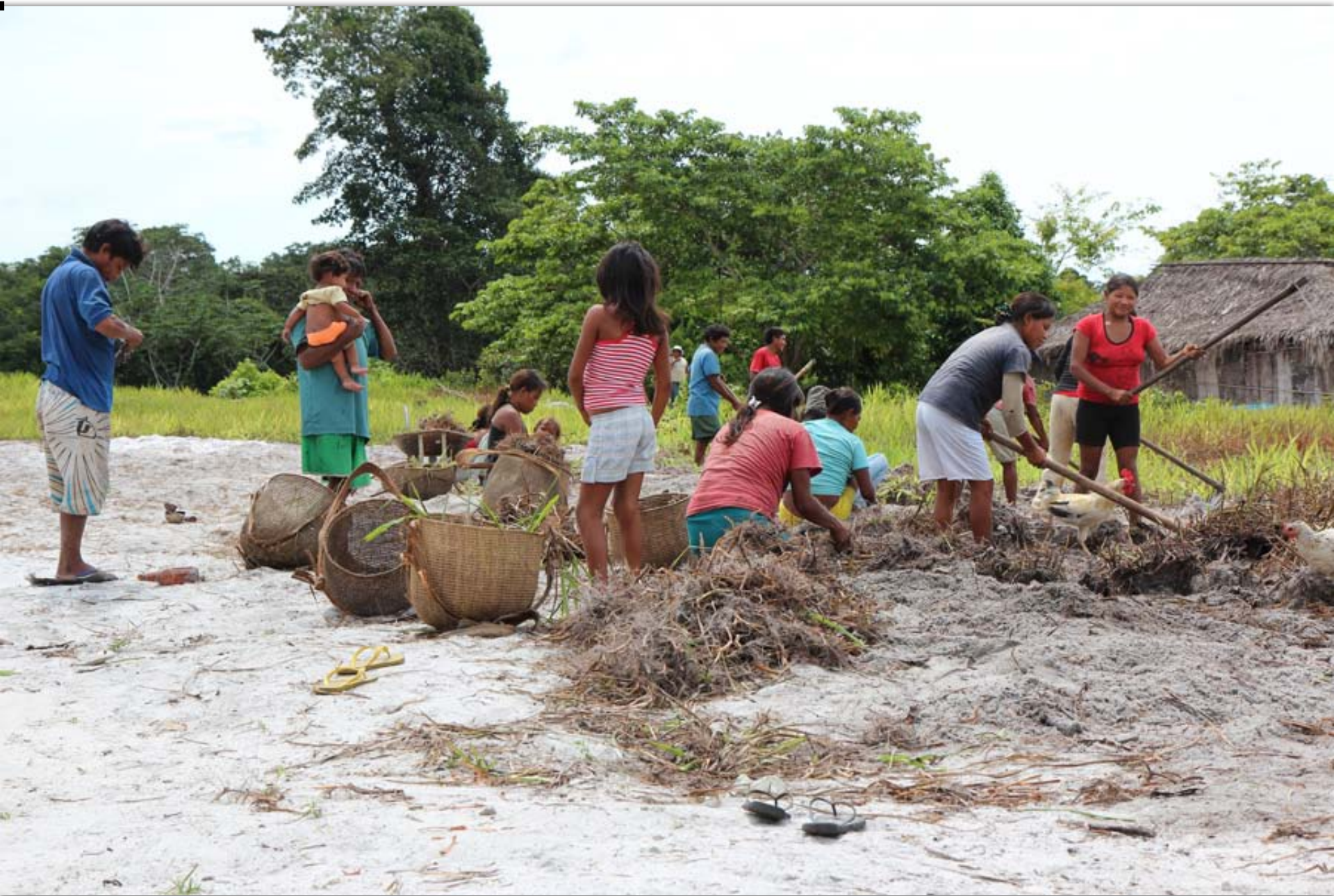
Families gather to clear the grass in front of their houses