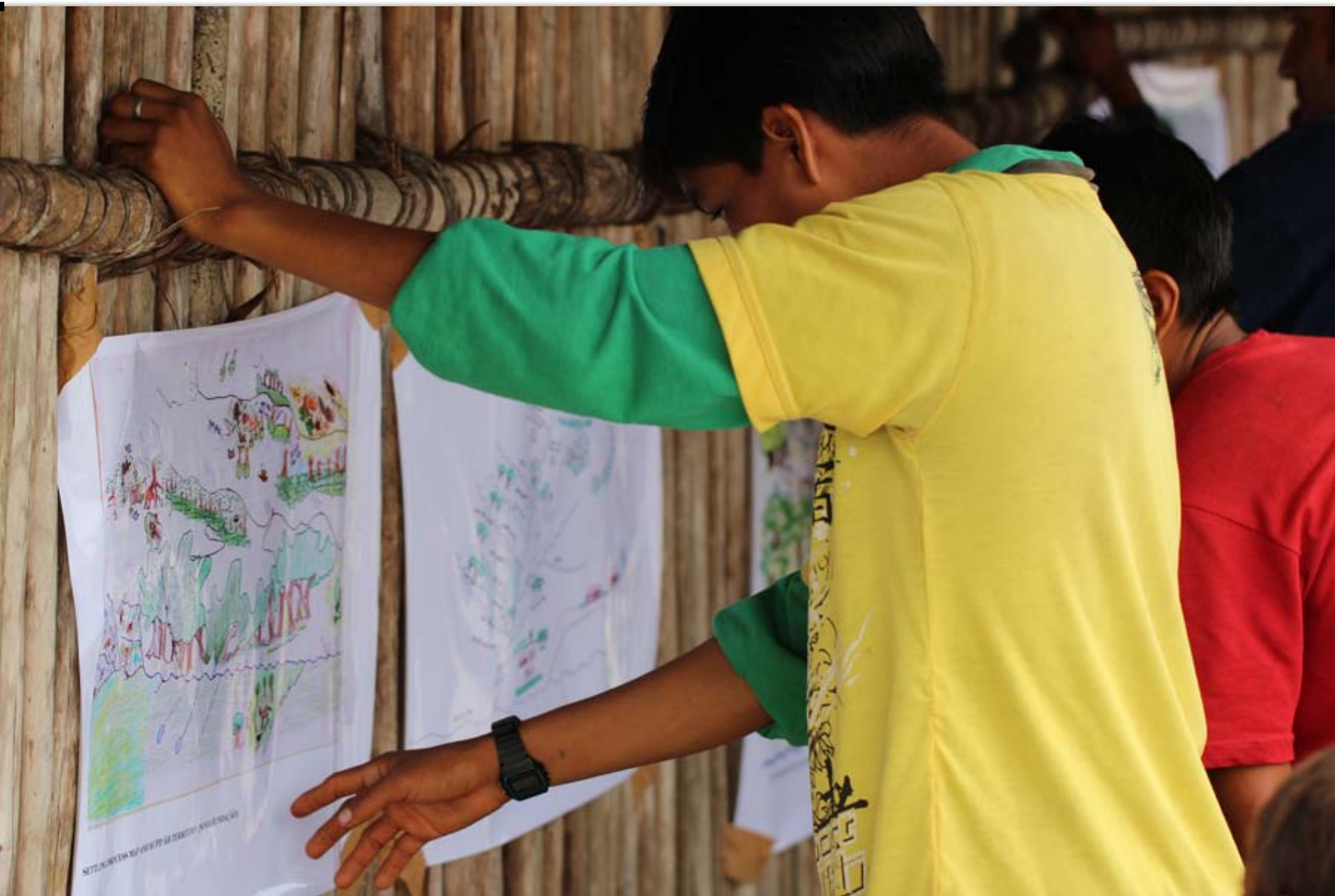
Village maps, made by the Hup'däh , are hung on the wall