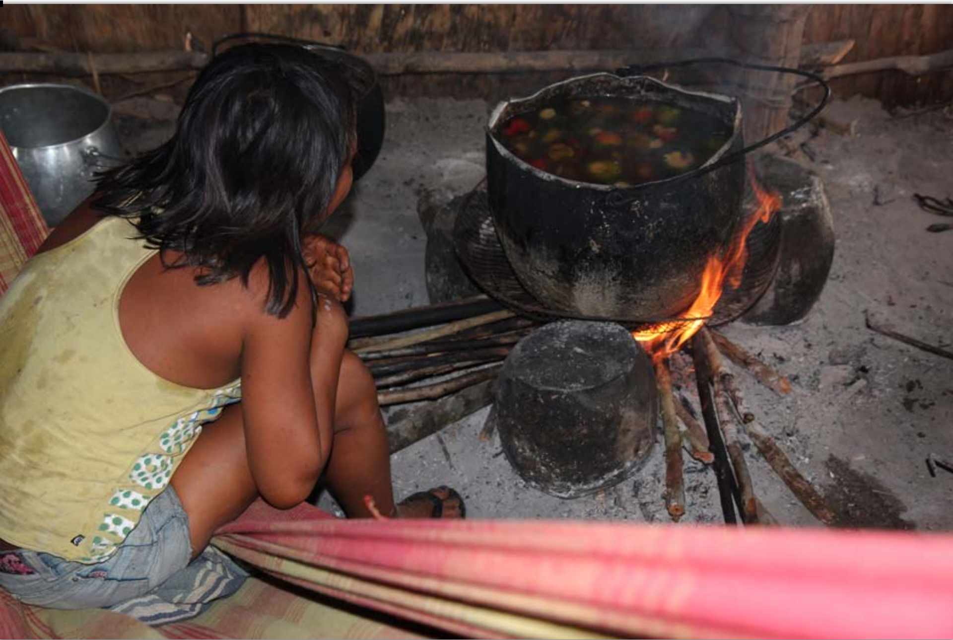
Pupunha palm hearts must be boiled for quite a long time