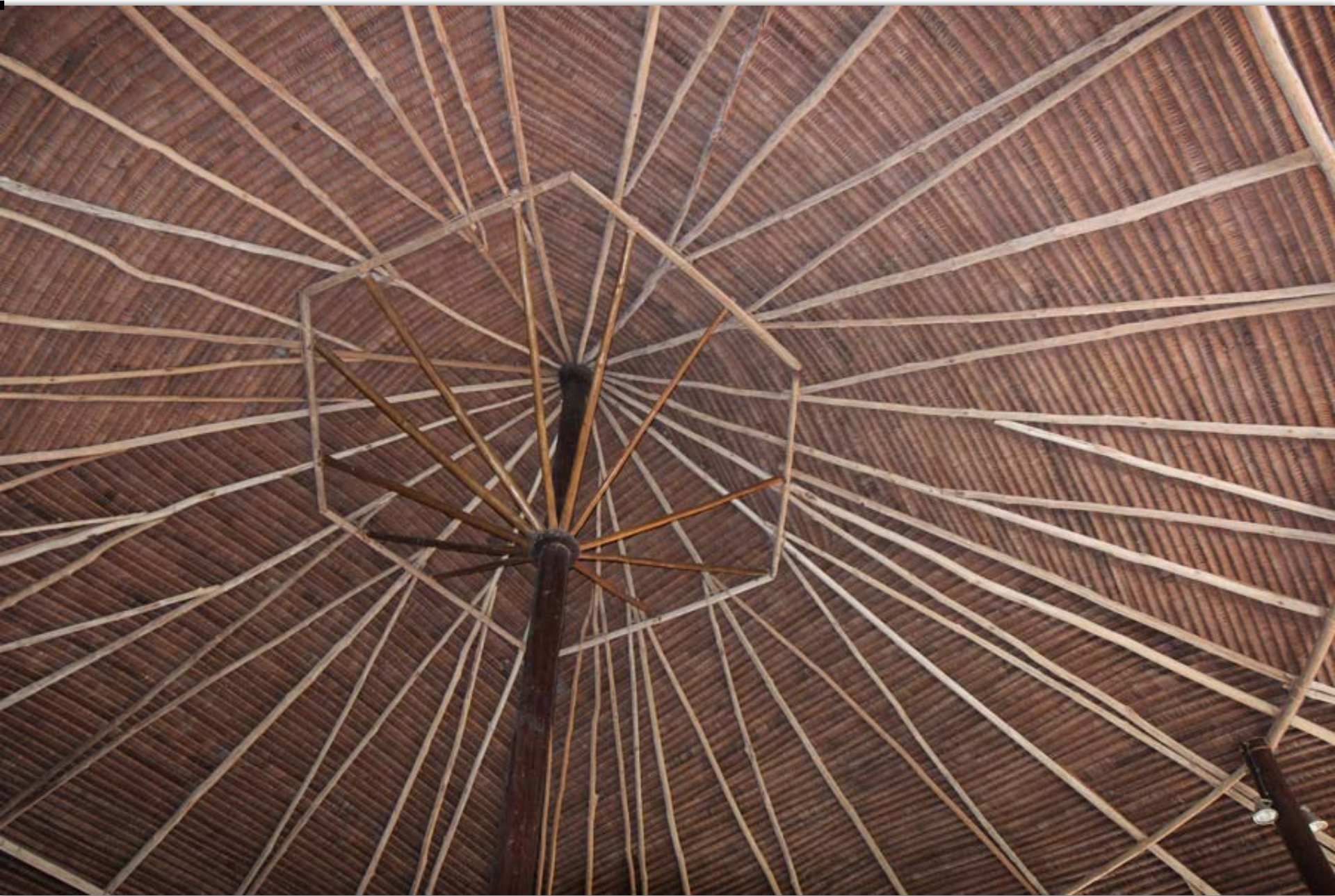
View of the roof from below