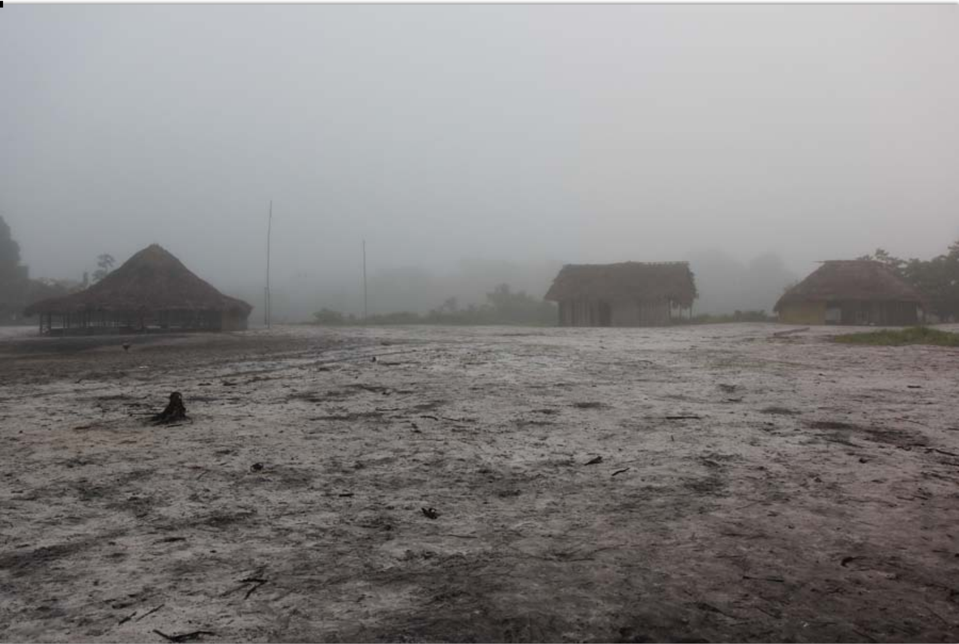
In the mornings a heavy fog covers the village