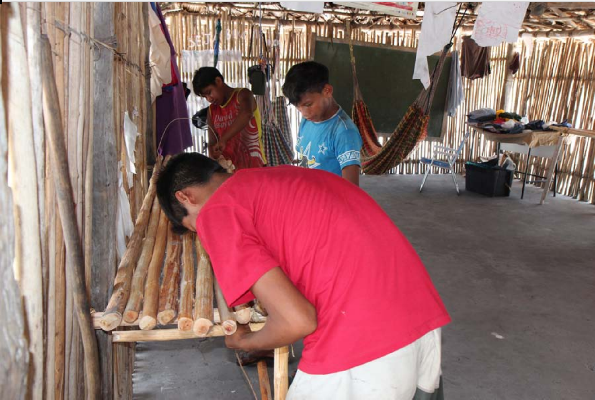
The boys quickly made us a shelf on which to keep our things