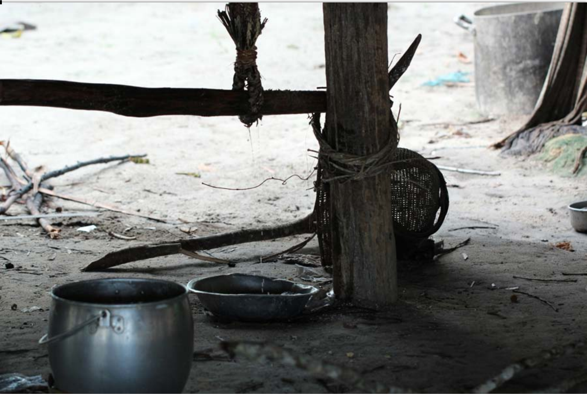
The manioc poison drips into a basin