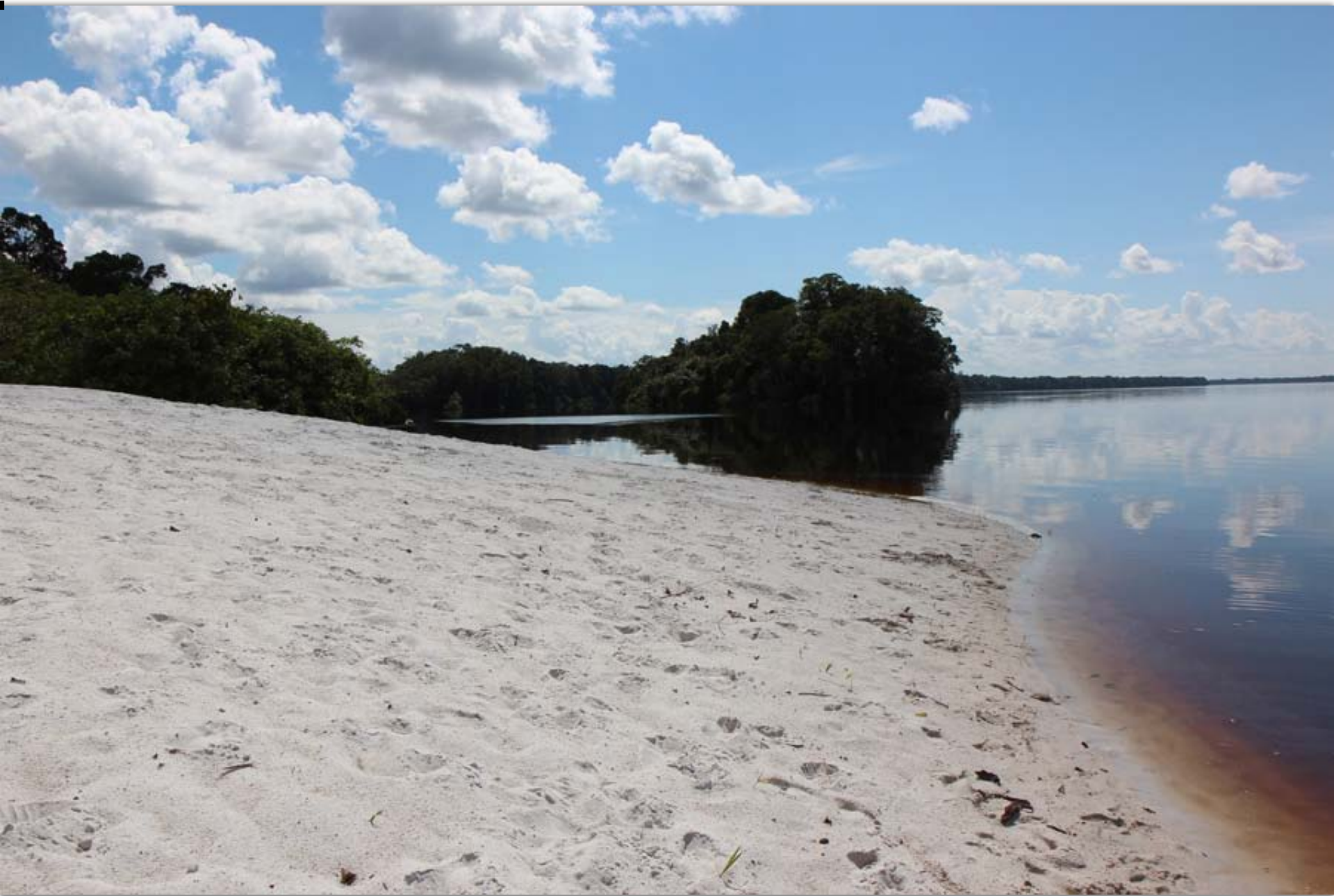
A harbor in Uaupés River, near Monte Alegre, formerly known as Matapi