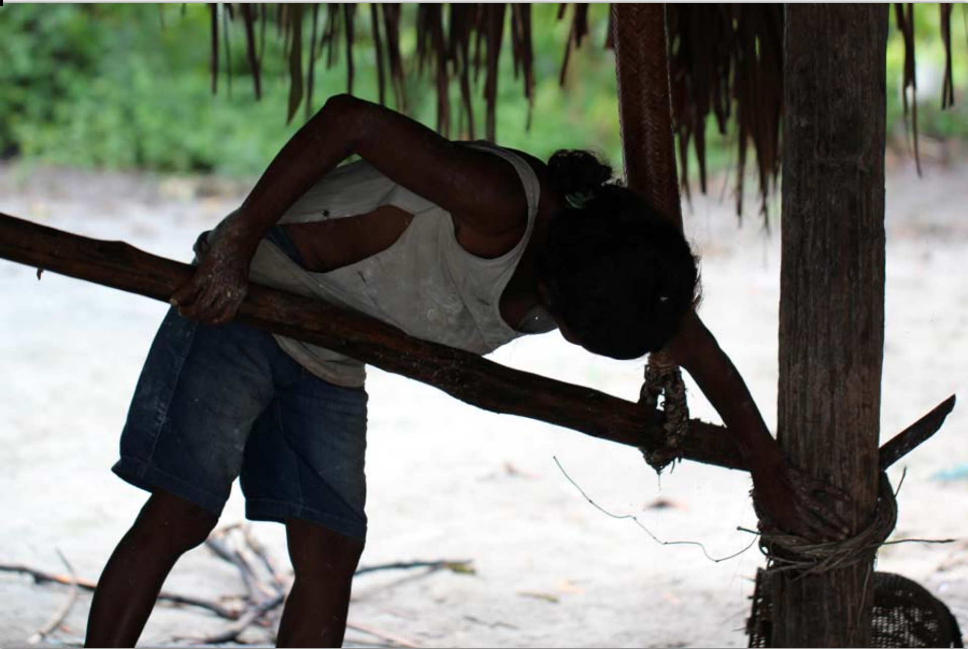
The tipiti is used to take the poison out of some types of manioc