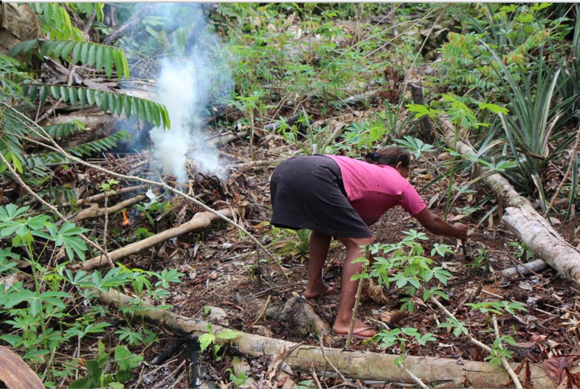
Isabel plants and collects manioc in her garden