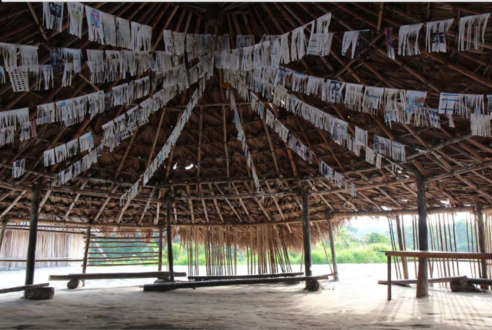
Straw-thatched hut – the central house to drink caxiri