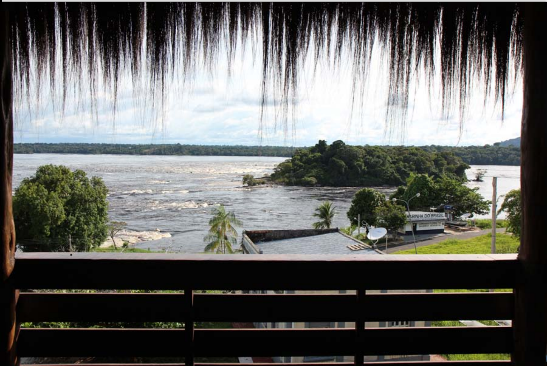
View of the Rio Negro from ISA