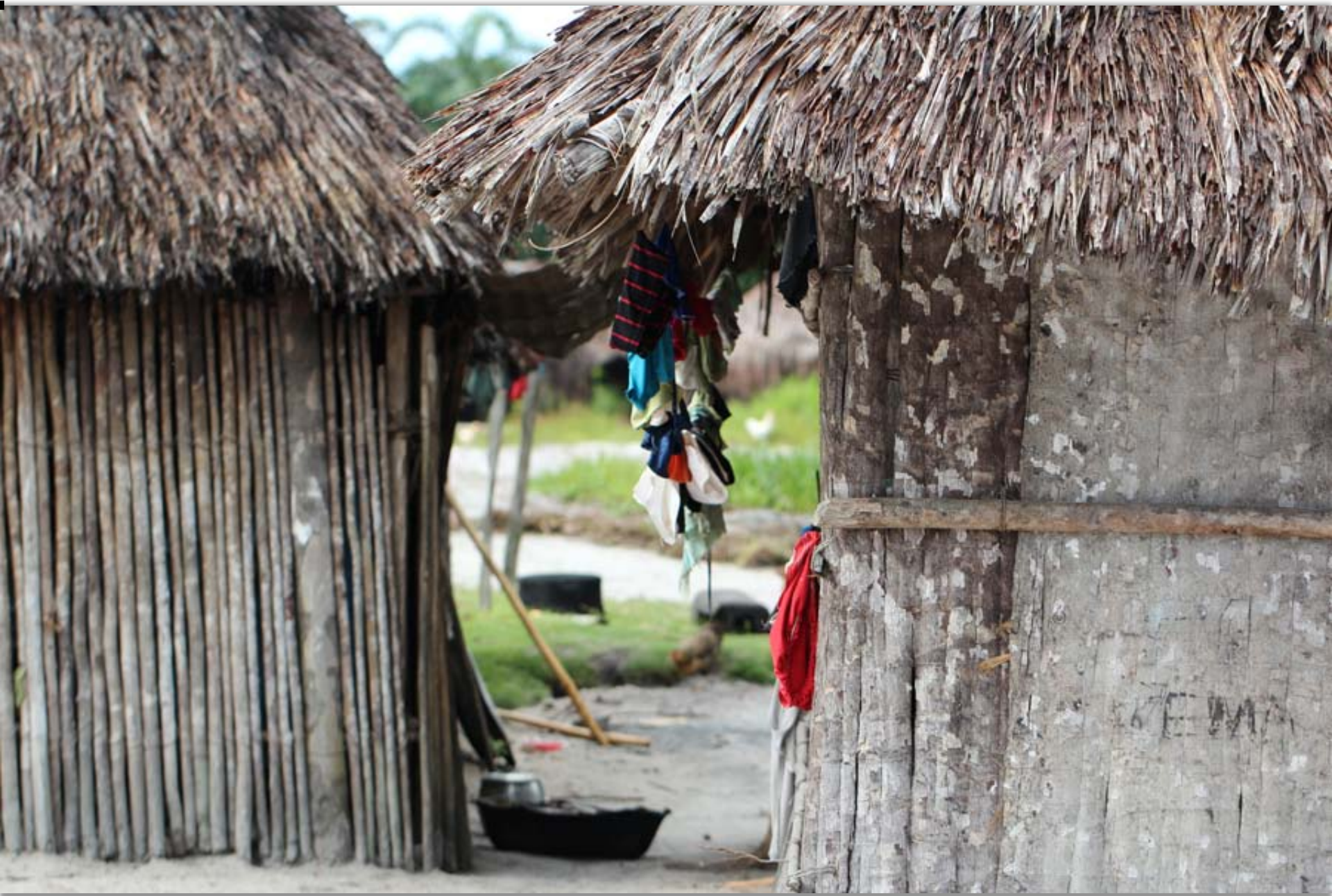
There are different solutions for constructing the house walls