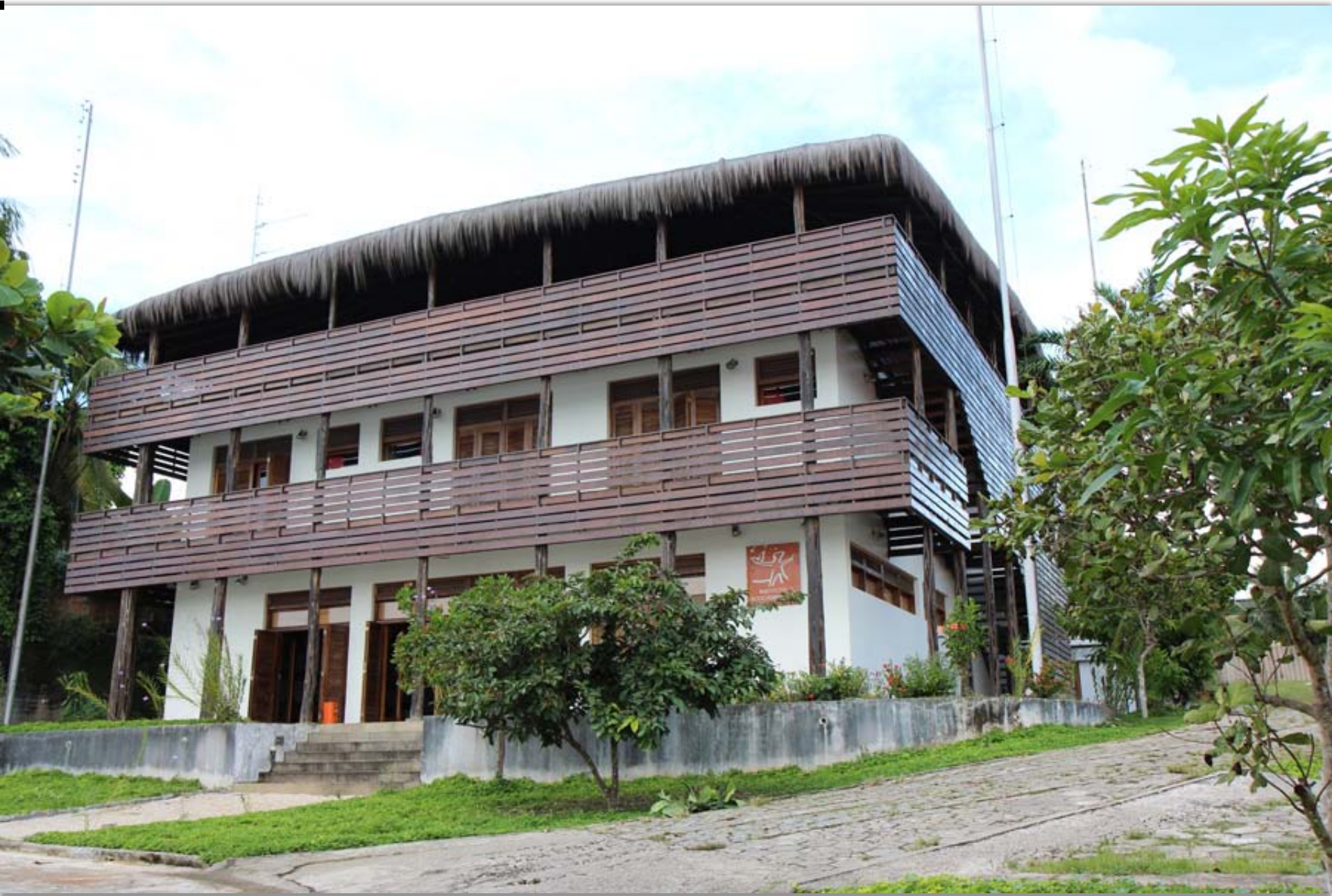
Instituto Socioambiental in São Gabriel da Cachoeira - AM