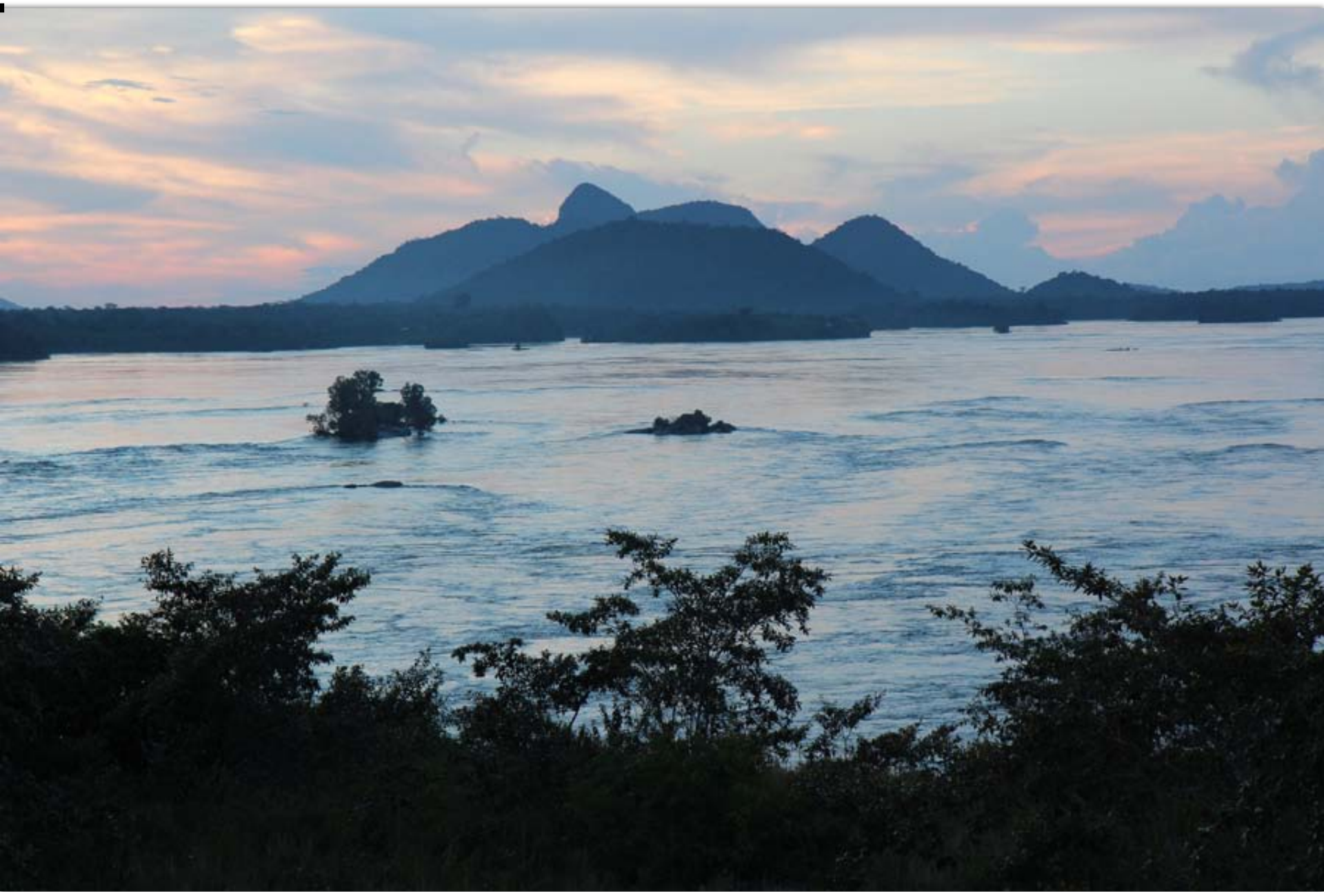
Serra da Bela Adormecida