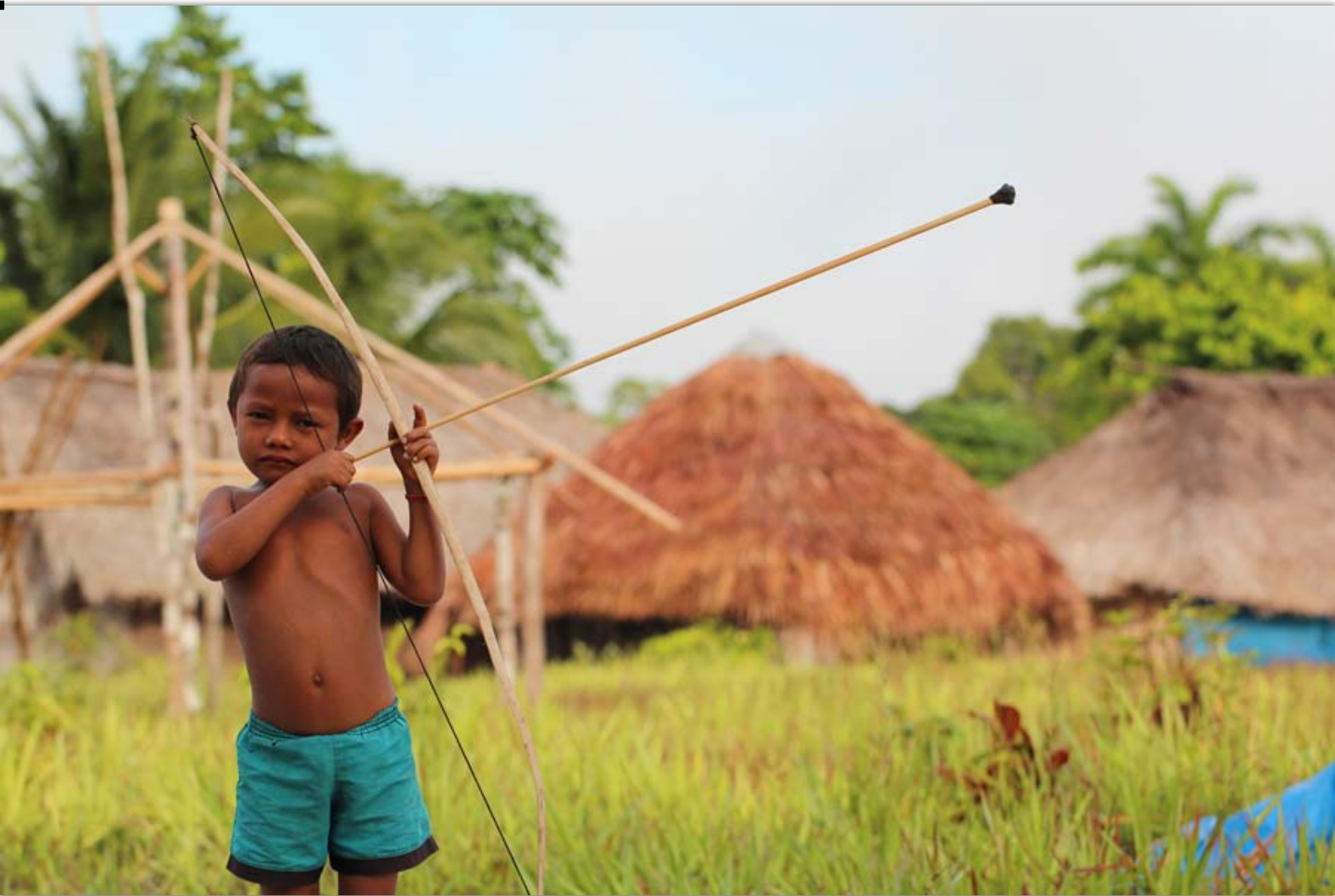
Bows and arrows tipped with tar are used by boys when they play