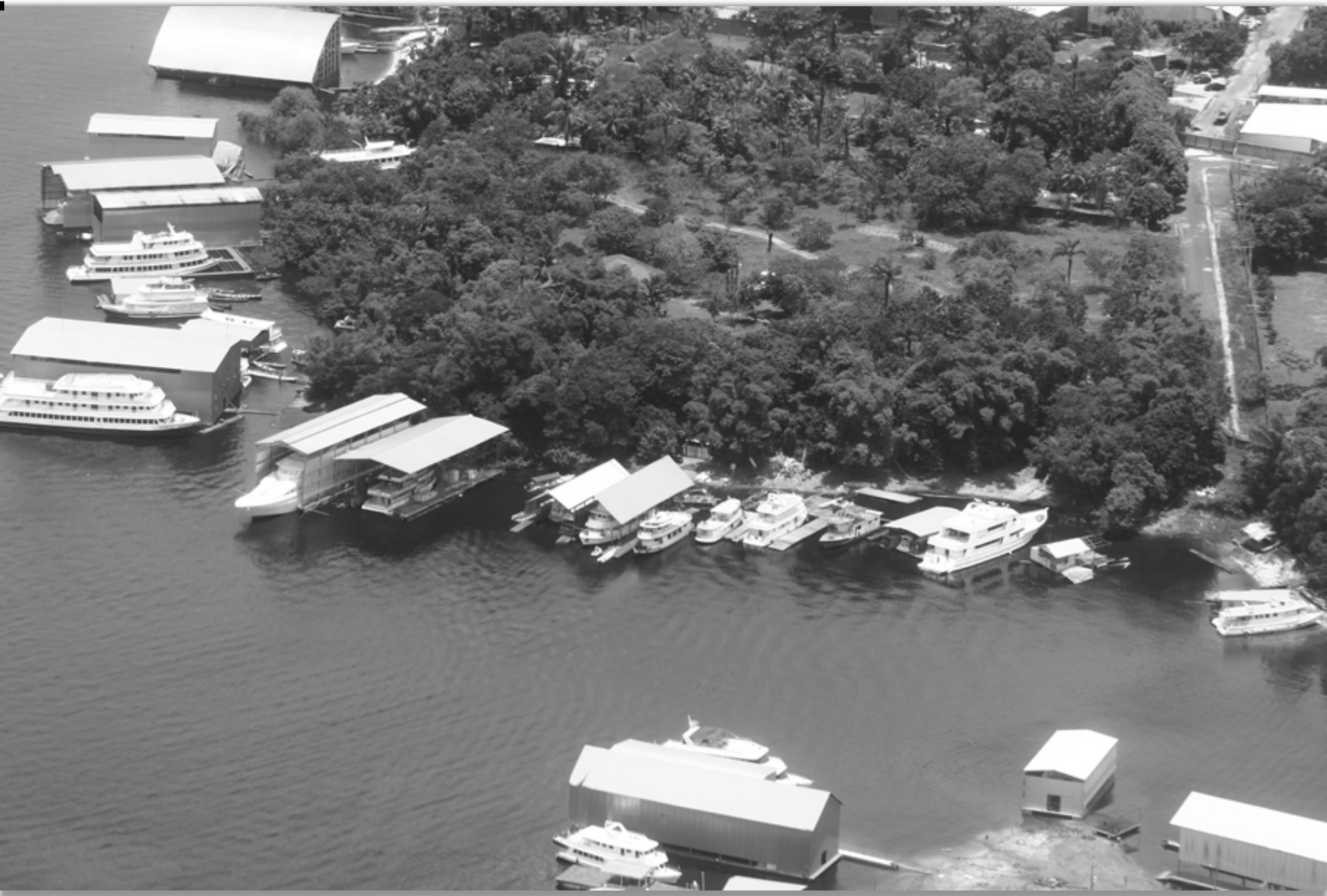
Barcelos, AM – aerial view