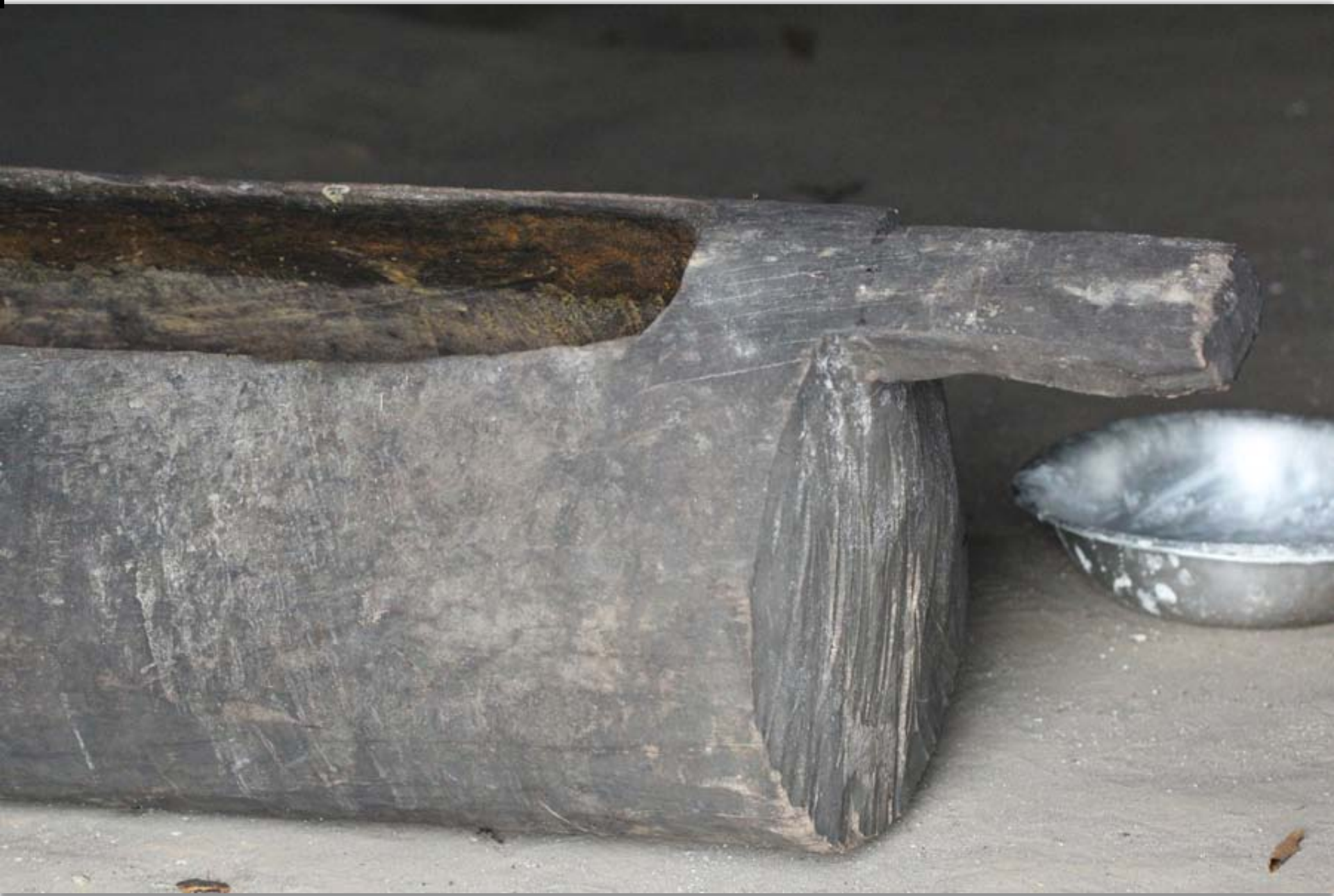
Trough to ferment caxiri