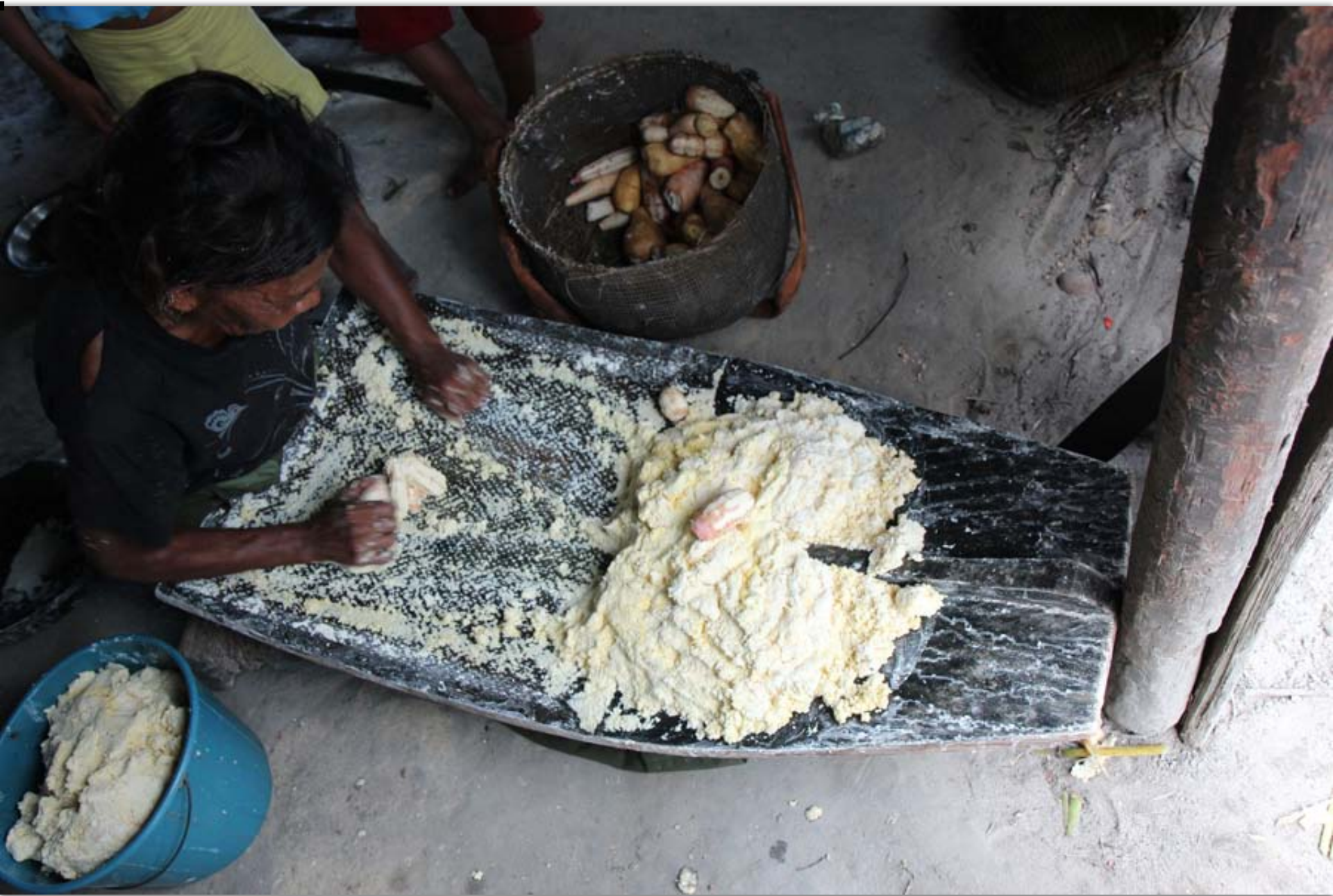
Manioc may be grated in different ways