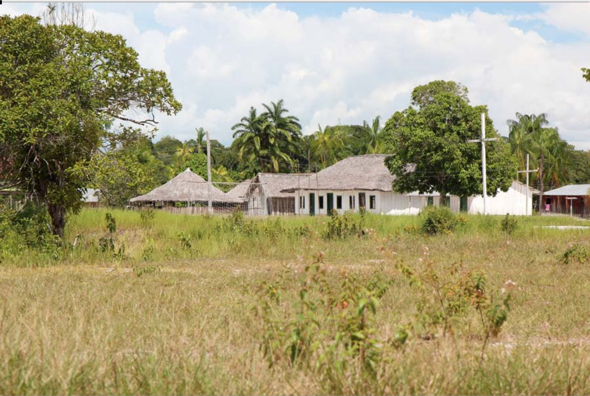
Monte Alegre, Uaupés River. It is in places like this that you can sling your hammock and sleep