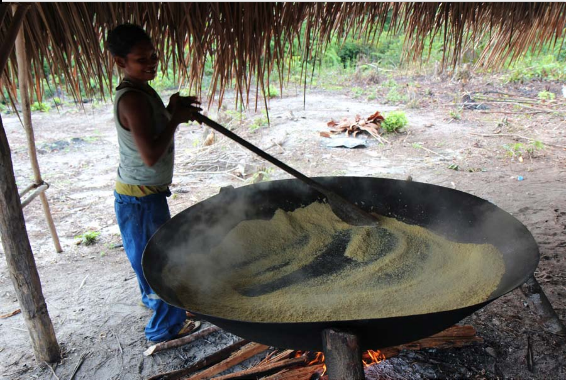
The flour is toasted