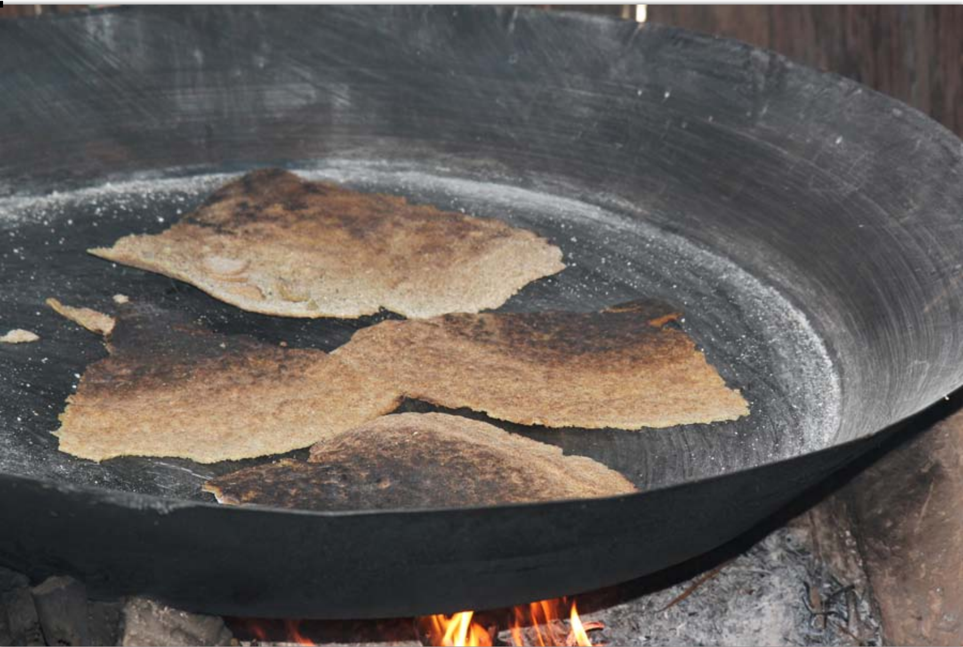
Toasted manioc to make caxiri