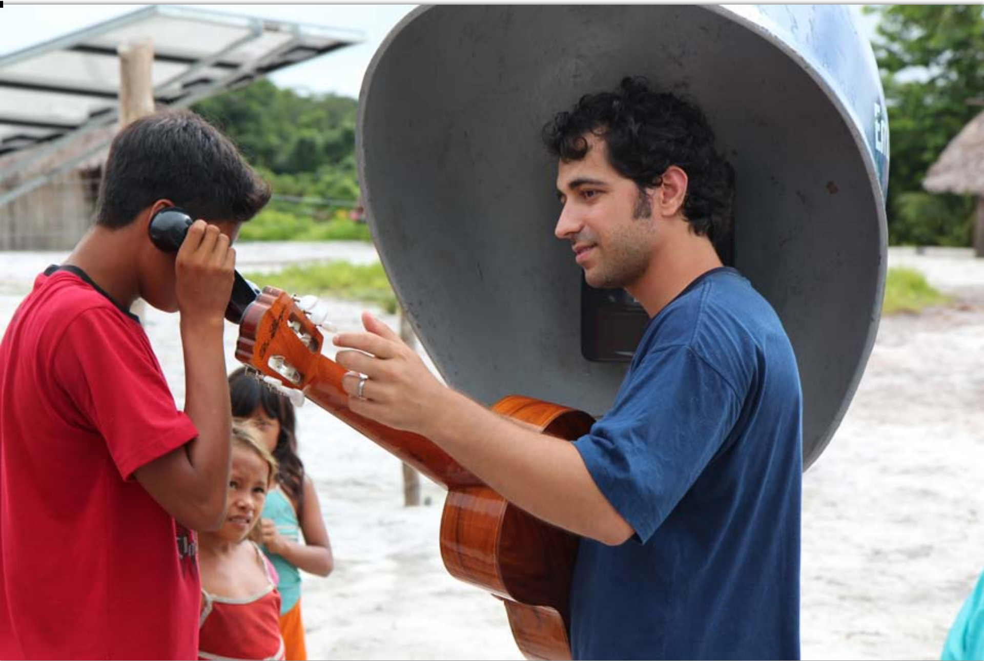
Tuning the guitar by the note la, emitted by the the telephone's dial tone