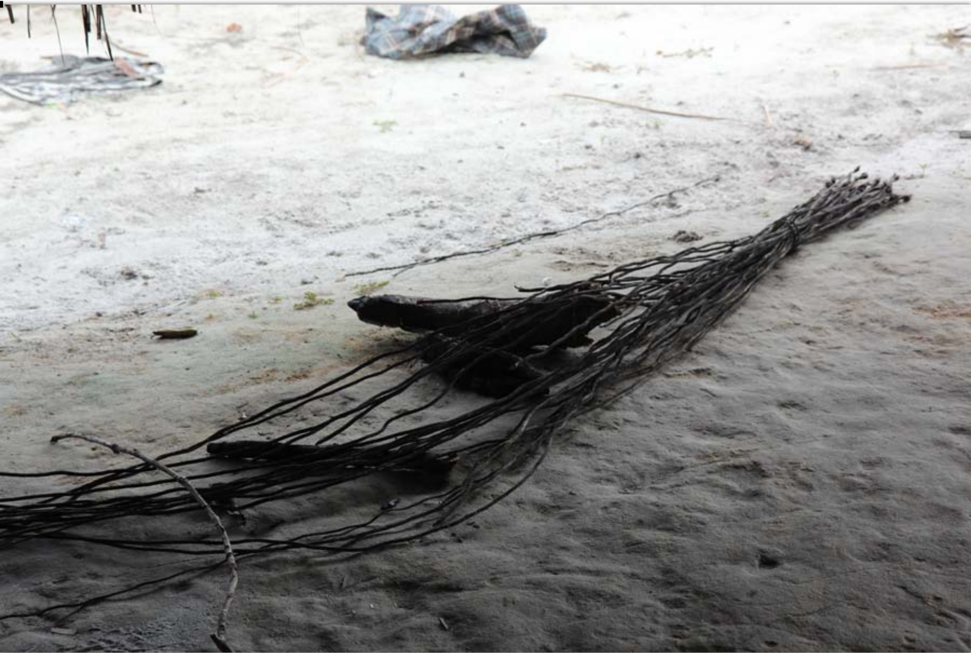
Vine to make baskets