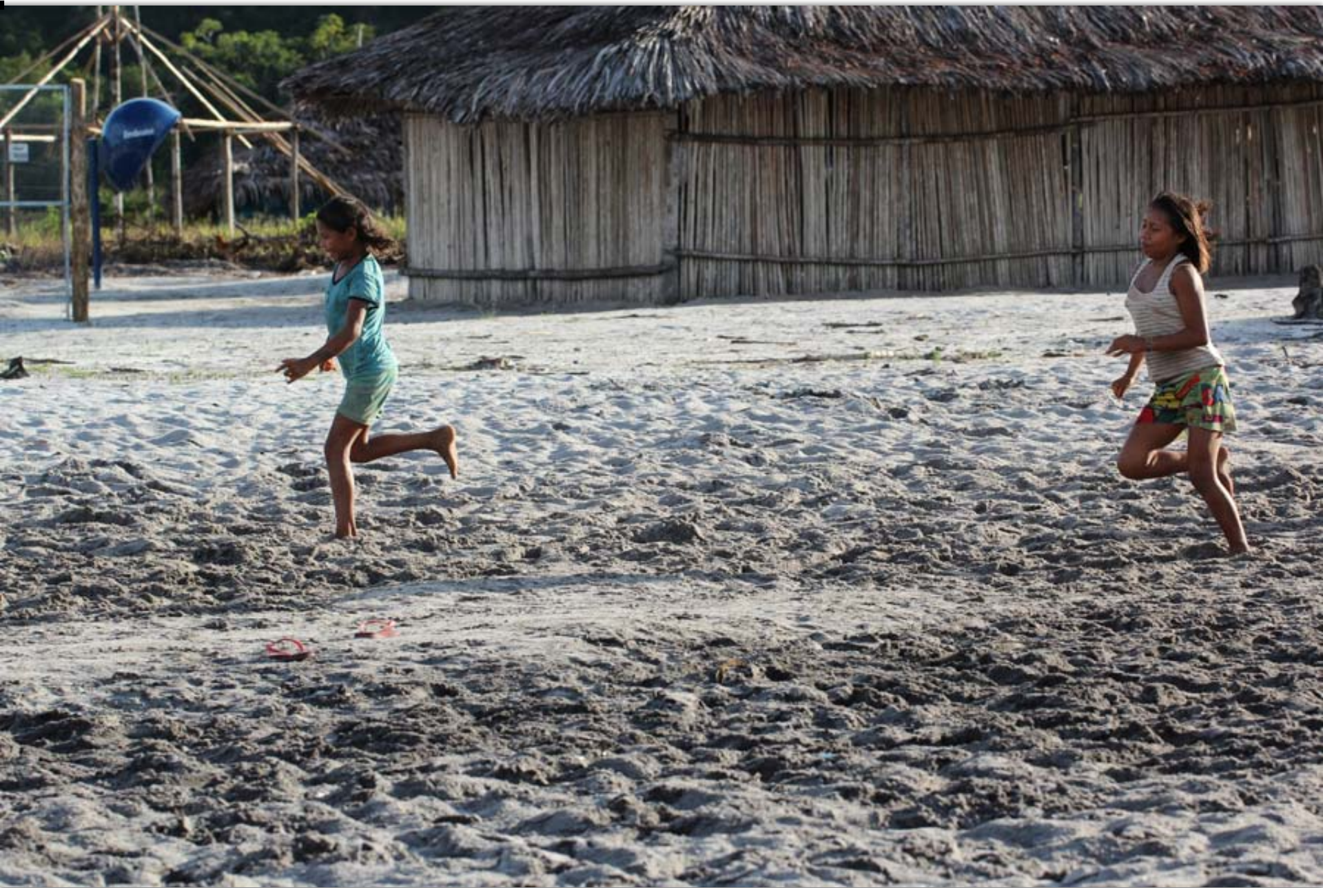
Girls' football in the sand in the centre of the village