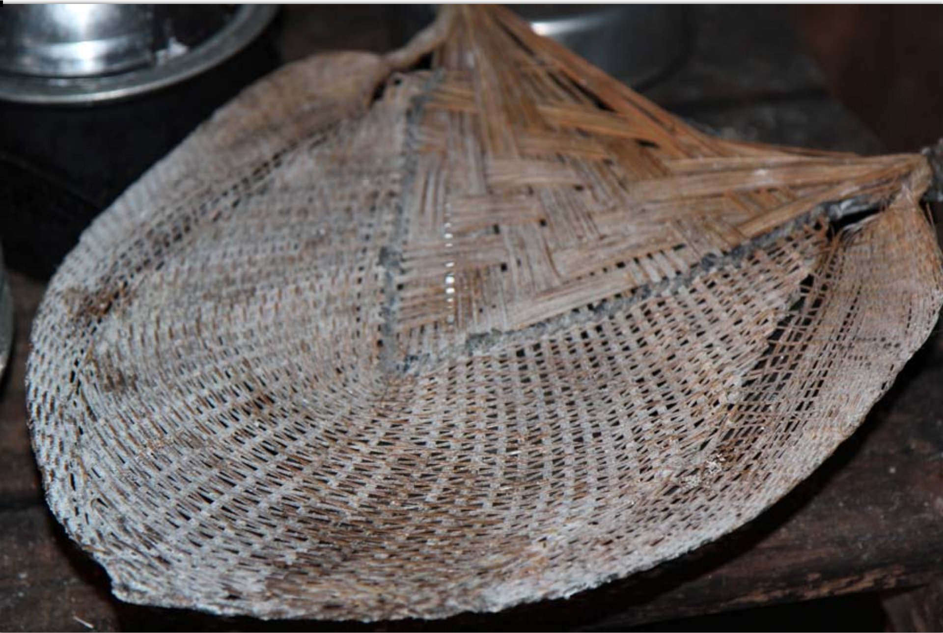
Fans, made of straw, are used to fan the fire and lift the beiju from the pan