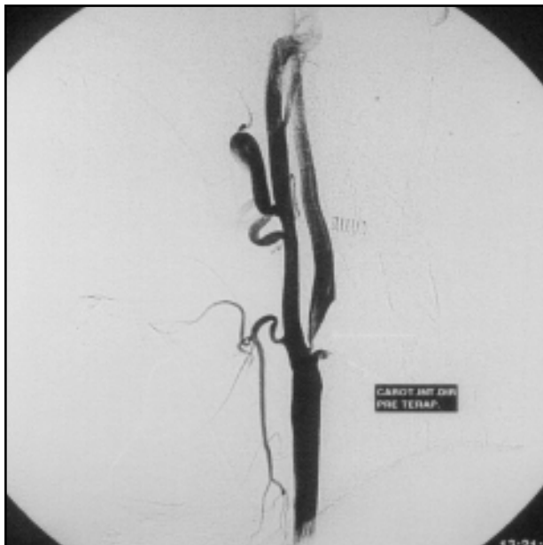
Fig 1. Ulcerated plaque with pre-operative stenosis.

Multiple cerebral protection systems are available, from occlusion balloon protection techniques to filter devices placed above the lesion. The occlusion balloon system is advanced across the area of stenosis, with a small caliber guidewire, angioplasty is performed with the occlusion balloon inflated. The angioplasty catheter (with its balloon deflated) is advanced just proximal to the occlusion balloon. Angioplasty debris is then flushed into the external carotid circulation, with the occlusion balloon deflated, avoiding the fragments from reaching the distal circulation 15-17 . The filter protection mechanism allows red blood cells flow, blocking only higher than 100 micra particles. Stenotic lesions can be treated even if severe contralateral disease is present 18,19 .