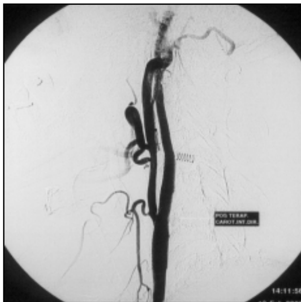
Fig 3. Internal carotid artery after endovascular therapy.

This study objective is to describe our experience in the percutaneous endovascular treatment of internal carotid artery stenosis with angioplasty and stenting with and without cerebral protection devices.