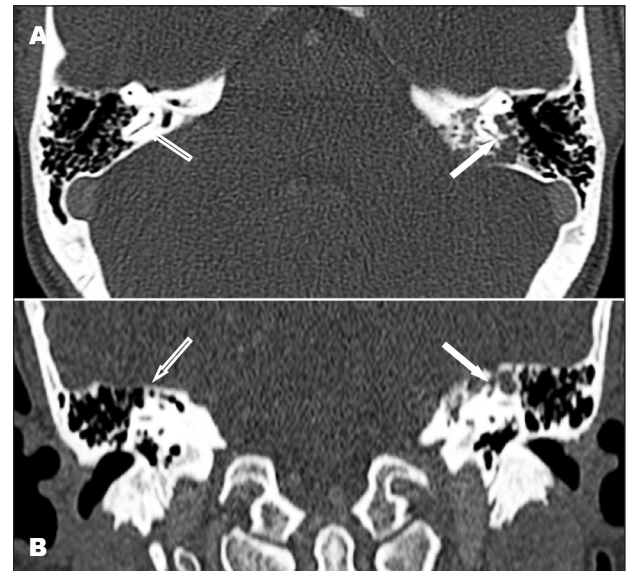
Fig 1. [A] Axial and [B] coronal CT show temporal bone erosion involving the endolymphatic sac and posterior semicircular canal at left side (solid arrow), compare with the normal contralateral structures (open arrow).

A female patient 15 years old, five years after the diagnosis