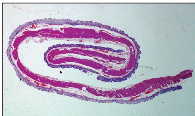
Figure 1 - Macroscopic photograph of histological section through the middle portion of the sigmoid, in which the intestinal ring was twisted on itself. Note the increased circumference and hypertrophy of the muscle tissue, as would be observed in cases of megacolon.

A segment of the large intestine fixed in formol was sent for anatomopathological examination. This segment was 60cm in length and consisted of the descending colon, sigmoid and proximal part of the rectum. It had a dilated appearance, with a maximum circumference of 19cm in the middle portion of the sigmoid. The tapeworms were spread out in the sigmoid. The wall was firm and thickened (0.2cm). The appearance was compatible with what is seen macroscopically in cases of Chagas megacolon. However, microscopically, no abnormalities suggestive of Chagas etiology were seen, such as hypoganglionosis, myositis and/or chronic ganglionitis (Figures 1 and 2). There were only sparse ischemic cells, rare mitoses in the muscle