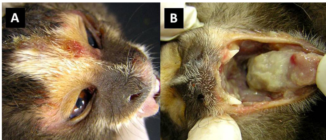
Fig.1. Fatal Human herpesvirus 1 (HHV-1) infection in marmosets. (A) The face has an ulcer covered with crusts. (B) Epithelium of the oral cavity and tongue is focally extensively ulcerated and covered with grey-whitish fibrinous plaques.