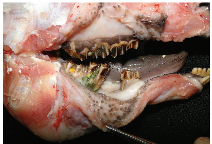
Fig.4. Sheep periodontitis: increased right mandibular body volume, loss of the third premolar and the presence of grass in the first molar observed in a post-mortem examination.