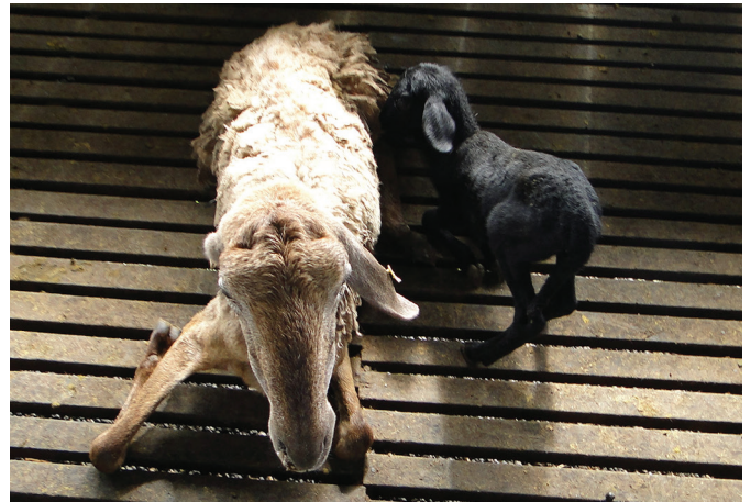
Fig.2. Sheep periodontitis: a newly lambed ewe exhibiting severe weakness and an inability to stand, and the lamb's attempt to suckle was unsuccessful.