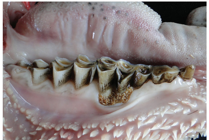
Fig.3. Sheep periodontitis: mandible of a young sheep from a post-mortem examination showing severe gingival recession with an accumulation of grass stalks in the third premolar (arrow) vestibular surface.