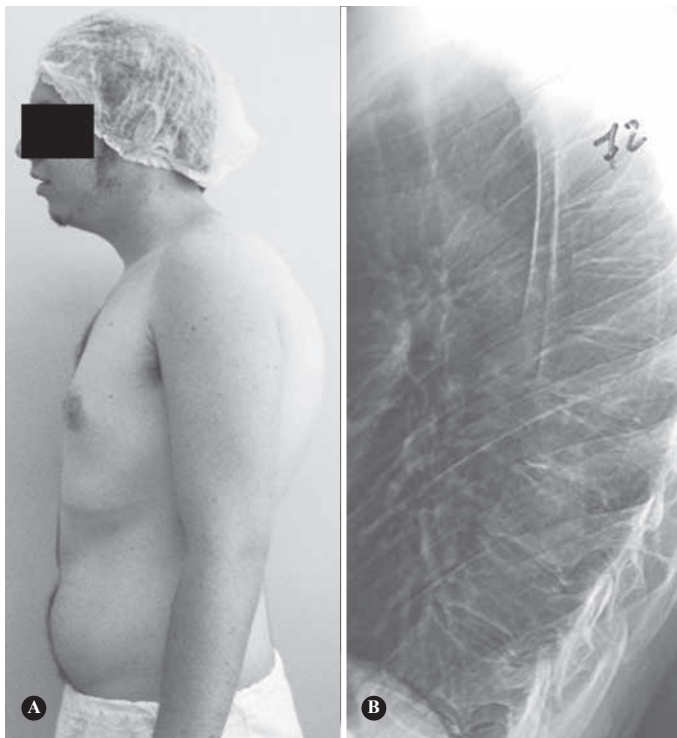
Figure 1 – A) Clinical presentation; and B) Radiographic presentation of Scheuermann's kyphosis.

The treatment for SK is still controversial. The tendency is to consider surgical treatment for patients with kyphotic curves of over 75°, with refractory pains on conservative treatment, unacceptable deformities, neurological deficits, and cardiopulmonary impairment (16) .