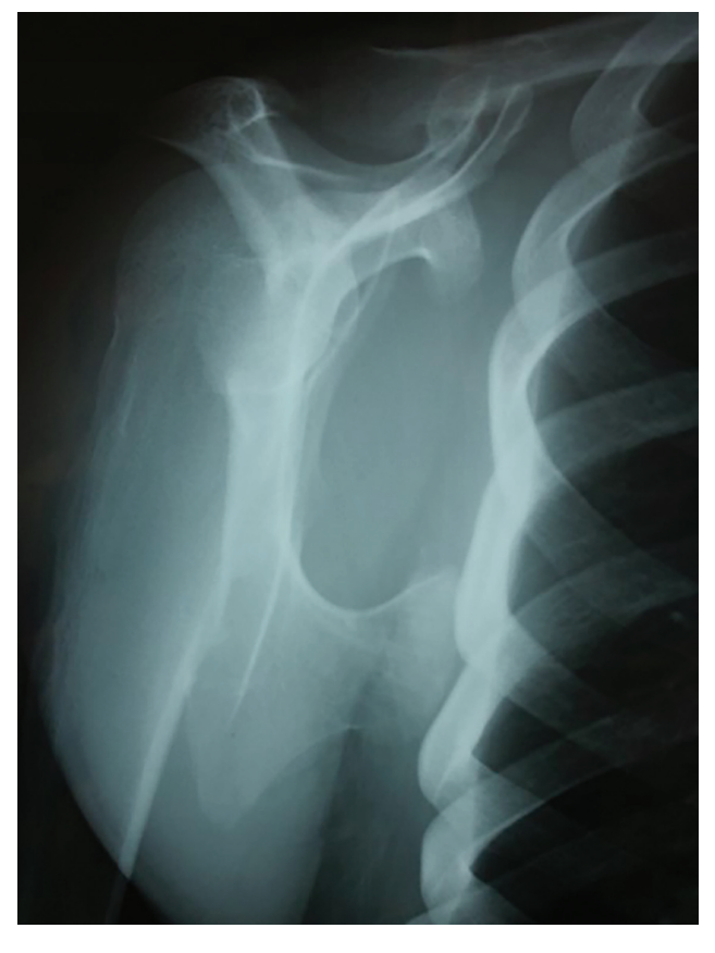
Fig. 1 Axial radiograph of the scapula showing an osteochondroma in the middle third of its anterior aspect.

Osteochondroma is the most common benign tumor in the metaphyseal region of long bones and rarely affects flat bones; however, it is the most frequent benign tumor in the scapula.<sup>2,3</sup>