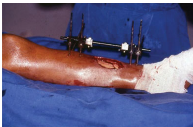
Fig. 2 Preoperative image.