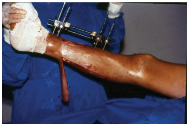
Fig. 3 Surgical image.