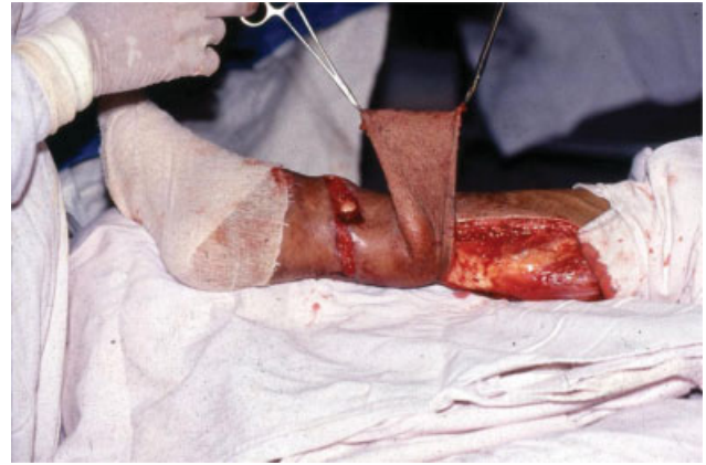
Fig. 8 Surgical image.