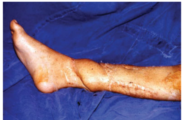
Fig. 10 Postoperative image.

offering good skin coverage and subcutaneous tissue for