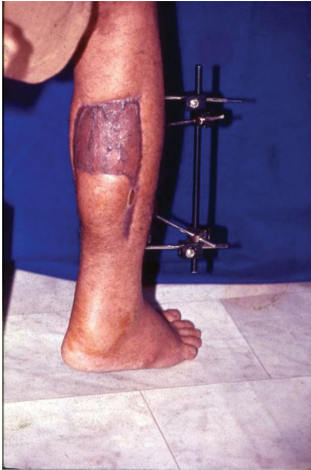
Fig. 6 Postoperative image.