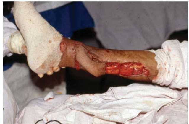
Fig. 9 Surgical image.