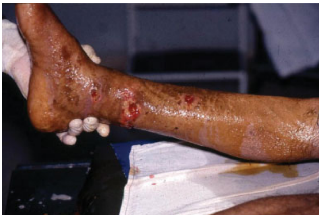
Fig. 7 Preoperative image.

offering good skin coverage and subcutaneous tissue for