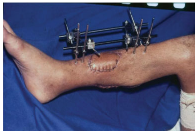
Fig. 5 Postoperative image.