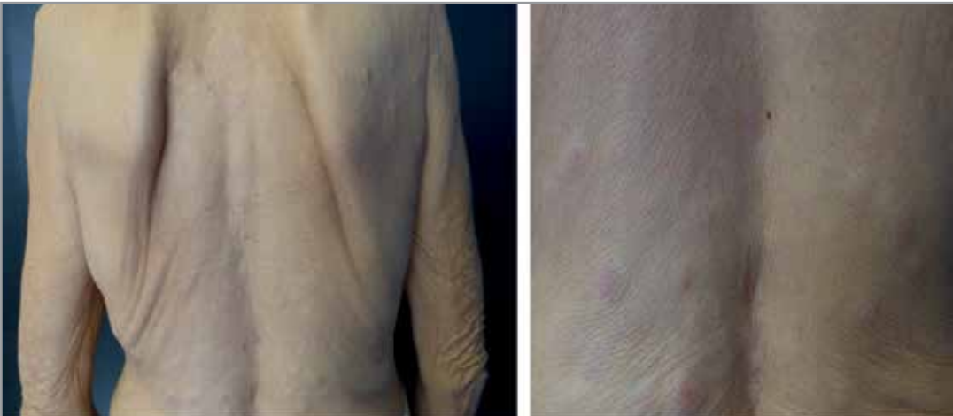
FIGURE 2: Papules and nodules on the back