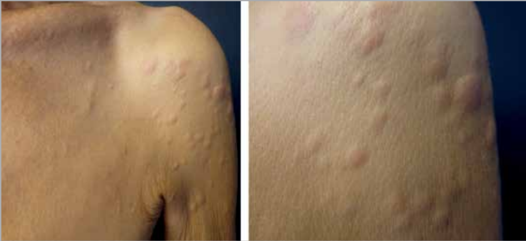
FIGURE 1: Papules and nodules on the left arm root