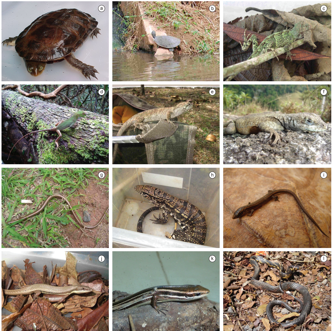
Figure 3. Some species of reptiles recorded in the municipality of Juiz de Fora, Minas Gerais, southeastern Brazil. a) Hydromedusa maximiliani ; b) Phrynops geoffroanus (Fonte:Marcelo Ribeiro); c) Enyalius brasiliensis ; d) Enyalius perditus ; e) Urostrophus vaultieri ; f) Tropidurus torquatus ; g) Ophiodes striatus ; h) Tupinambis merianae ; i) Ecleopopus gaudichaudii ; j) Placosoma glabellum ; k) Mabuya dorsivittata ; and l) Spilotes pullatus .

Figura 3. Algumas espécies de répteis registradas no município de Juiz de Fora, Minas Gerais, sudeste do Brasil. a) Hydromedusa maximiliani ; b) Phrynops geoffroanus (Fonte:Marcelo Ribeiro); c) Enyalius brasiliensis ; d) Enyalius perditus ; e) Urostrophus vaultieri ; f) Tropidurus torquatus ; g) Ophiodes striatus ; h) Tupinambis merianae ; i) Ecleopopus gaudichaudii ; j) Placosoma glabellum ; k) Mabuya dorsivittata ; e l) Spilotes pullatus .