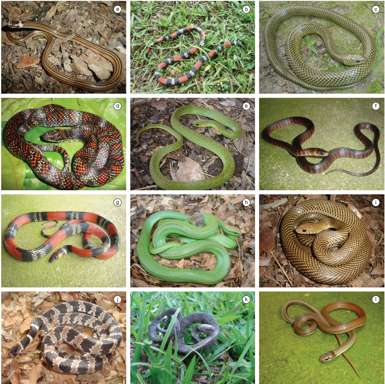
Figure 4. Some species of reptiles recorded in the municipality of Juiz de Fora, Minas Gerais, southeastern Brazil. a) Elapomorphus quinquelineatus ; b) Erythrolamprus aesculapii ; c) Liophis miliaris ; d) Liophis poecilogyrus ; e) Liophis typhlus ; f) Oxyrhopus clathratus ; g) Oxyrhopus guibeii ; h) Philodryas olfersii ; i) Philodryas patagoniensis ; j) Sibynomorphus mikanii ; k) Sibynomorphus neuwiedi ; and l) Taeniophallus affinis .

Figura 4. Algumas espécies de répteis registradas no município de Juiz de Fora, Minas Gerais, sudeste do Brasil. a) Elapomorphus quinquelineatus ; b) Erythrolamprus aesculapii ; c) Liophis miliaris ; d) Liophis poecilogyrus ; e) Liophis typhlus ; f) Oxyrhopus clathratus ; g) Oxyrhopus guibeii ; h) Philodryas olfersii ; i) Philodryas patagoniensis ; j) Sibynomorphus mikanii ; k) Sibynomorphus neuwiedi ; e l) Taeniophallus affinis .