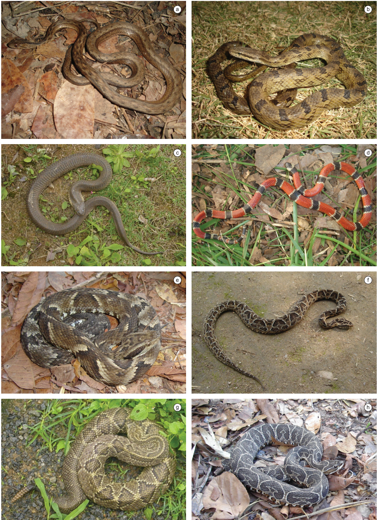
Figure 5. Some species of snakes recorded in the municipality of Juiz de Fora, Minas Gerais, southeastern Brazil. a) Thamnodynastes cf. nattereri ; b) Tropidodryas striaticeps ; c) Xenodon merremii ; d) Micrurus corallinus ; e) Bothrops jararaca ; f) Bothrops neuwiedi ; g) Crotalus durissus ; and h) Bothrops alternatus .

Figura 5. Algumas espécies de répteis registradas no município de Juiz de Fora, Minas Gerais, sudeste do Brasil. a) Thamnodynastes cf. nattereri ; b) Tropidodryas striaticeps ; c) Xenodon merremii ; d) Micrurus corallinus ; e) Bothrops jararaca ; f) Bothrops neuwiedi ; g) Crotalus durissus ; e h) Bothrops alternatus .