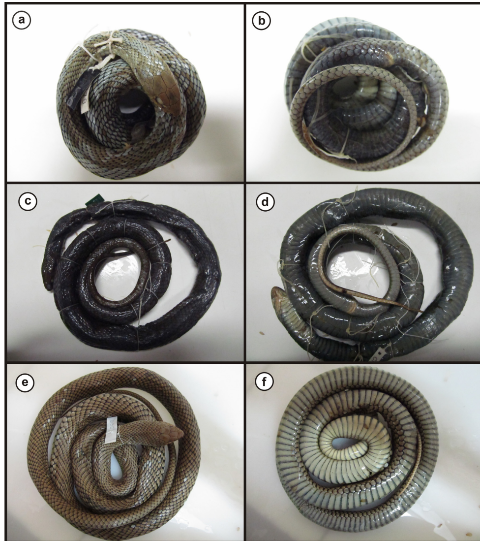
Figure 2. (A) Pattern of coloration 1 of specimen of Philodryas patagoniensis deposited in the Herpetological Collection of Universidade de Brasília (CHUNB), dorsal view. (CHUNB 3779, Brasília - DF). (B) Pattern of coloration 1 of specimen of Philodryas patagoniensis deposited in the Herpetological Collection of Universidade de Brasília (CHUNB), ventral view. (CHUNB 3779, Brasília - DF). (C) Pattern of coloration 2 of specimen of Philodryas patagoniensis deposited in the Herpetological Collection of Universidade de Brasília (CHUNB), dorsal view. (CHUNB 19337, Brasília - DF). (D) Pattern of coloration 2 of specimen of Philodryas patagoniensis deposited in the Herpetological Collection of Universidade de Brasília (CHUNB), ventral view. (CHUNB 19337, Brasília - DF). (E) Pattern of coloration 1 of specimen of Philodryas patagoniensis deposited in the Herpetological Collection of Museu de Zoologia João Moojen of Universidade Federal de Viçosa (MZUFV), dorsal view. (MZUFV 1369, Tocantins - MG). (F) Pattern of coloration 1 of specimen of Philodryas patagoniensis deposited in the Herpetological Collection of Museu de Zoologia João Moojen of Universidade Federal de Viçosa (MZUFV), ventral view. (MZUFV 1369, Tocantins - MG).