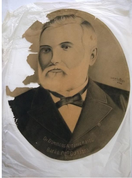
Photograph 2. The Baron of Guajará in a photo painting by Lúcia L. Alves