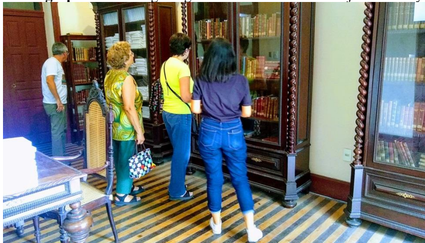
Photograph 5. Visitors getting to know the Baron of Guajará's library

Moreover, visitors are taken to explore the room that currently houses the Baron of Guajará's library (Photograph 5). As an expôt , i.e., with a set of objects exposed to public view (POULOT, 2013), the books contain external elements subject to visual perception. These elements are given by the characteristics of bindings, by the colors on the covers, by the physical dimensions of the books, by the name (s) of the author (s) and title printed on the spine, by the bookmarks, and by the typographic features that allow the identification of the books as part of a collection, as well as the most obvious and sometimes superficial aspects of the conservation status of specimens. The language of publications and topics suggested by titles provide visitors with an idea of the Baron of Guajara's reading preferences.