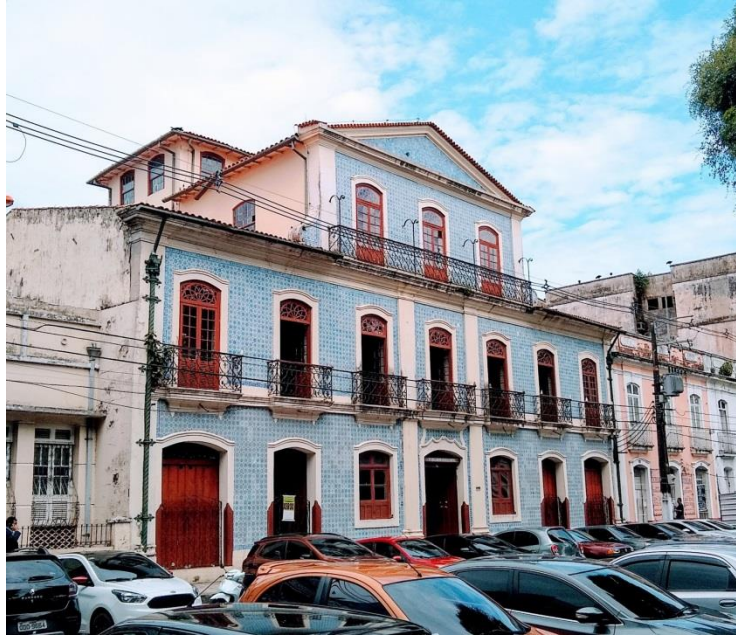
Photograph 1. View of the façade of the Solar do Barão de Guajará , the headquarters of IHGP