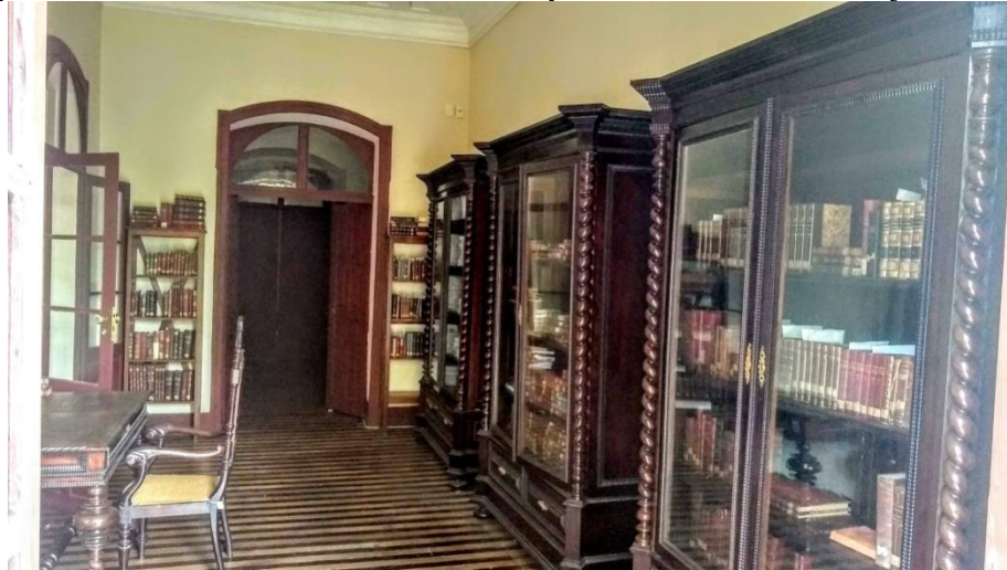
Photograph 3. View of the IHGP room that currently houses the Baron of Guajara’s library