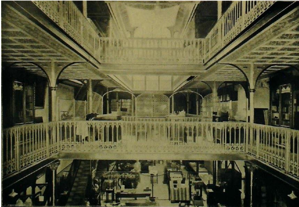
Photograph 9. The refinement of the Universal Bookstore that belonged to Tavares Cardoso