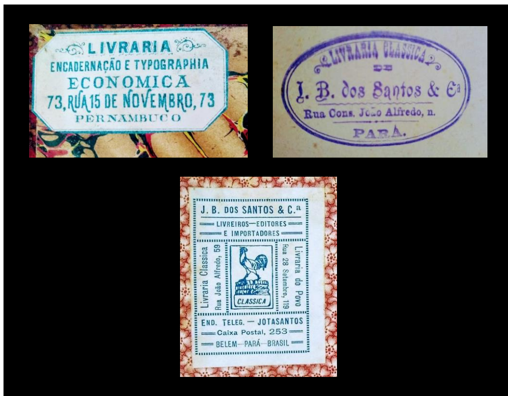
Photograph 8. Seals and stamp of certain bookstores in Belém in the 19th century