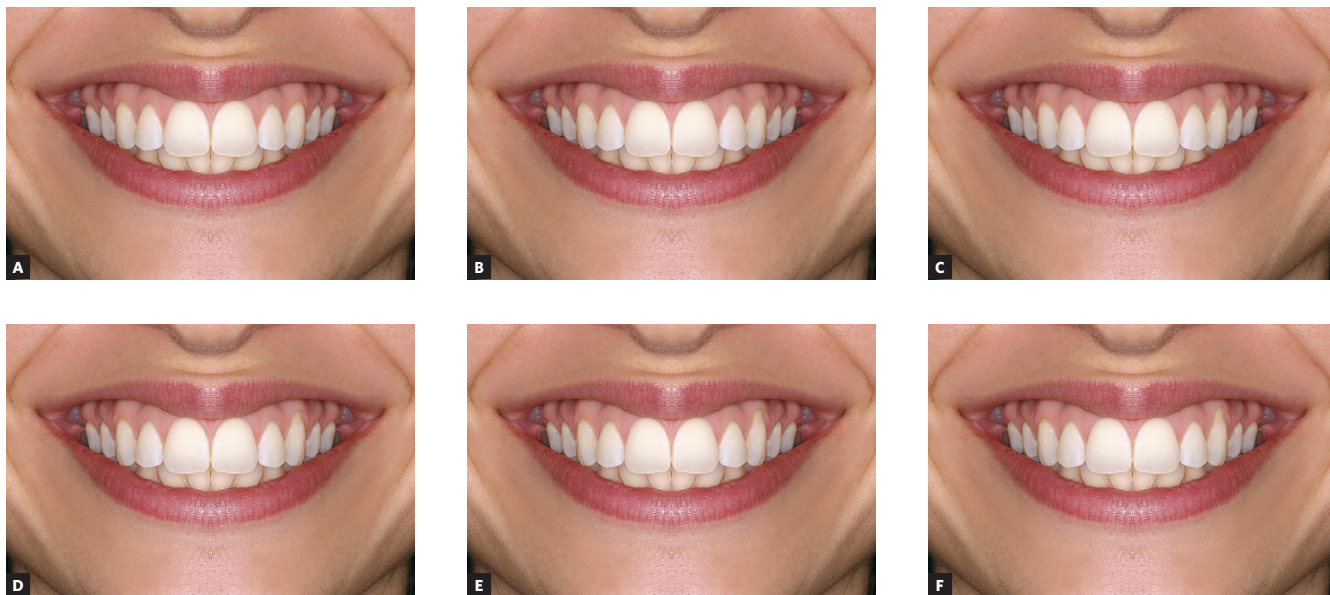
Figure 1 - Frontal view of all unilateral gingival recession smiles, in 0.5-mm increments: A) 0mm; B) 0.5mm; C) 1.0mm; D) 1.5mm; E) 2.0mm; F) 2.5mm.

After the above procedures, the control smile (symmetrical, with no gingival recession) was manipulated to create 12 new smiles: 6 in frontal view (Fig 1) and 6 in oblique view (Fig 2). In order to do this, the gingival margins were apically displaced, leading to an increase in the tooth length and root surface exposure, using the patients' original gingival recession lesion as a template to create all other smiles.