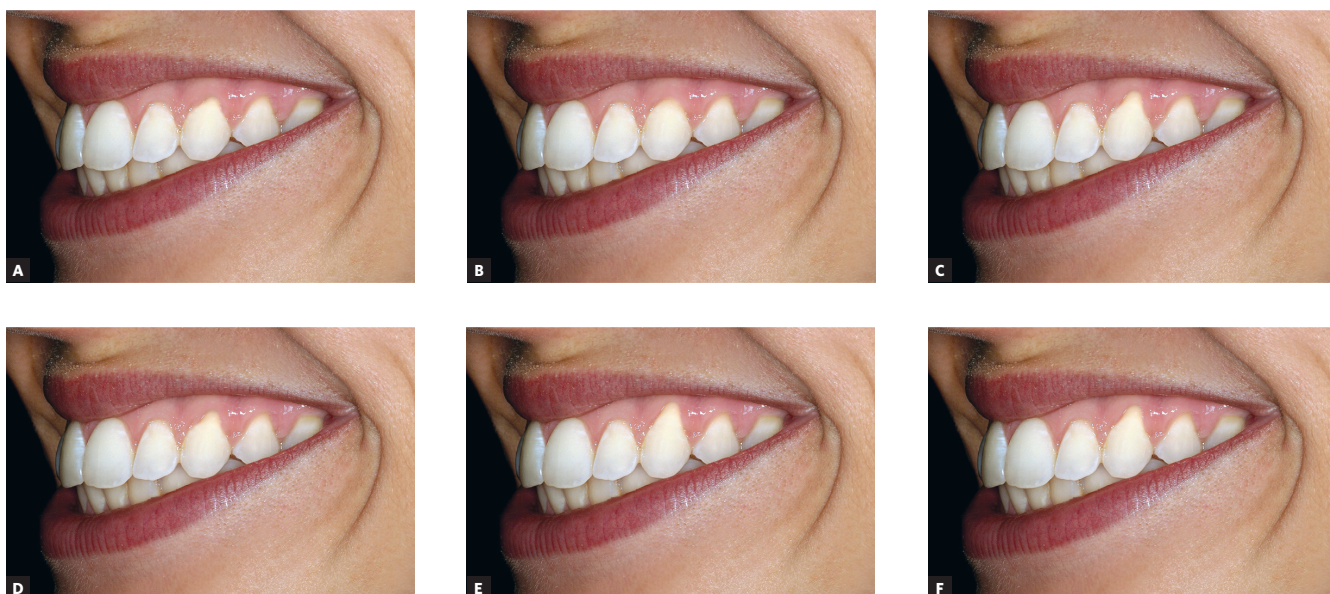
Figure 2 - Oblique view of all unilateral gingival recession smiles, in 0.5-mm increments: A) 0mm; B) 0.5mm; C) 1.0mm; D) 1.5mm; E) 2.0mm; F) 2.5mm.