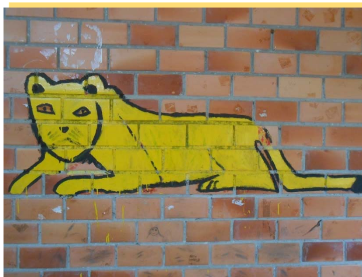
Image 6 – Painting done in a classroom of the Karai Arandú school.

The works seen at the museum in little resembles what they produce at the school in the curricular discipline called arts. The guarani drawings, paintings and graphisms on the walls and columns of the school or in the classrooms are an evidence of creation processes of ethnic and political affirmation, and appropriation of school spaces. Likewise, we highlight that guarani aesthetic expressions, such as their paintings, can be understood as political practices of decolonial aesthetic in education. We also realized a probable difference in the understandings of the art concept. For the juruá , the artistic practice has multiple creation and expression understandings, while for the guarani, its understanding is utilitarian and sacred. With which concepts do the guarani people visit the museum? What are their inner questions about the art presented?