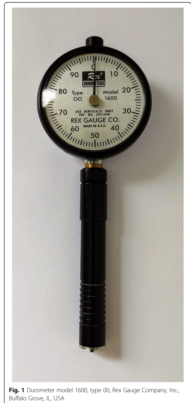
Fig. 1 Durometer model 1600, type 00, Rex Gauge Company, Inc., Buffalo Grove, IL, USA

room temperature, with relaxed muscles. For mRSS, skin thickness was assessed as previously described [7]. Briefly, each of the 17 predetermined skin areas was scored from zero to three, according to severity of skin thickness, the final added score from all 17 areas ranging from zero to 51 points [6]. For durometry, a portable dial analog durometer (model 1600, type 00, Rex Gauge Company, Inc., Buffalo Grove, IL, USA) was used to measure skin hardness. The durometer (Fig. 1), an equipment of 2.5"×6.125" and 6 oz., is the international standard for the hardness measurement of rubber,