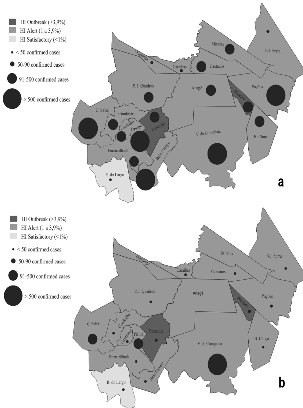
Figure 3. Home Infestation Index (HI) and distribution of reported cases in Southwestern Region of Bahia - Brazil, for ZIKV (2015 to 2016) and DENV (2010 to 2015). (a) Variation of HI relative to cases of DENV. (b) Variation of HI relative to cases of ZIKV. Municipalities: B. Choça - Barra do Choça; B. Campo - Belo Campo; B. J. da Serra- Bom Jesus da Serra; C. Sales-Cândido Sales; P. J. Quadros - Presidente Jânio Quadros; R. Largo - Ribeirão do Largo; V. da Conquista - Vitória da Conquista. The HI corresponds to the proportion of properties positive (with larvae and/or pupae of A. aegypti and/or A. albopictus ) in relation to the total of properties inspected. The HI colors attributed to the municipalities took into consideration the annual classification of HI of the municipalities in more than 50% of the analyzed years (four to six years). Circles indicate the number of reported cases of arboviruses per municipality considering the six years studied. The size of the circles reflects the number of cases reported. Sources: Sistema de Informação da Febre Amarela e Dengue (SISFAD) and Sistema de Informação de Agravos de Notificação (SINAN).