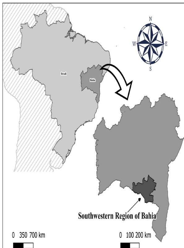
Figure 1. Location of Southwestern Region of Bahia - Brazil.

The sociodemographic characteristics of the studied municipalities are described in Figure 2. The total population of the 19 municipalities is 632,708 inhabitants, with Vitória da Conquista as the most populous municipality, with 306,866 inhabitants, and Maetinga as the least populous municipality, with 7,038 inhabitants. Most of the residences in the 19 municipalities are located in rural areas and only Poções and Vitória da Conquista have more than 50% of homes