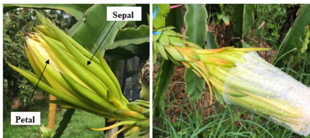
Figure 1. Flower with signs of opening and flower covered with plastic cup.

An experiment was conducted with a randomized block design composed of four treatments: T1: manual self-pollination (pollen placed on the stigma of the same flower); T2: nocturnal open pollination (flowers not covered with a plastic cup during the night); T3: diurnal open pollination (flowers not covered with a plastic cup during the day); and T4: manual cross-pollination (red-fleshed pitaya [ Hylocereus polyrhizus ] pollen placed on white-fleshed pitaya [ Hylocereus undatus ] stigma). The experiment had four replicates, with two plants per replicate (two flowers per plant), totaling 16 flowers per treatment. The treatments were applied and evaluated in two crop years (2019 and 2020).