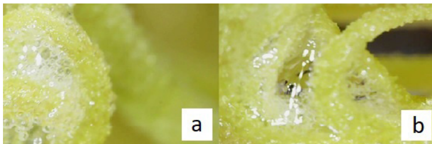
Figure 2. Viscous and humectant aspect of the stigma after immersion in hydrogen peroxide. Stigmas that present bubbles are considered receptive. Where a: Stigma of receptive white-fleshed pitaya flower; b: Receptive red pulp pitaya flower stigma.

plastic cups to protect the flowers, without a significant difference (Table V).