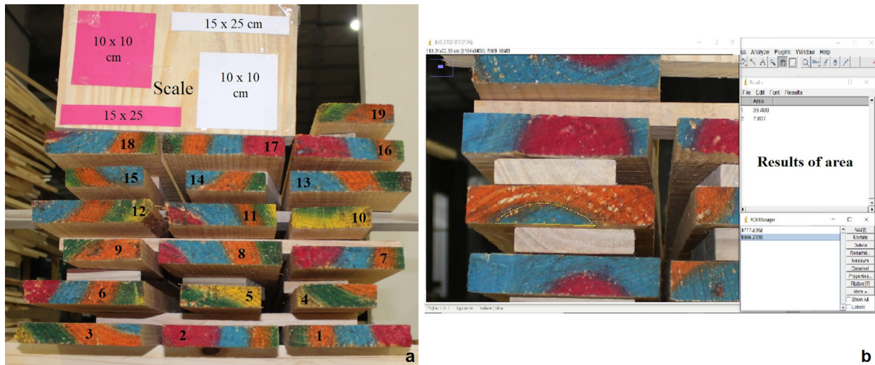
Figure 2. Example of wood Pinus taeda boards positioned by numbers (a) to marking and calculating of area by image analysis at software ImageJ (b).

The statistical data analysis followed the next steps: (a) all boards (n = 113) were classified by the MOE within each stiffness class as recommended by EN 338 (2016). Next, according to the number of boards the percentage of the representativeness of each stiffness class was calculated; (b) aiming to identify the MOE value that JW proportion starts to increase in relation to the AW, a dispersion plot of the data with the intersection between JW and AW tendency lines was made; (c) Pearson’s correlation among all color variables versus MOE and versus density was run with 5% of significance; (d) before linear regression models, all data was processed by an analysis graph to identify possible outliers, which did not occur; (e) multiple linear regression model with all colors was tested (Eq.